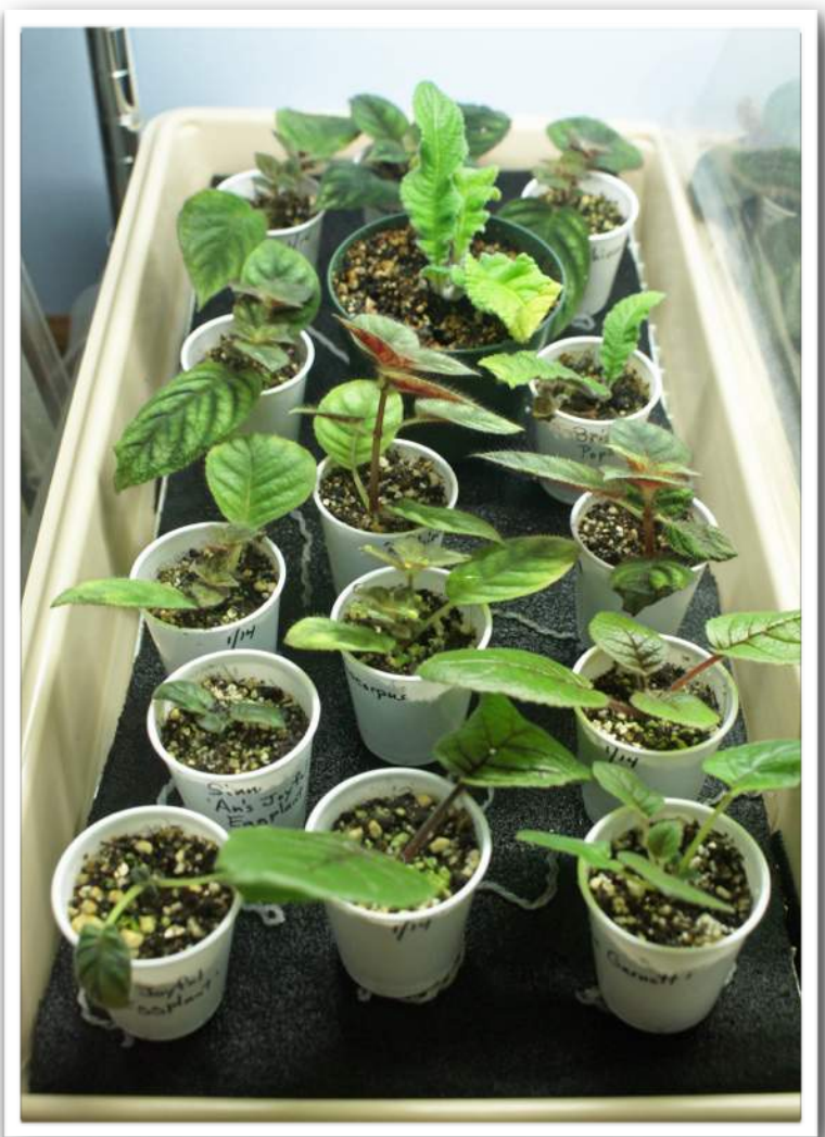
Photo on the right shows just a few of the special gesneriads being propagated for plant sales at this summer's convention.

http://gesneriadsociety.org/Conv2014/index.htm