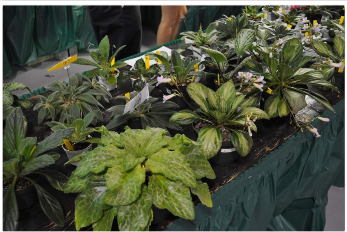
Some of the plants offered for sale