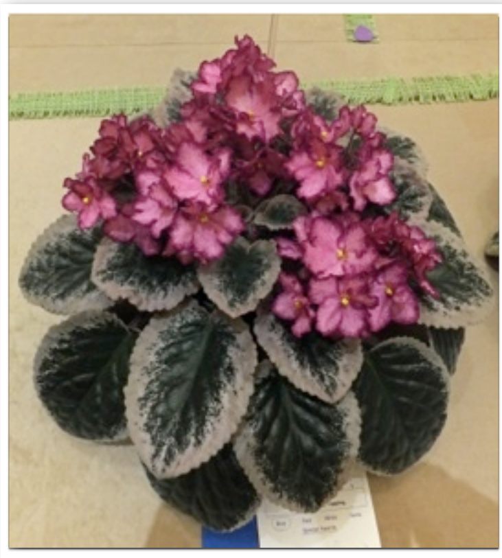
Saintpaulia 'Buckeye Cherry Topping' Sandy Skalski