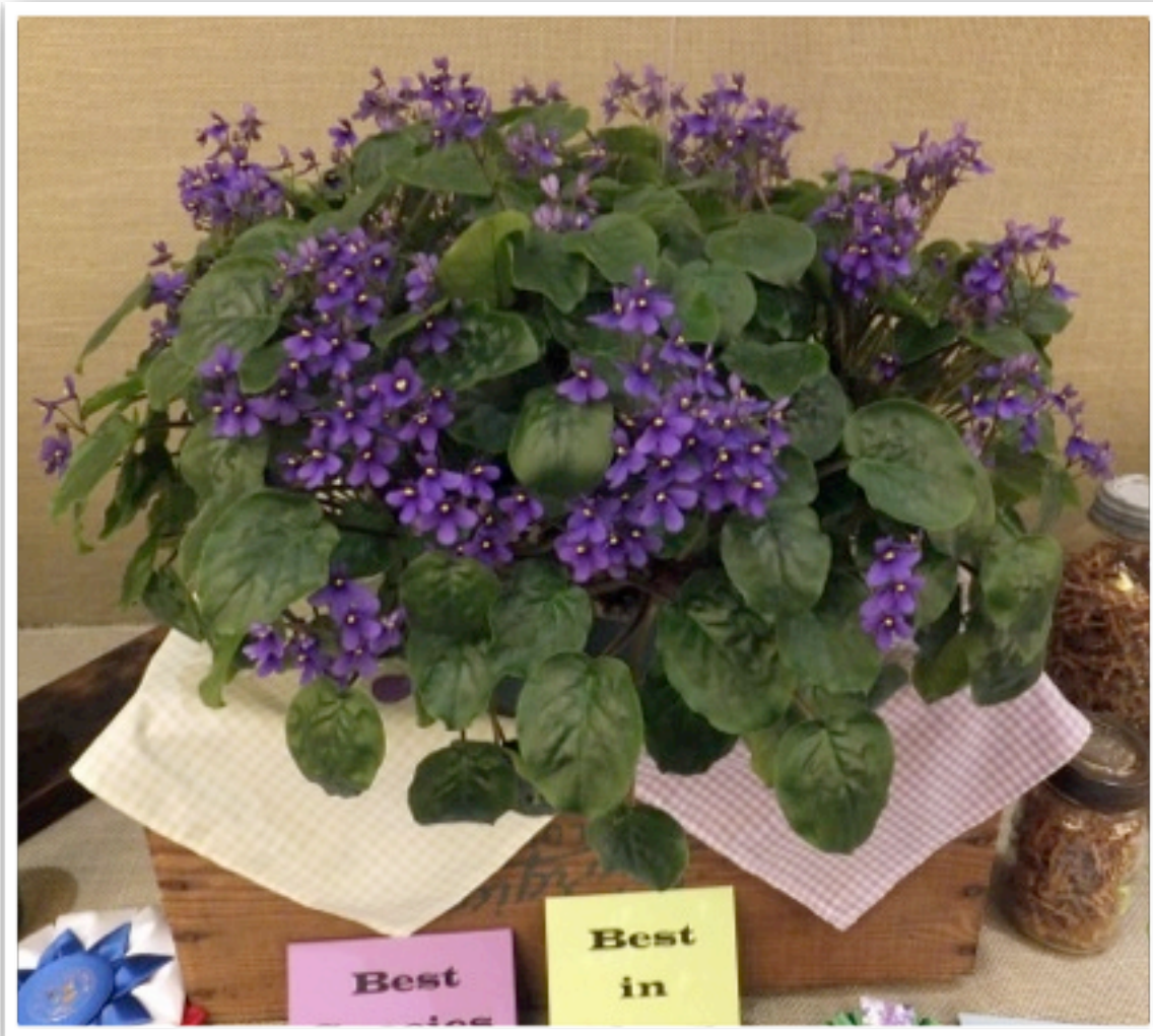
Saintpaulia 5f clone orbicularis var. purpurea Sandy Skalski