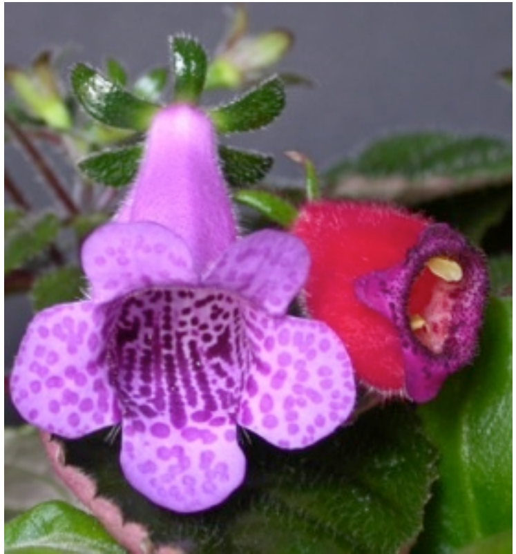
Gloxinia perennis (left); \times Gloximannia 'She's Dancing' (right) and its father, which is Seemannia gymnostoma \times S. purpurascens

that the plant used as the seed parent must be overwhelmed with pollen from the "foreign" genus. When each stigma is receptive, I pollinate every single open flower with pollen from the other genus. It is not unusual when making intergeneric pollination attempts to see the collapse of the pedicel (the small stalk bearing the flower). This can occur anywhere from within one hour of pollination to the next day. Often the seedpod (or fruit) is not nearly as plump as it would be if the plant were pollinated within its own genus. So don't be discouraged.