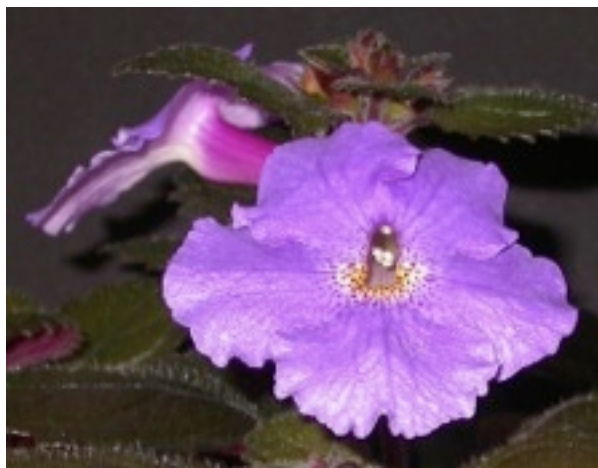
× Achimenantha 'Texas Blue Bayou'