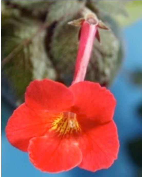
Mel Grice photo

I put pollen from anything blooming onto different genera to see if they'd cross. Then I did some research and found that for successful hybridizing the chromosome numbers of the two parents need to be about the same. For example, Smithiantha and Eucodonia have the same chromosome number: 2n = 24 . Therefore, the odds of success in creating a hybrid between these genera are encouraging. But the number of chromosomes doesn't have to be exactly the same.