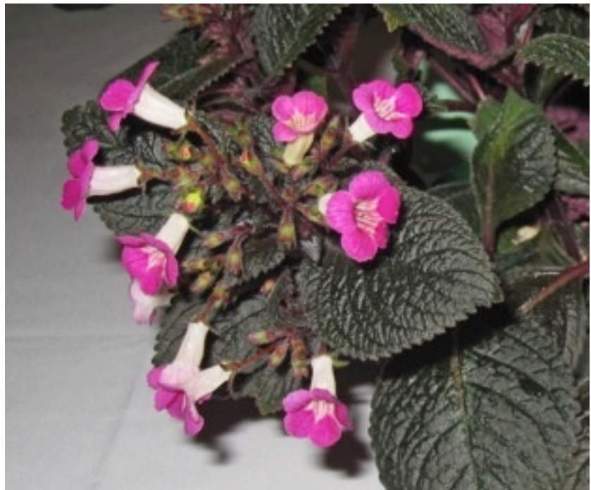
\times Phinastema 'California Dreaming'

To be successful, all it takes is for one seed to mature. One caution is to give the seed lots of time to sprout. My Phinaea albolineata \times Diastema comiferum cross took several months to sprout and I got just three seedlings. Often the