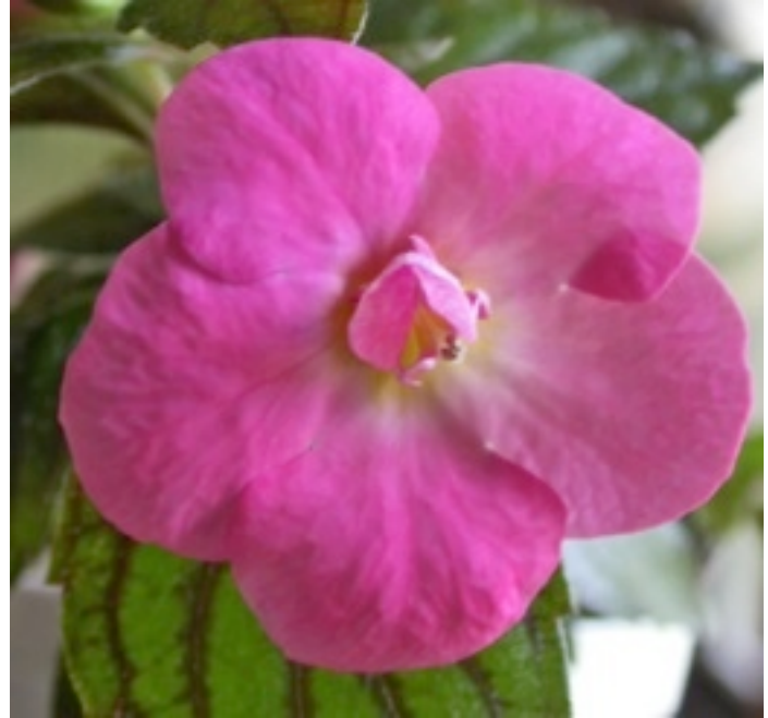
\times Achimenantha 'Golden Jubilee' (above photo) is a selfing of \times Achimenantha 'Inferno' (left)

There seem to be quite a few \times Achimenantha hybrids, which is interesting, since the chromosome number for Achimenes is 2n=22 , while that of Smithiantha is 2n=24 . This demonstrates that an intergeneric hybrid can be created even if the numbers are not exactly identical. Surprisingly, many of these Achimenes \times Smithiantha hybrids are fertile. Another interesting thing about \times Achimenantha is the flowers of modern-day cultivars tend to look more like the flowers of Achimenes and not like the flowers of Smithiantha .