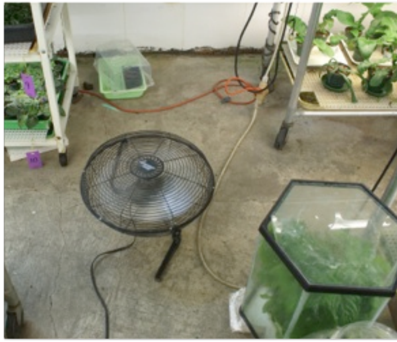
(above) Floor fan directs air toward the ceiling