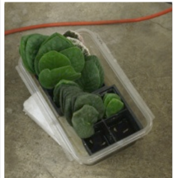
(below) Saintpaulia leaves placed in water in nursery flats awaiting propagation