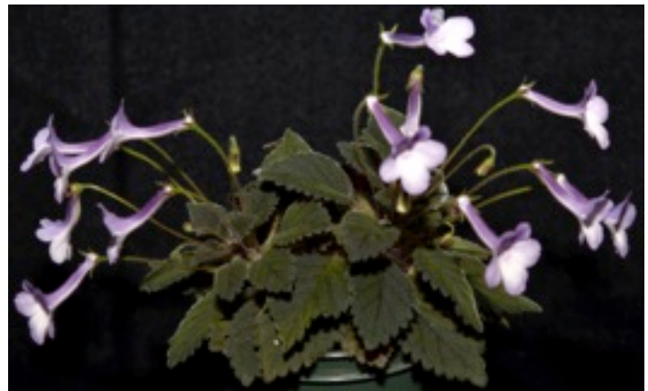
Sinningia 'Li'l Georgie', grown by Bill Price, photo: Winston Goretsky

When buying plants for a miniature garden, gardeners want a tiny flowering plant to fit into their scene, but there are very few appropriate plants on the market. They are surprised to find Sinningia 'Li'l Georgie' and happy with how it looks.