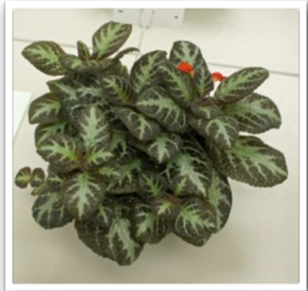
Episcia cupreata