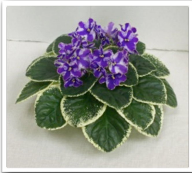
Saintpaulia 'Ma's Blue Spinner' Marge Farrand - Best in Show