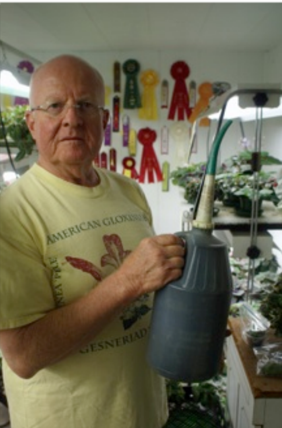
(left) Paul's favorite watering aid