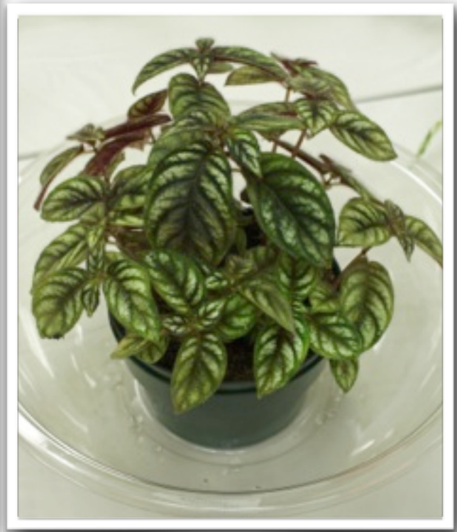
Raphiocarpus petelotii Mel Grice