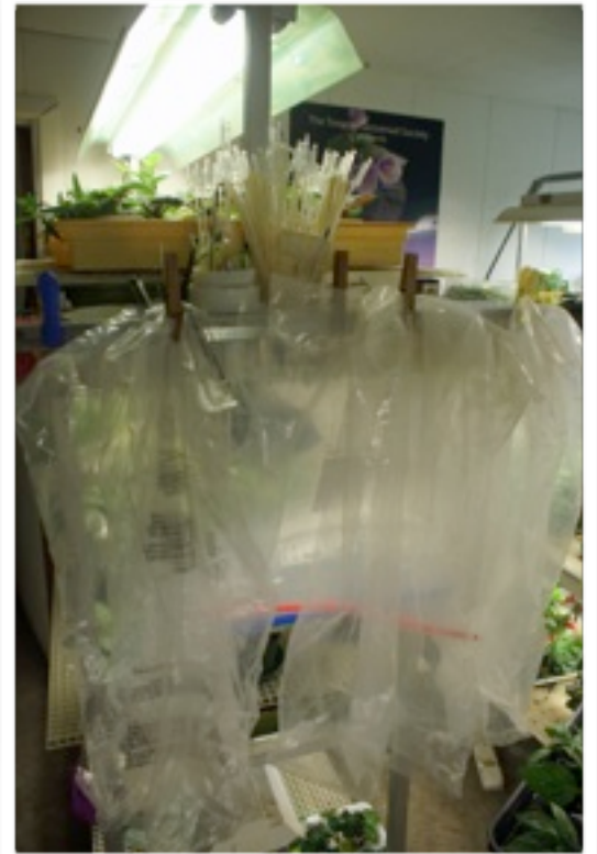
(upper right) Plastic bags, sticks, labels, etc. hang from basket attached to side of light stand