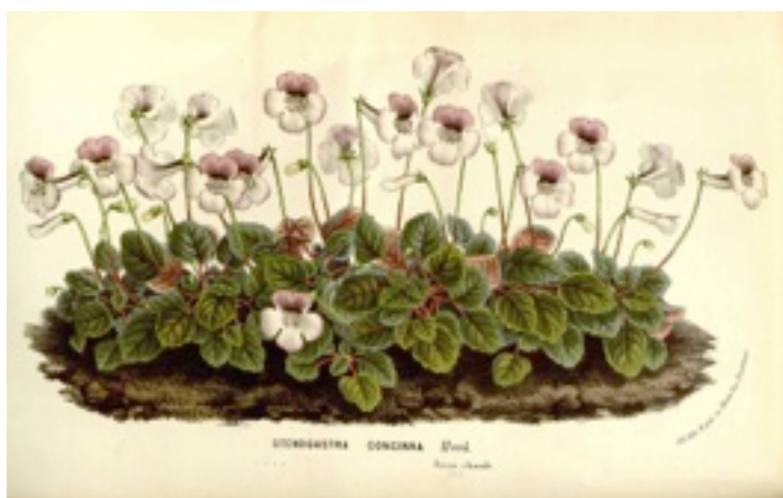
Sinningia concinna , one parent of S. 'Li'l Georgie'. 1861 botanical illustration (as Stenogastra ).

Will S. 'Li'l Georgie' be the second most successful sinningia in commercial horticulture behind the Florist Gloxinia? It could be. In fact, it could become the leading flowering plant in the Miniature Gardening category – the most significant breakthrough of my lifetime.