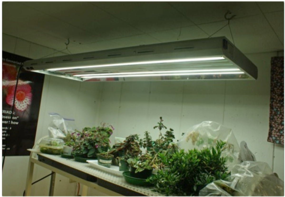
(above) Six tube fixture (with two tubes not lit) provide extra light for some genera that require extra light