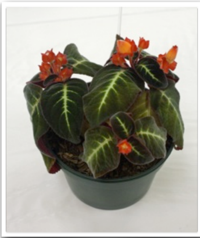
Corytoplectus cutucuensis Mel Grice