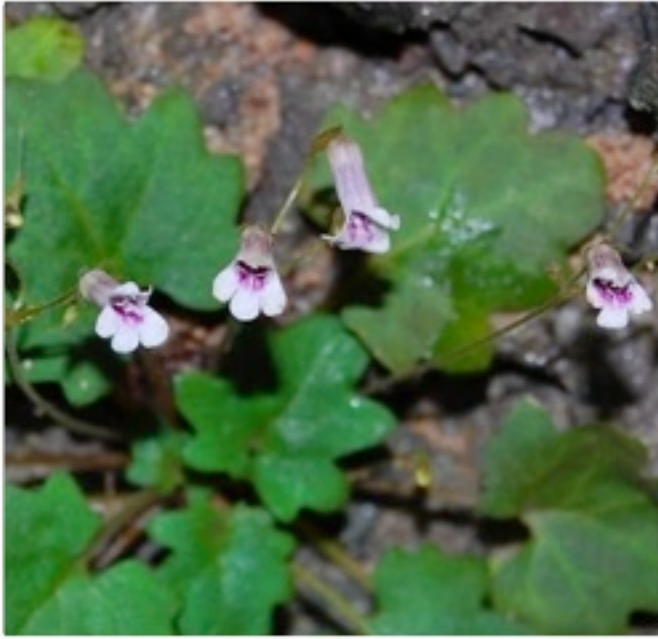
Primulina maciejewskii sp. nov.

valley is protected by the local government and any type of collecting, even of seeds, is prohibited. Why? This is the only known location of this species. At the Green Lion Reservoir we discovered a new population of Oreocharis xiangguiensis and at the Li River Gudong Scenic Area we saw a large stand of Hemiboea cavaleriei .