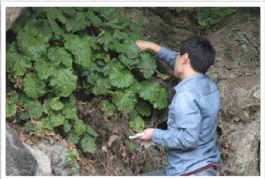
Primulina tabacum

One of the notable aspects of the trip was that gesneriads were found not only growing in the countryside and along the road, but also in city parks and national scenic areas. On our first day out we saw four gesneriad species, including Primulina eburnea and Primulina longicalyx , in the Seven Star Scenic Area, just outside Guilin. Later on, in Ling Fong Square Park in Hezhou City, we saw a large clump