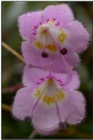
Oreocharis dayaoshanioides

As for food during the trip, all the meals were