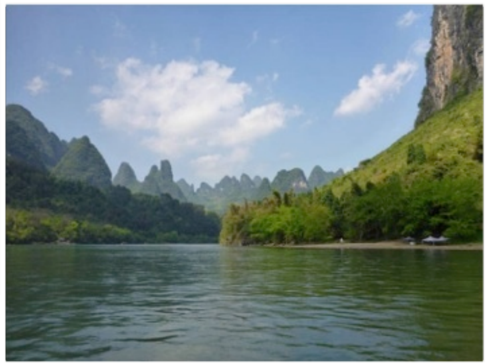
Li River cruise

exceptional. Breakfast Chinese style was a new experience for all of us – steamed cabbage, corn on the cob, rice noodles, fresh fruit, in addition to rice congee. Lunch and dinner were satisfying, with hardly a dish repeated in all the meals we ate. We had a Chinese barbeque lunch (again, probably a first for most of us), where you select your own food and cook it at your table. The most recognizable meals, at least to this writer, were the dishes at the two dim sum breakfasts we had.