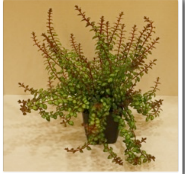
Columnea 'Goldheart' Terri Campbell