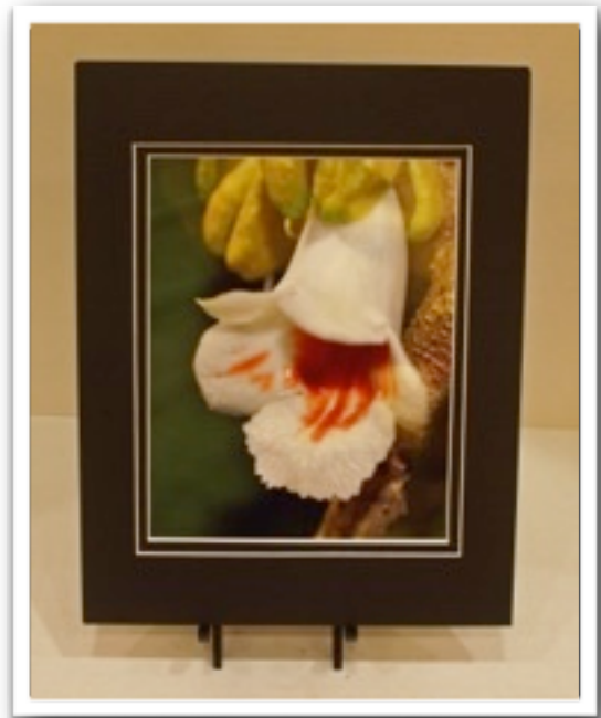
Drymonia macrantha (flower)