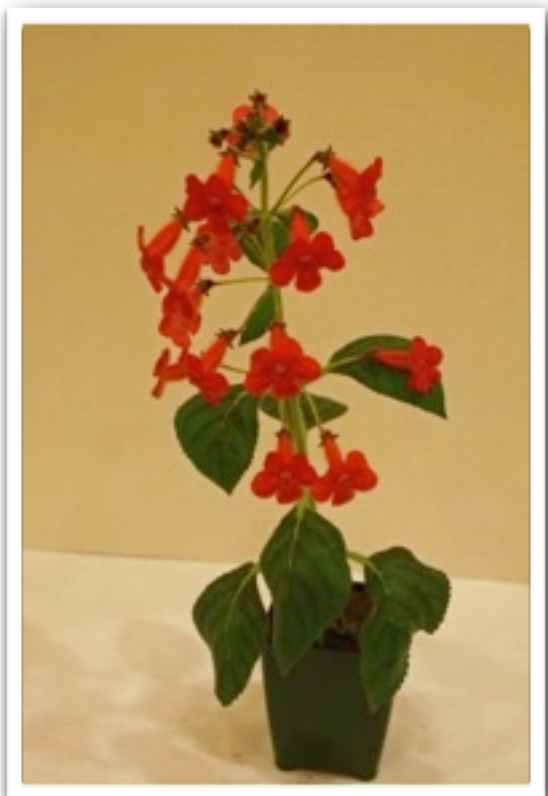
Kohleria 'Beethoven'