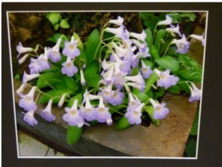
Primulina eburnea x Primulina medica