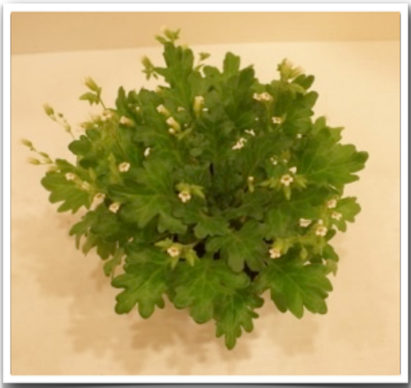
Primulina lobulata - Bill Price