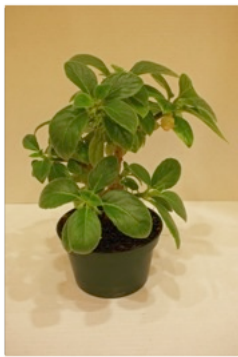
Alsobia chiapensis - Bill Price