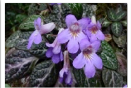
Primulina bullata , one of the newly discovered gesneriads that you might see on this trip growing in its natural habitat.