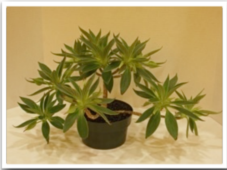
Primulina drakei - Bill Price

Convention videos can be accessed on YouTube .