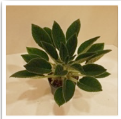
Petrocosmea kerrii