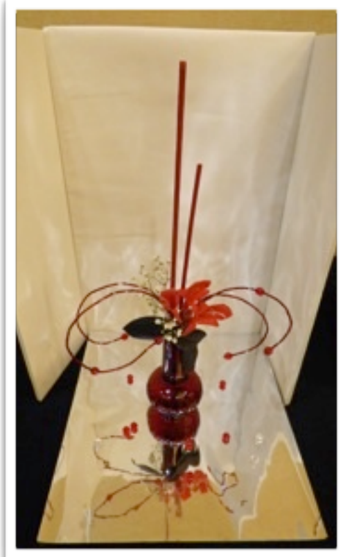
"Jack London Square" - Laura Buckner