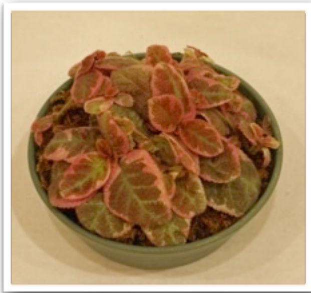
Episcia 'Pink Smoke'