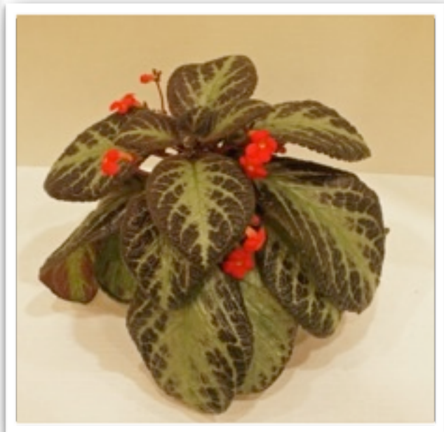
Episcia cupreata Arleen Dewell