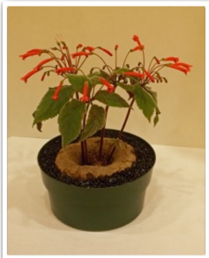
Sinningia leopoldii