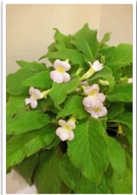
Henckelia ceratoscyphus - Bill Price