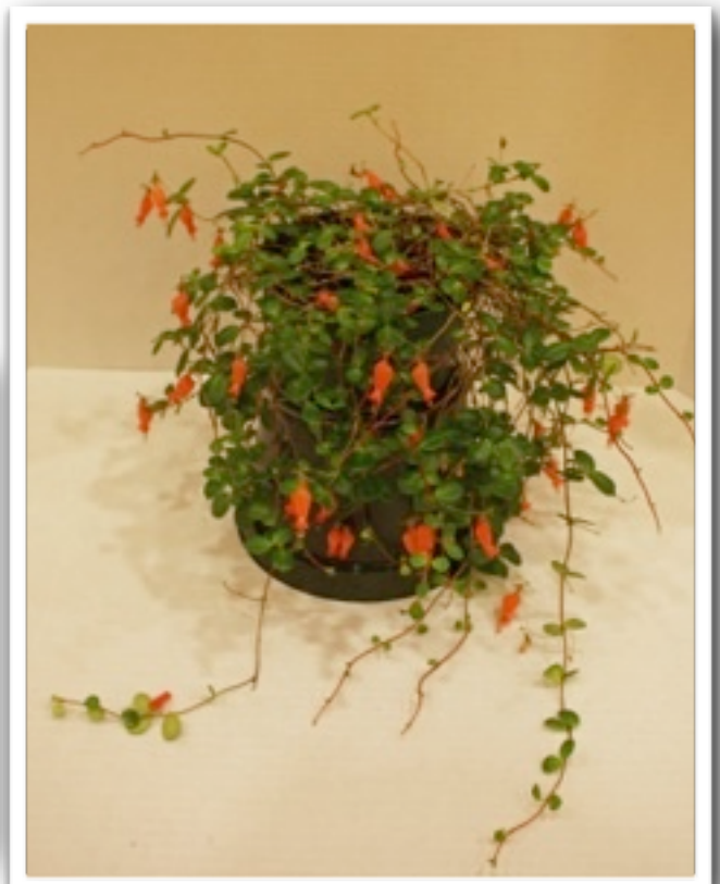
Sarmienta scandens - Bill Price