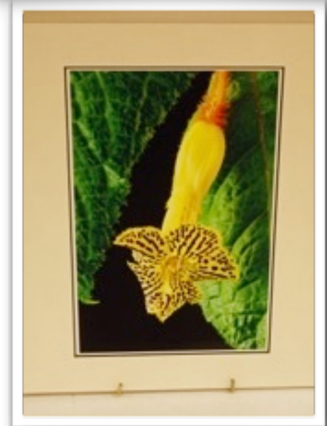
Solenophora tuxtlensis