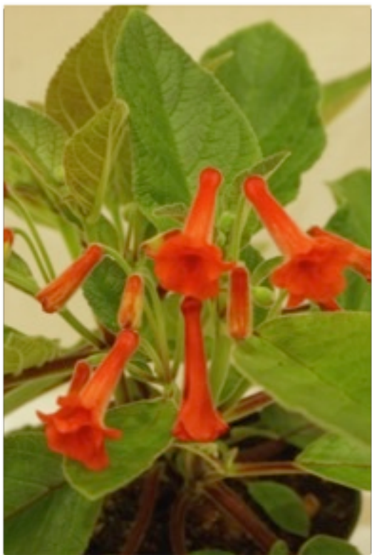
Sinningia 'Peridots Harvest Glow'