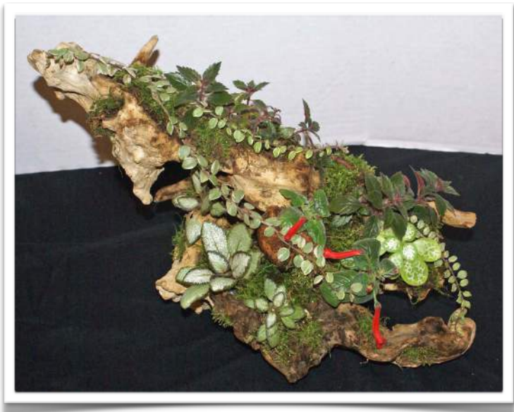
Natural Garden Jill Fischer