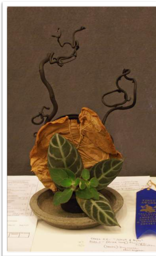
"Jekyll & Hyde" Paul Kroll

"A duo design is organized as two designs, back to back, in one container. Each side should be very different from the other side. Judged as one whole design."