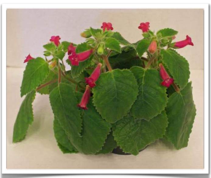
Sinningia 'Magic Moment' Arleen Dewell