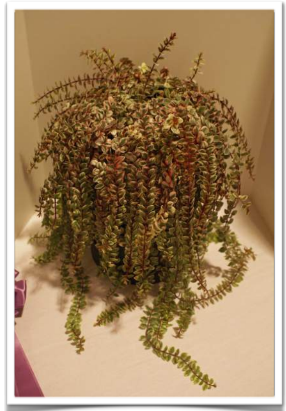
Columnnea 'Broget Stavanger' Brett Flewelling

It is hard to part with some plants at first, but you will find your collection to be much more manageable. As a result, you will be able to sit back and admire your plants instead of their care becoming another chore. Rediscover the joy that the hobby brings to us all, and keep it reasonable!