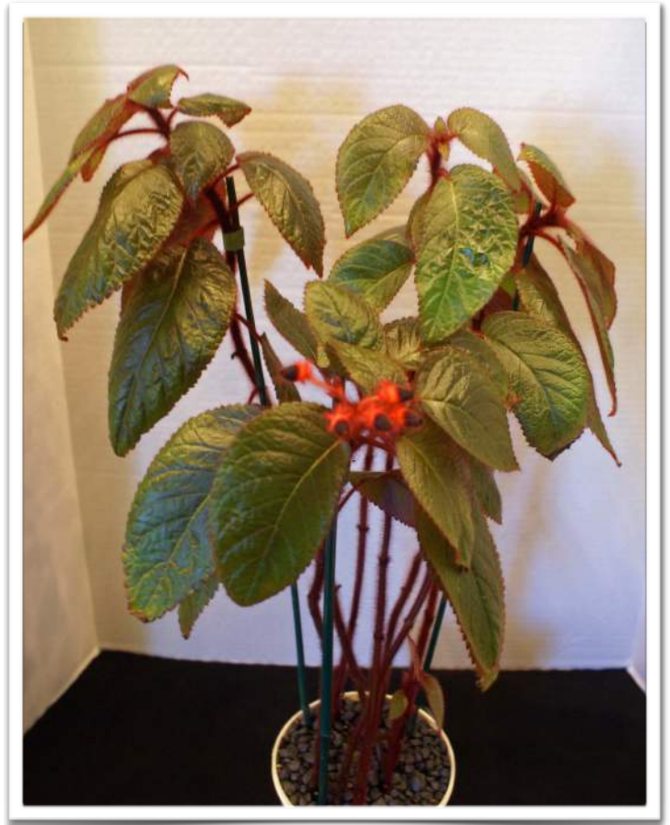
Pearcea rhodotricha