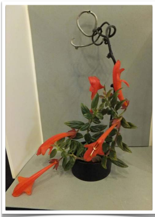
"Jersey Boys" Mel Grice