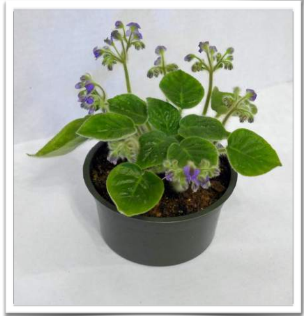
Petrocosmea parryorum