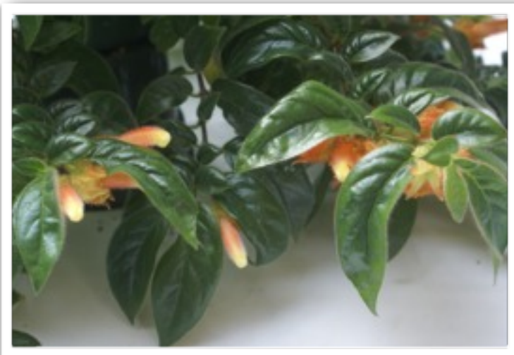
Columnea pulchra 'Orange Crush'