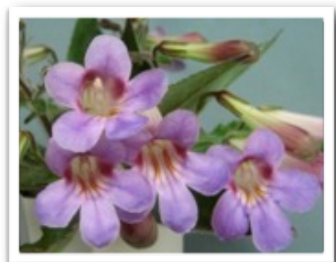
Chirita sp. 'V-27'

Toshijiro Okuto posted the photo on the right on Gesneriphiles Internet Discussion Group. Toshijiro said " Chirita sp. 'V-27' in full bloom. It really is a heavy bloomer."