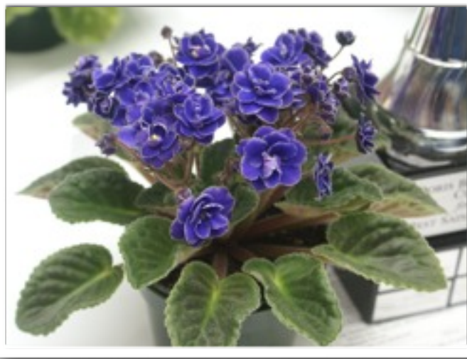
Saintpaulia 'Aca's Inquisitive George'