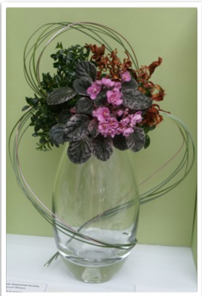
Artistic design — Judy Zinni used Nematanthus fluminensis leaves that had been dried and painted