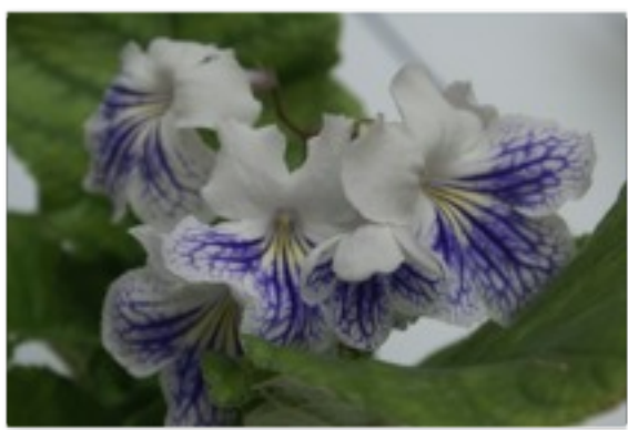
Streptocarpus 'Brooklin's Purple Lace' hybridized by Bruce Williams