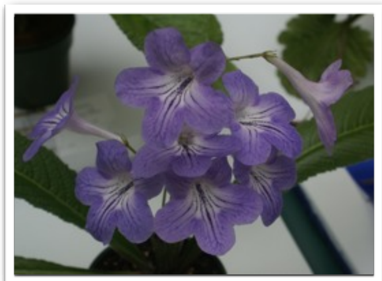
Streptocarpus 'Misty Blue'