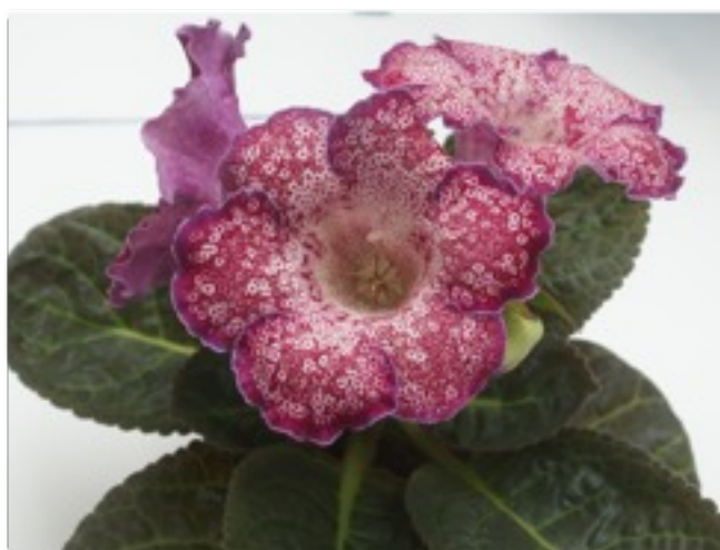
Sinningia 'Peridots Darth Vader'