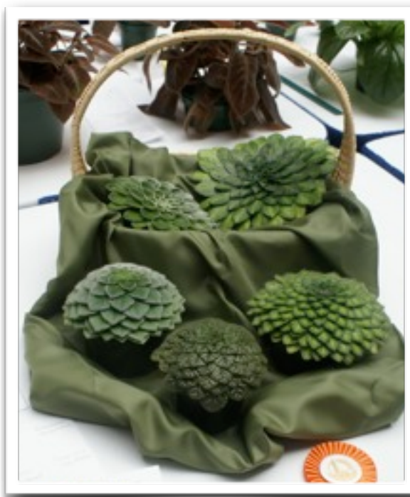
Petrocosmea collection shown by Brett Flewelling