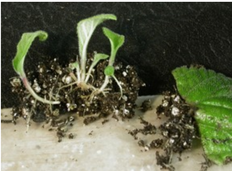
Plantlets with roots

Leaf propagation for Sinningias is not as successful because "blind" tubers are often formed that never sprout. Often rhizomatous plants will form plantlets from leaf sections if propagated in the spring or summer, but will form rhizomes if propagated in late fall or winter.