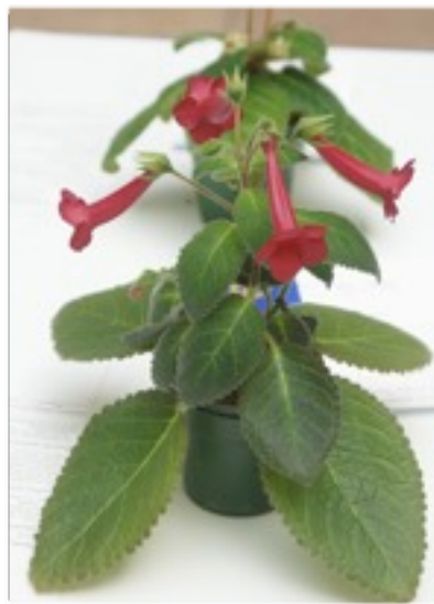
Sinningia 'Prudence Risley' shown at Toronto Gesneriad Society Show, 2010