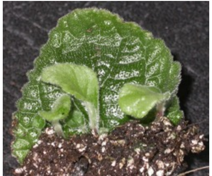
Streptocarpus leaf with emerging plantlets

Leaves can be cut into sections. As long as there are leaf veins in the sections, and you don't plant the sections upside down, you'll likely get plantlets. Don't propagate old leaves. To increase success, pour two cups of room-temperature water into a casserole dish. Using a sharp knife, cut the leaf into sections, under water, and leave them in the water ten minutes. If the leaf is wide enough, you may cut so the midrib is removed and the leaf halves are buried in the mix. Caution: remove an inch or so of the tip of the leaf before cutting out the midrib. The tip usually rots and there's a danger it will continue rotting across the leaf half. Some cut two-inch strips across the leaf left to right or some cut V-shaped wedges. Plant the sections one inch deep in the mix. You should have plantlets emerging in six weeks. Plantlets need to be around an inch tall before removing them from the leaf section. Gently pull the leaf section away from the plantlets which will have their own roots. Next separate the plantlets from each other. If there are plantlets that are very small, plant them as a clump and separate them later. Give fertilizer at the rate of 1/8 teaspoon per gallon of water for young plantlets.