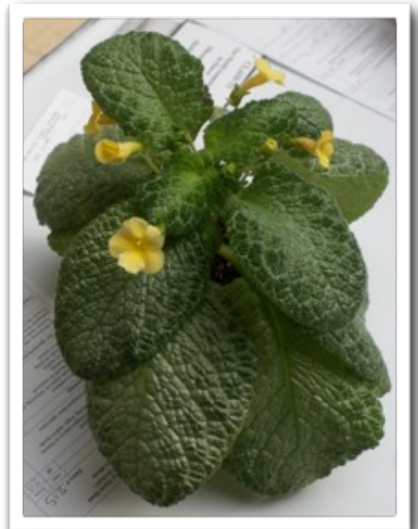
Episcia 'Jim's Silver Stone'