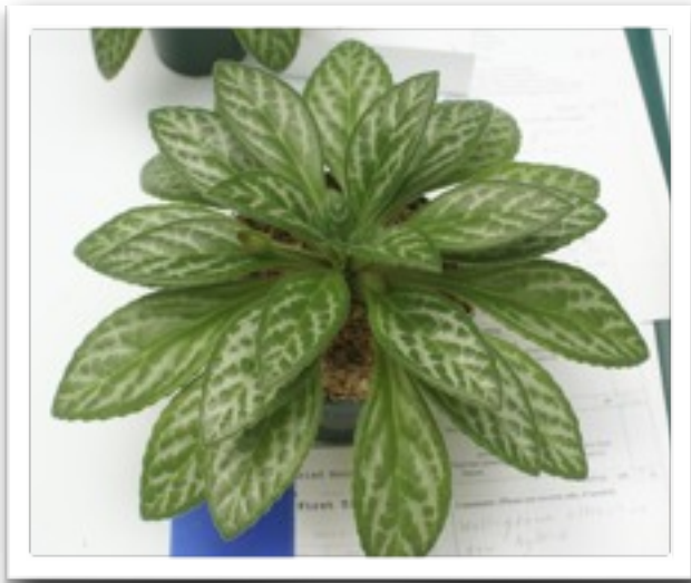
Chirita 'First Time' hybridized by Vincent Woo and Monte Water