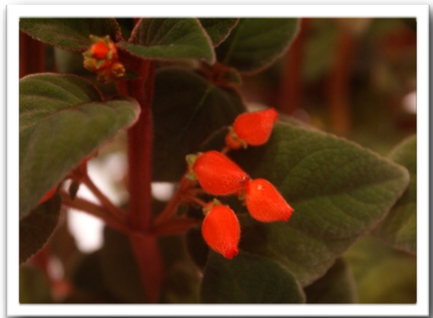
Pearcea schimpfii ABG 94-083 exhibited by Bill Price