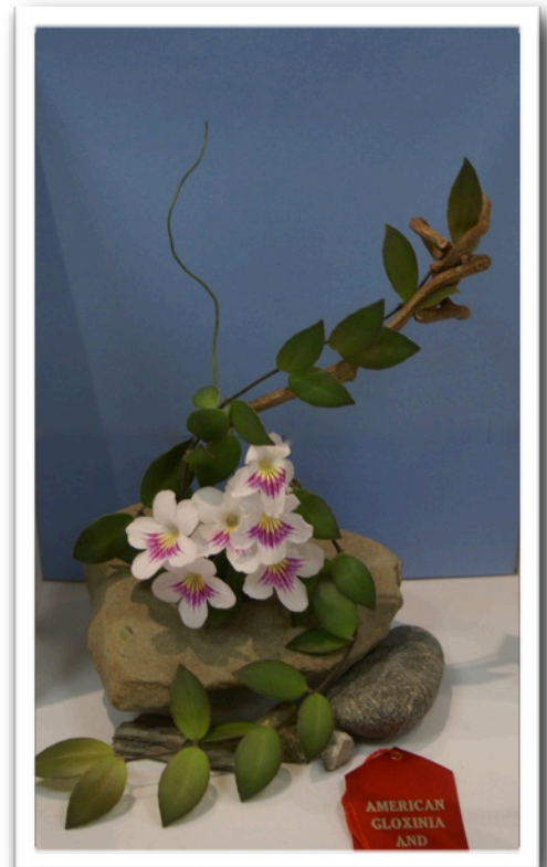
Artistic arrangement — “Quarry Garden” designed by Mel Grice