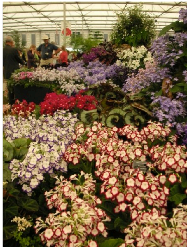
Streptocarpus 'Fleischle Roulette Azure' and Streptocarpus 'Fleischle Roulette Cherry'