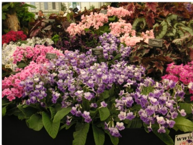
Streptocarpus 'Frosty Diamond'