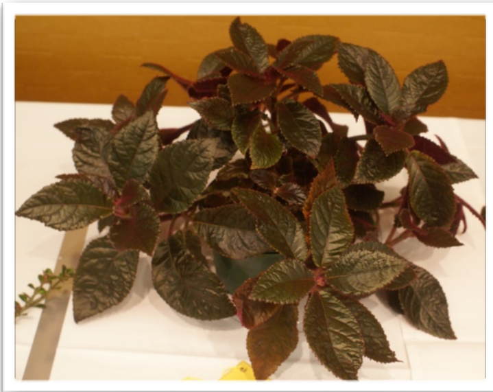
Nautilocalyx glandulifer exhibited by Arleen Dewell