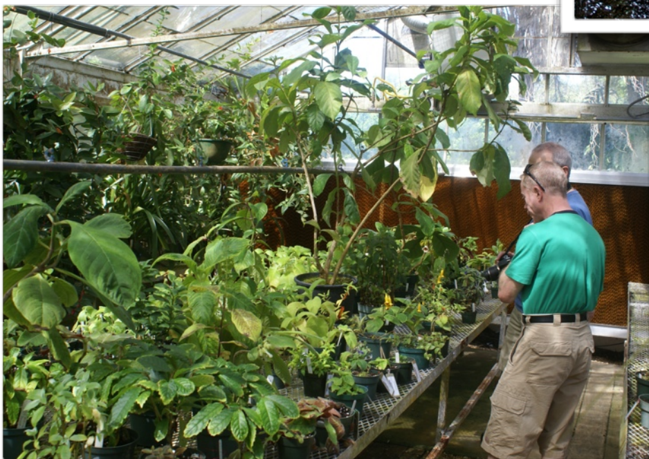
Raphiocarpus petelotii in the "back" greenhouse