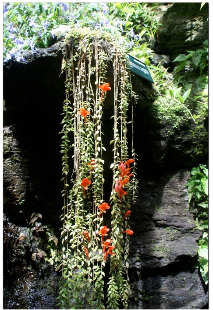
Columnnea arguta in display greenhouse