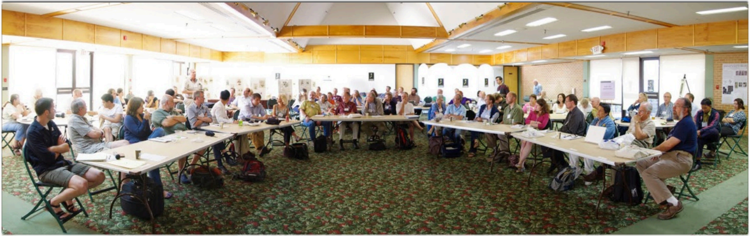
Conference room