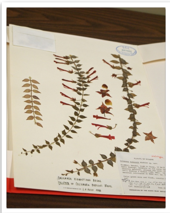
Example from Selby Gardens herbarium collection of dried, pressed specimens. Note how the flowers maintain their color.