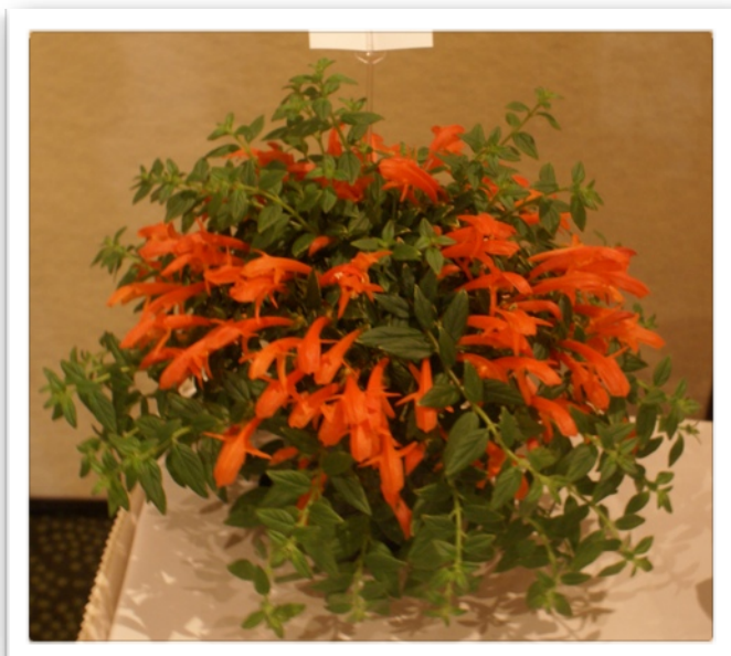
Columnea 'Orange Sherbert'