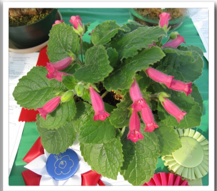
Sinningia 'Magic Moment'