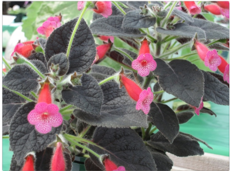
Kohleria 'Pink Shadows'