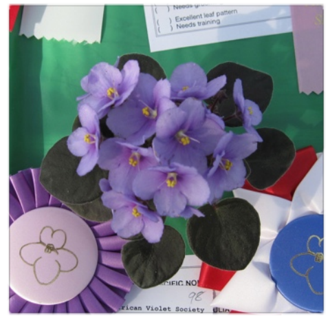
Saintpaulia 'Ness' Bashful Blue'