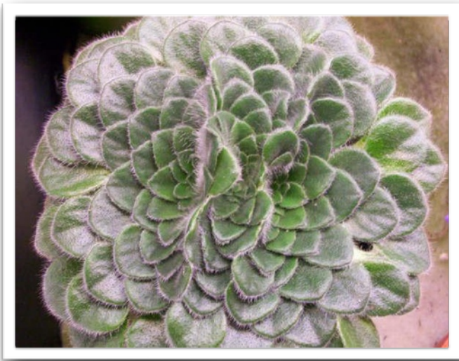
Petrocosmea forrestii with a zippered crown

healthy plant, usually with a few years of age, suddenly starts to produce a center growth point within the crown of the rosette that begins elongate into a linear growth point. The normally circular rosette can often become more oval in shape, and if grown on, the plant often splits into two or three crowns. Eventually these will totally split or separate producing two or three new crowns. I see this occur often in P. forrestii , and its hybrids, as well as the various forms of P. rosettifolia and their hybrids. I have seen it occur once in P. minor also. In all cases the plants were three years old or more when this happened. See the photo below of P. forrestii at five years of age, with a zippered crown, which eventually became three separate crowns. The plant flowered very heavily during this period. It appears to me to be more a factor of age than a cultural flaw.