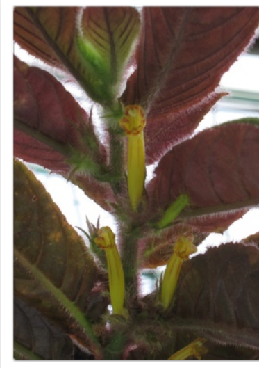
Columnea 'Indian Feather'