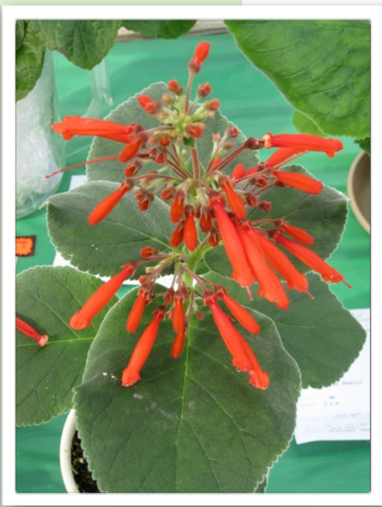
Sinningia leucotricha x bulbosa

See more photos from the Puget Sound Gesneriad Society Show on the next page.