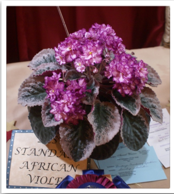
Saintpaulia 'Buckeye Cranberry Sparkler'