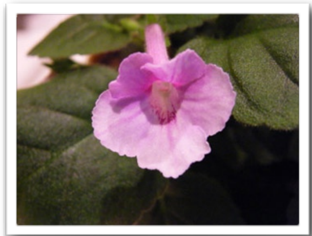
Sinningia 'Venetian Moon'