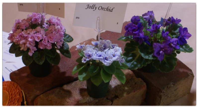
Saintpaulia 'Orchard's Bumble Magnet', Saintpaulia 'Jolly Orchid', Saintpaulia 'Skagit Lil Gem'