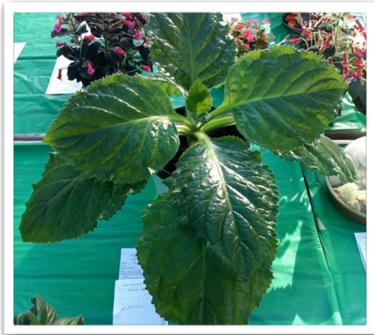
Chirita sp. "New York"