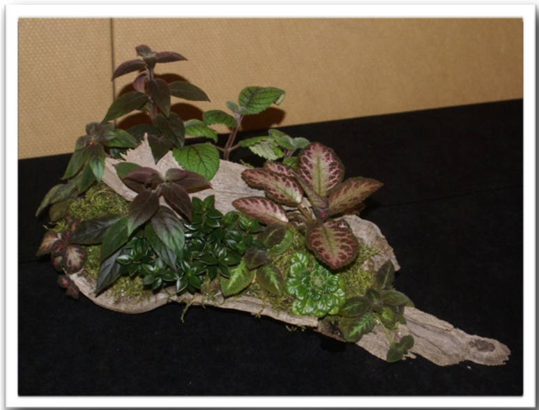
Natural Garden created by Tim Tuttle