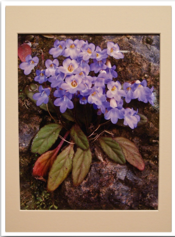
Photograph of Chirita ronganensis taken in China by Stephen Maciejewski