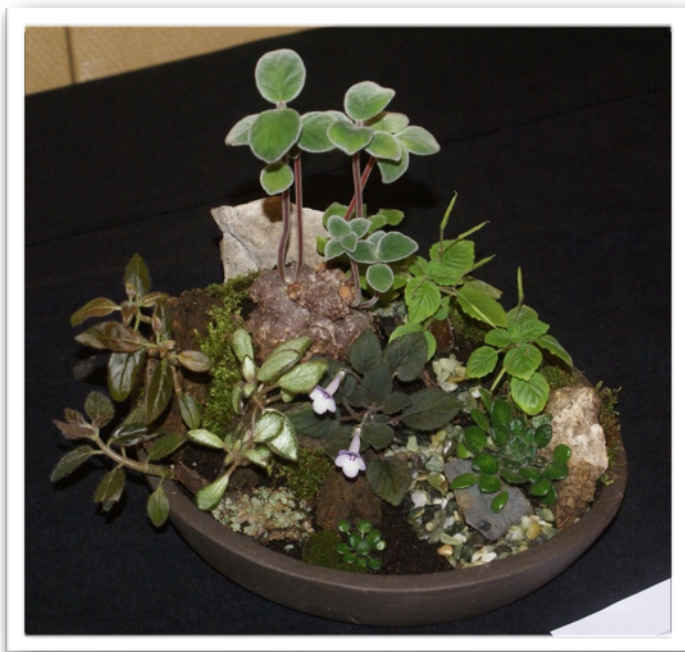
Tray landscape created by Karyn Cichocki