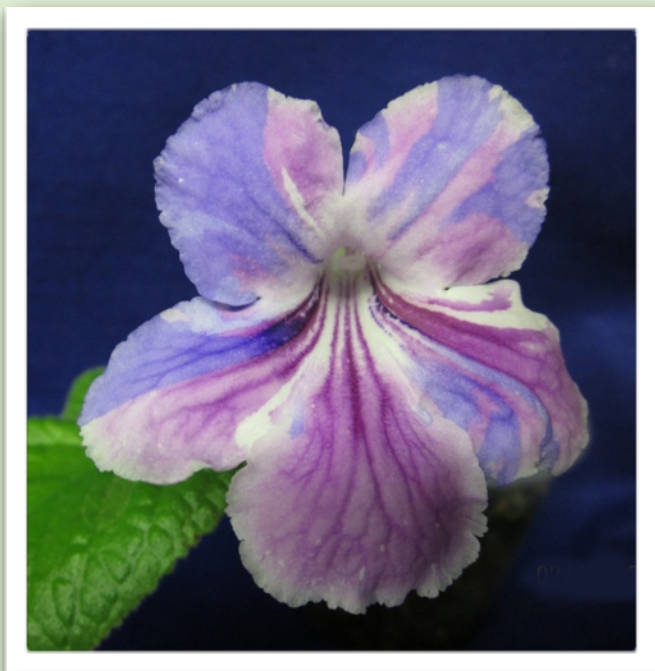
Streptocarpus 'Liberty Belle'