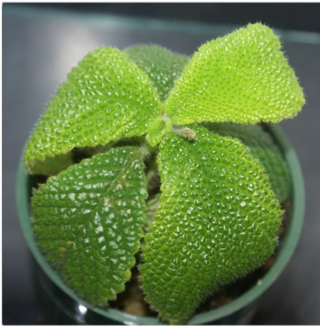
Reldia species exhibited by Karyn Cichocki. Plant started from a leaf collected in Ecuador in 2007. It requires low light and humid conditions much like Gasteranthus .