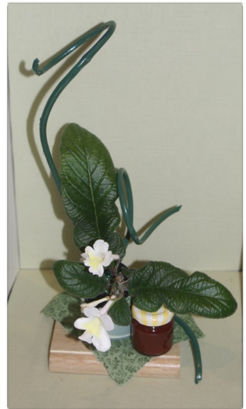
"Reading Terminal Market" created by Barbara Festenstein