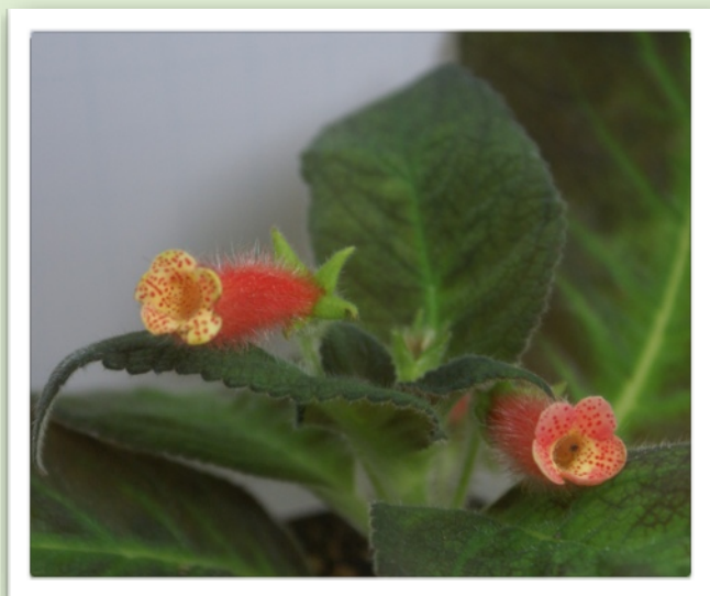
Kohleria 'Bristol's Possibly Bronze'