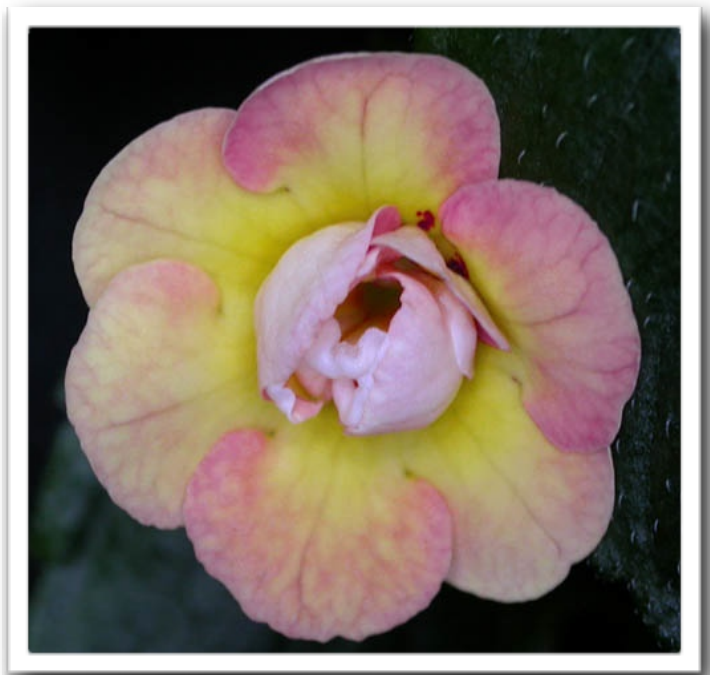
Achimenes 'Serge Saliba'