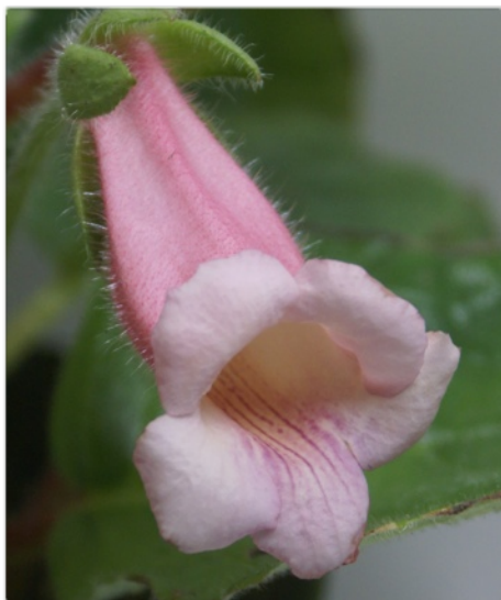
Sinningia 'Georgia Peach'