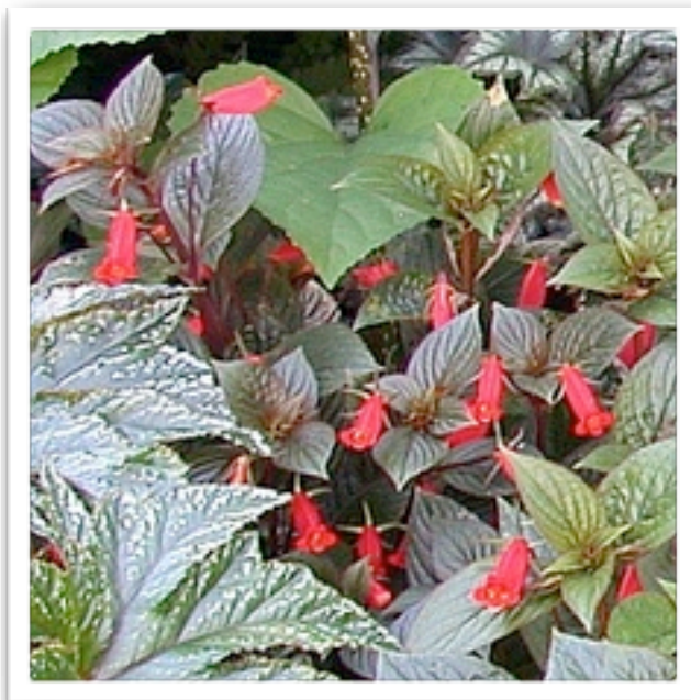
Seemannia 'Little Red'

Seemannia 'Big Red' and Seemannia 'Little Red' are sibling seedlings from the cross ( S. nematanthodes x S. purpurascens ) x S. nematanthodes 'Evita'. The S. purpurascens parent was not the same as the one that produced S. purpurascens 'Purple Prince' but was a dark-leaved seedling that popped up among green-leaved seedlings in a sowing from wild-collected seed of the species. The F1 hybrid was nothing exceptional so I backcrossed it to S. nematanthodes in an attempt to get a dark-leaved version of that species, with some success. S. 'Big Red' has large olive-green leaves and large scarlet-red flowers much like those of S. nematanthodes 'Evita'. Seemannia 'Little Red', as the name suggests, has smaller flowers. The foliage is also smaller but darker and contrasts nicely with the intense red flowers. Big Red is