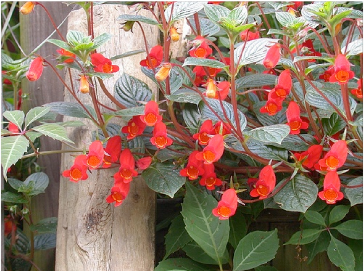
Seemannia nematanthodes 'Evita'

dappled shade but will stay more compact and bloom better if they get direct sun for part of the day, preferably in the morning. S. nematanthodes and its hybrids, in