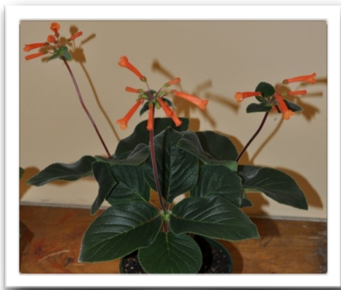
Sinningia insularis