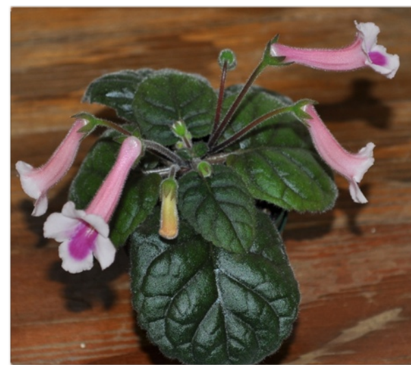
Sinningia 'Powder Puff' — Esperanza Kesler