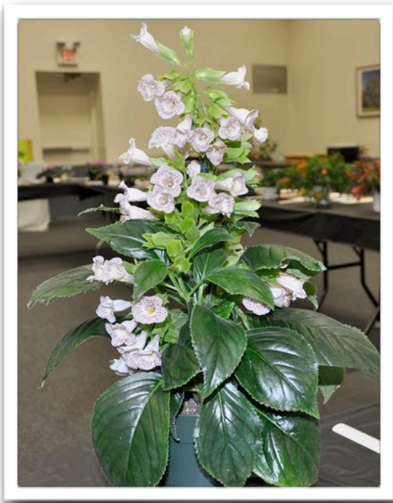
Sinningia guttata