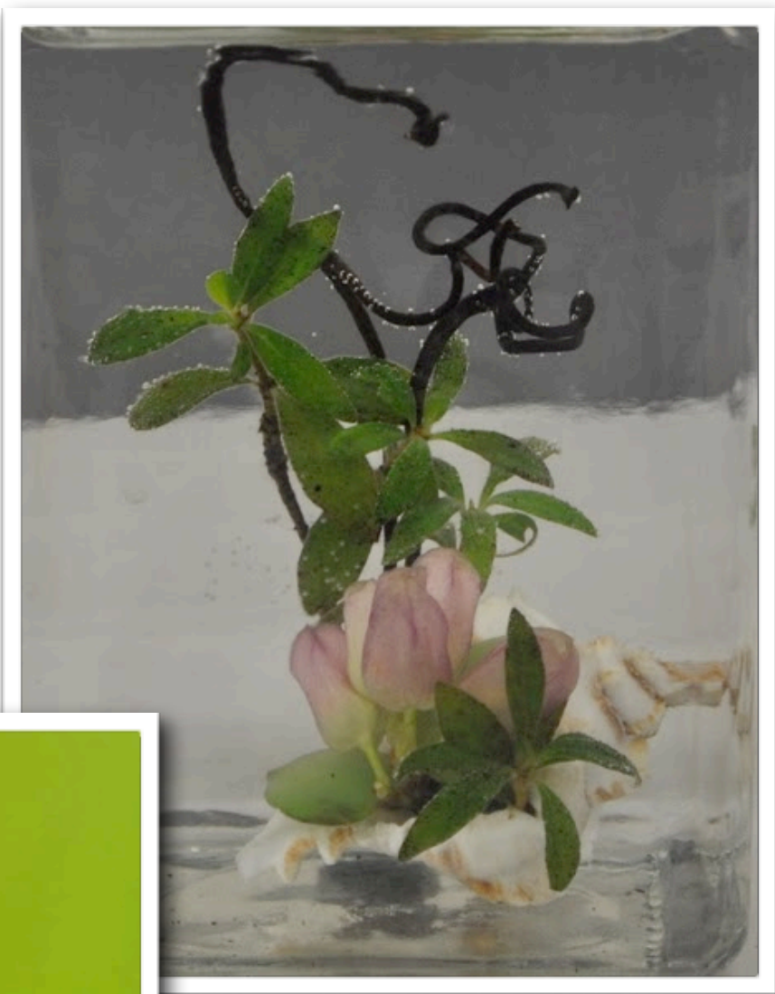
Design - Saltwater Taffy — Ben Paternoster