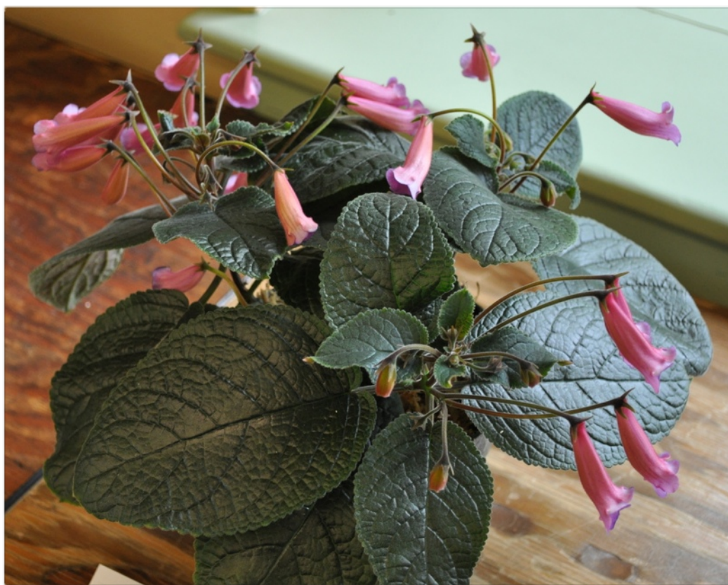
Sinningia bullata