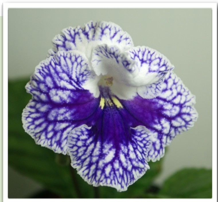
Streptocarpus 'Victorian Lace'