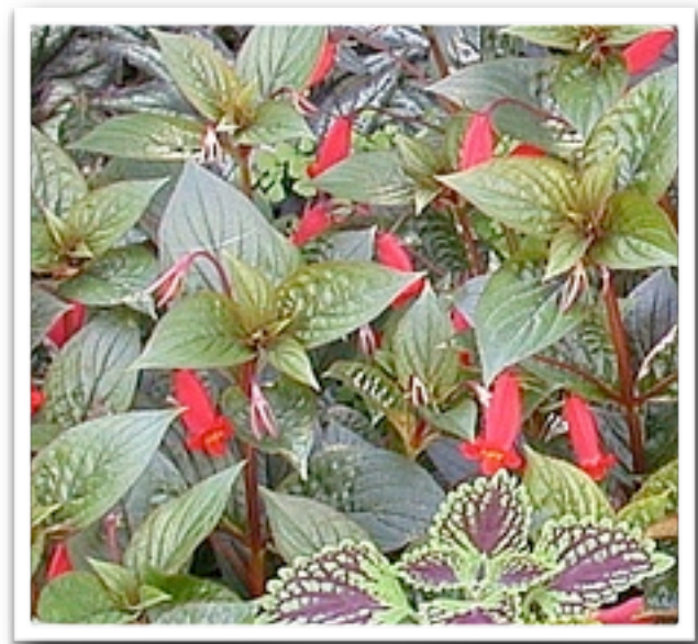
Seemannia 'Big Red'

Seemannia purpurascens 'Purple Prince' was my first Seemannia hybrid, resulting from a cross between two different wild collections of the species. S. 'Purple Prince' is a tall, dark-leaved hybrid with pink flowers with a contrasting green limb. Although pinching helps keep it compact, it ultimately gets too tall for growing indoors but performs very well outdoors in containers or in the ground where it has plenty of head room. Inspired by my success with this plant, and intrigued by the reputed hardiness of S. nematanthodes , I have made crosses between these two species in hopes of producing hybrids with attractive foliage that are also hardy. In this I have been at least half successful and have recently released three new cultivars from these crosses that combine dark foliage with bright red flowers.