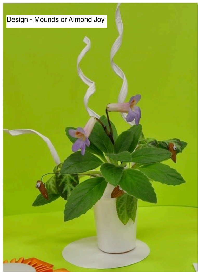
Design - Mounds or Almond Joy