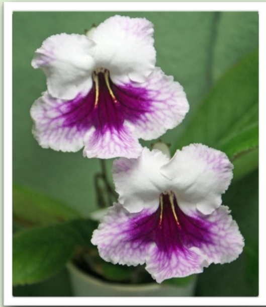
Streptocarpus Fernwood's Cherries Jubilee'