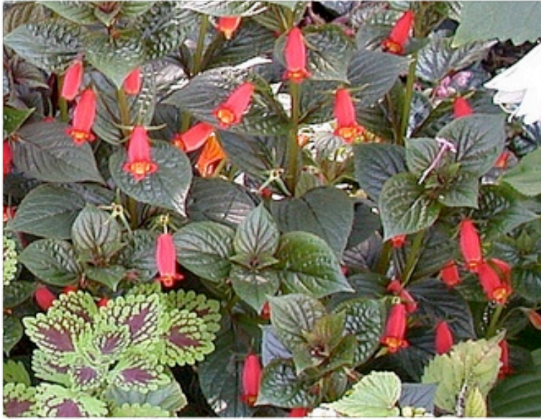
Seemannia 'Red Prince'

'Purple Prince' and S. nematanthodes 'Evita' are superior versions of the species. The new F1 hybrid likewise had much better form and foliage than the previous F1 hybrid that I had used to produce S. 'Big Red' and S. 'Little Red'. S. 'Red Prince' has very dark, glossy foliage and deep red flowers. It's very similar to the other two hybrids but I have used it in further breeding and decided it was nice enough in its own right to name.