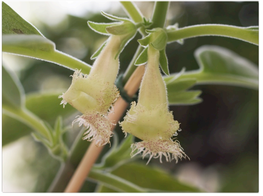
Streptocarpus ( polyanthus ssp. polyanthus x prolixus ) exhibited by Al Pickrel