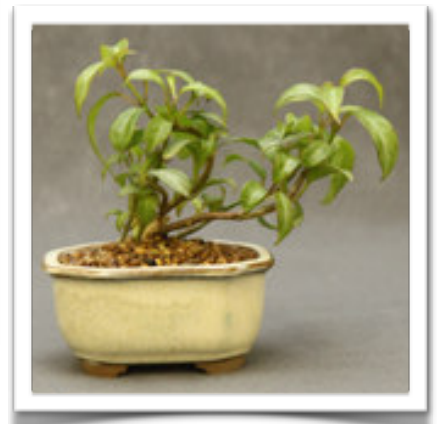
Drymonia cuyabensis