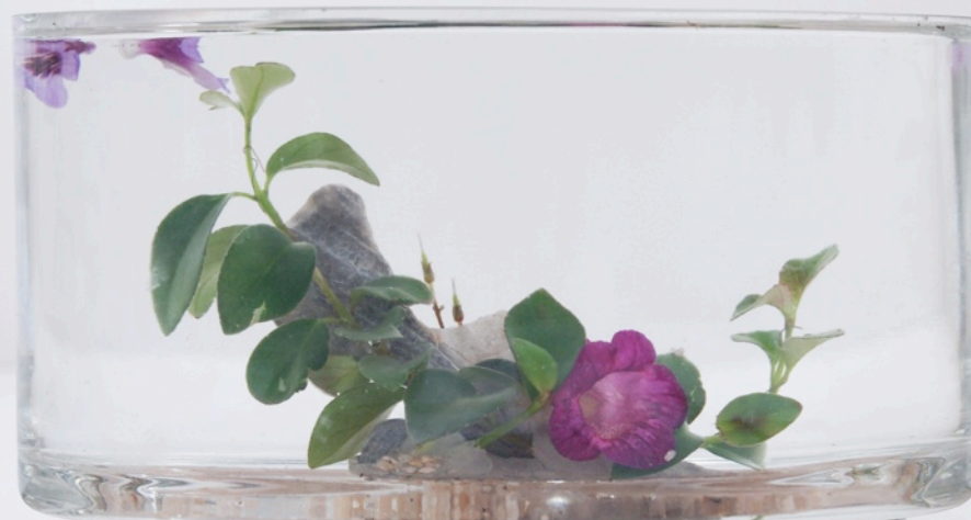
Underwater arrangement — "South Pacific", exhibited by Barbara Stewart

This is a hybrid between two South African Streptocarpus species, S. polyanthus ssp. polyanthus and S. prolixus . It was grown from seed obtained from the Gesneriad Hybridizers Association (JT 04-1101). Seed was sown on July 12, 2005. According to The Gesneriad Reference Web ( http://gesneriads.ca ), S. prolixus is generally unifoliate, and grows well on rock faces with high moisture levels. Streptocarpus polyanthus grows on moist well-drained locations such as rocky outcrops, slopes, and soil banks, at relatively low altitudes, and forms clusters of monocarpic leaves. This hybrid forms a mass of blooms about once a year, and seems to require cool nights to bloom well. During periods of drought, the leaf tips will die back but will continue to grow from the base, a growth habit inherited from its parents.