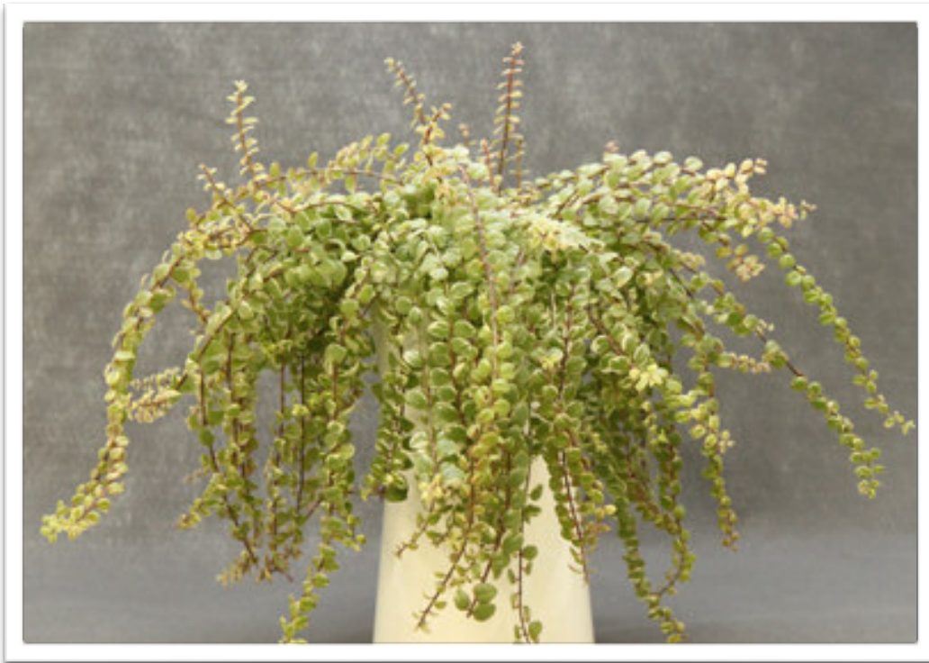
Best in Show – Columnea 'Broget Stavanger' – Jill Fischer