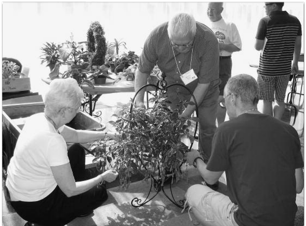
Untwisting the long pedicels of Nematanthus corticola during Entries