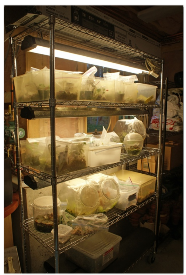
Plastic bags and containers are used for propagating and germinating seeds.