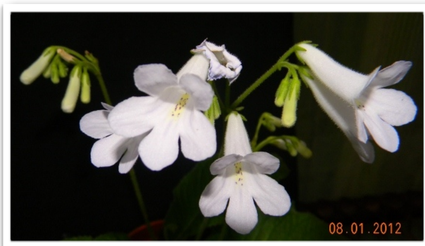
Streptocarpus fenestra-dei x Streptocarpus wilmsii

Two other young, unflowered specimens were also spotted, but identity not confirmed. This is the first reporting of a natural hybrid involving these two species. Hilliard and Burtt reported the natural hybrid between S. wilmsii and Streptocarpus cyaneus ssp. cyaneus in Swaziland, and when the photos above are compared to the line drawings in their famous book, look remarkably similar.