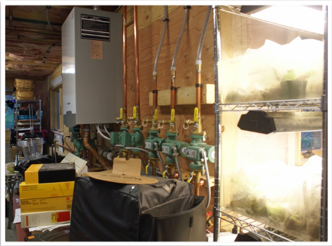
The greenhouse is heated by a high-efficiency gas furnace that runs four zones of forced hot water heat — two for the greenhouse and two for the house.