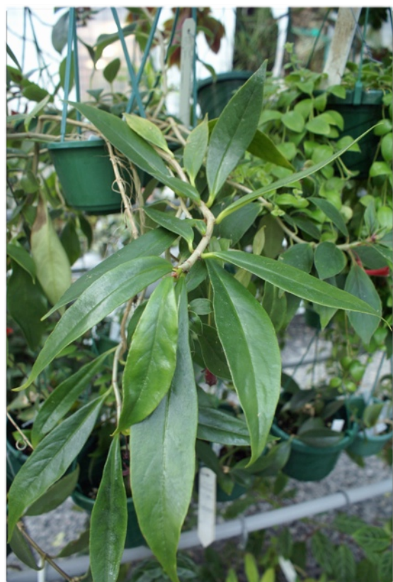
Nematanthus crassifolius 'Carangola'