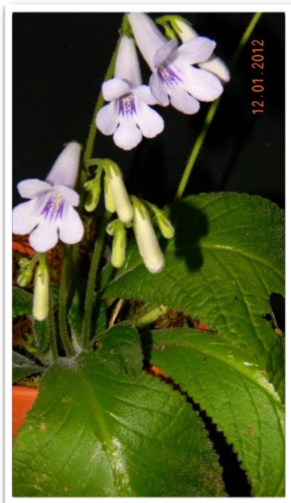
Streptocarpus fenestra-dei x Streptocarpus wilmsii

Streptocarpus wilmsii occurs in the same localities as a number of Mpumalanga rosulates, including S. cyaneus ssp. polackii , S. cyaneus ssp. nigridens , and S. cyaneus ssp. longi-tommii , so other natural hybrids are sure to be reported in the future.