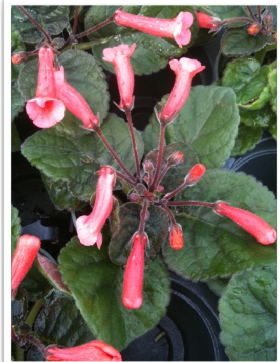
Sinningia 'Colorado Sunset' Gary Hunter