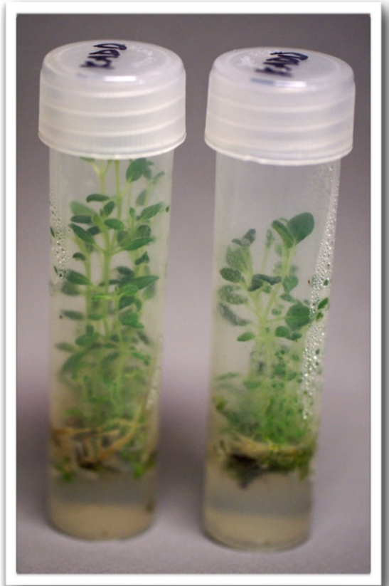
Hybrids grown by tissue culture

Remember — not all gesneriad hybrids are created equal!