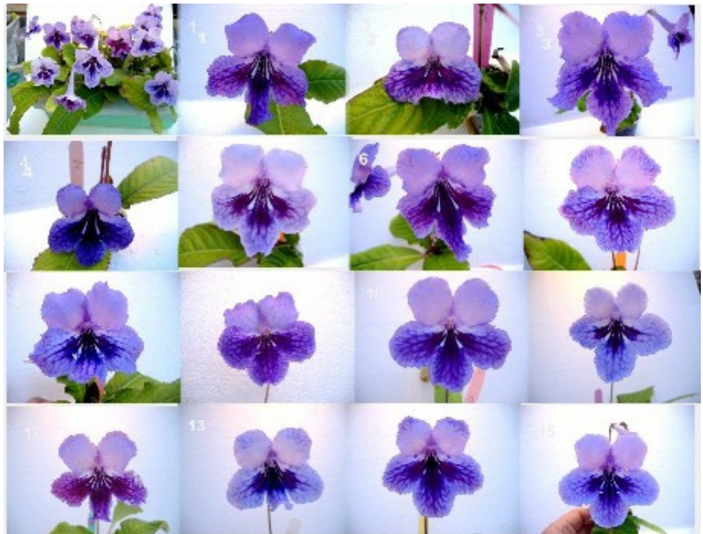
Streptocarpus seedlings resulting from the "selfing" of a hybrid streptocarpus.

The ONLY way a hybrid gesneriad plant can be propagated and still produce the exact same plant is by vegetative propagation. Putting down a leaf or rooting a crown cutting will result in a plant that has the exact same genetic material because you began with a piece of original plant tissue. Steven McCulloch did a presentation at The Gesneriad Society convention this July about growing gesneriads via tissue