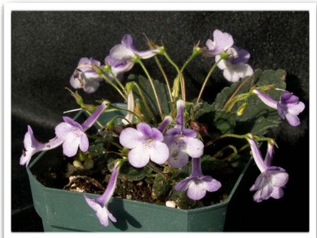
Sinningia 'Li'l Georgie'