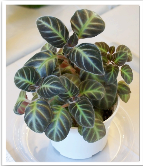
Gloxinella lindeniana