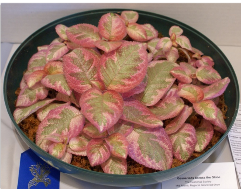
Episcia 'Pink Dreams'