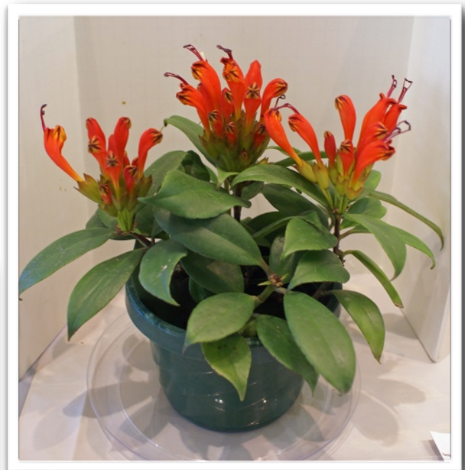
Aeschynanthus evrardii