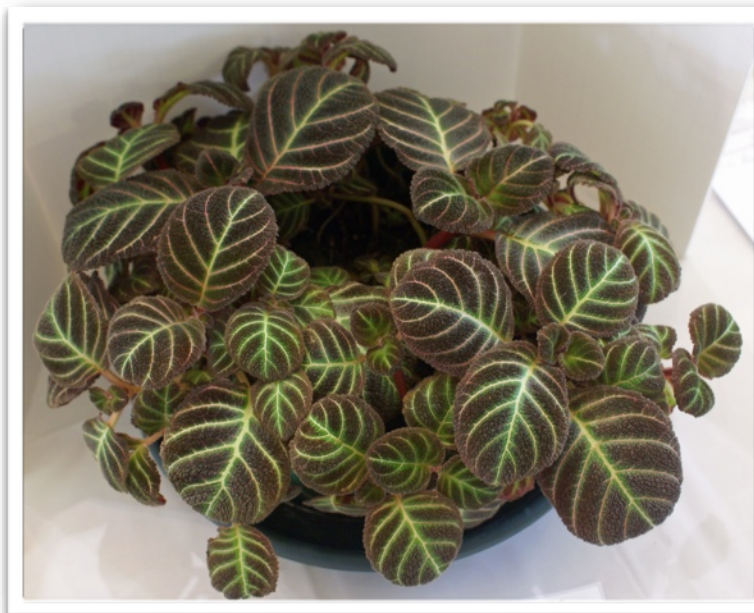
Pearcea hypocyrtiflora