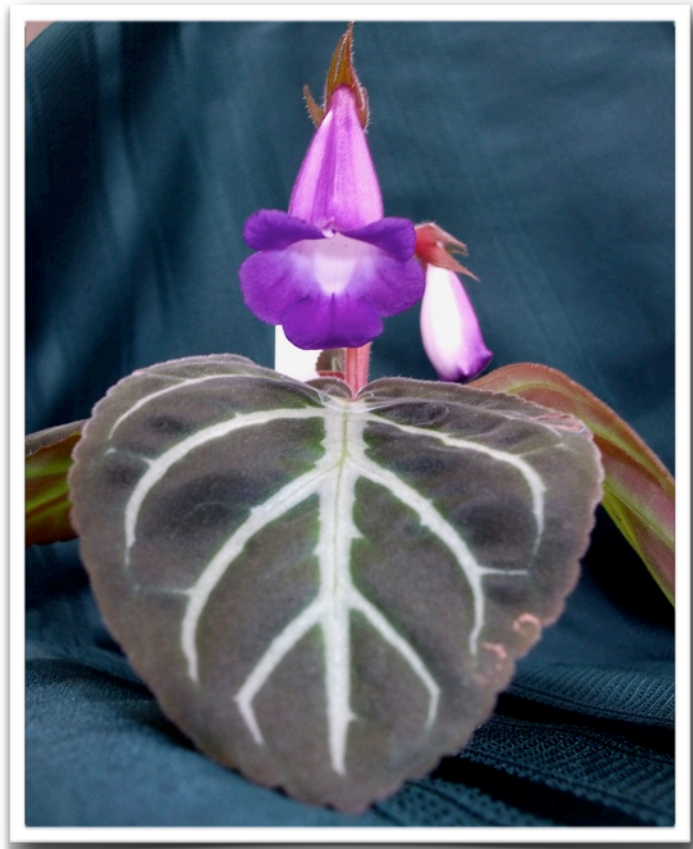
Sinningia speciosa 'Regina Serra da Vista'

My love for all plants with fancy leaves springs from the fact that they can be attractive even when not in bloom.