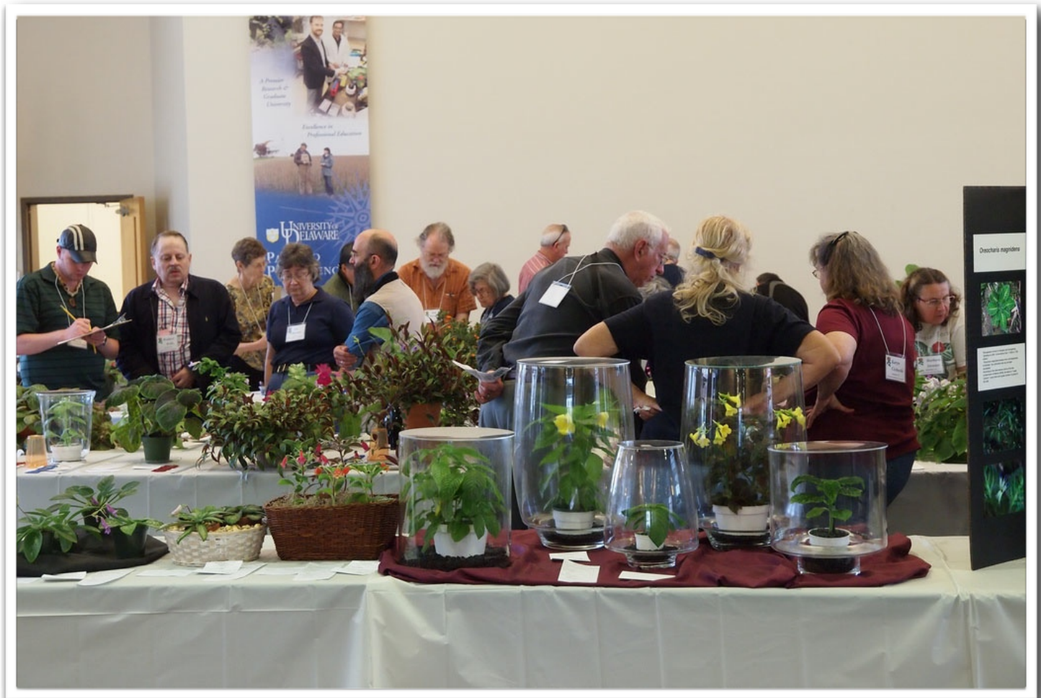
Judging the show