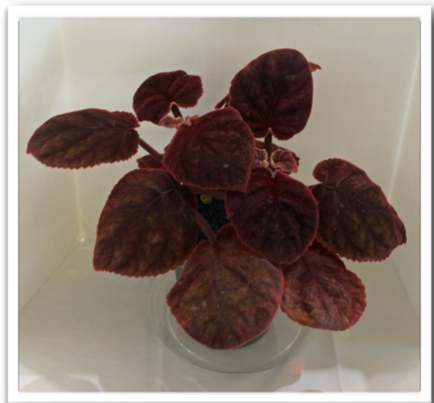
Smithiantha cinnabarina