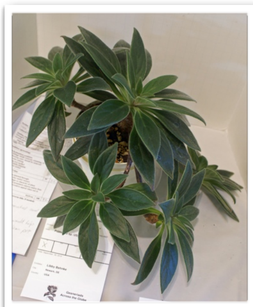
Primulina sp. USBRG 98-083 Libby Behnke

The plant sale will feature African violets and Gesneriads. The Tampa Bay Gesneriad Society will host seminars for the public on different aspects of Gesneriads beginning at 2:00 p.m. on Saturday.