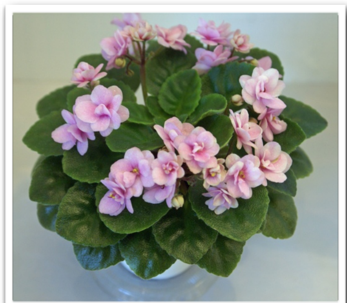
Saintpaulia 'Orchard's Bumble Magnet' Bobbie La Fashia October 2012