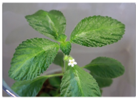
Left — Cremosperma sp.

The Mid Atlantic Regional Gesneriad Show, Sale and Symposium, a collaborative event of the Delaware, Liberty Bell and National Capital Area Chapters of The Gesneriad Society, was held in Townsend Hall at the University of Delaware Botanic Gardens.