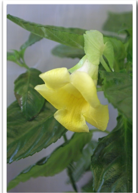
Gasteranthus tenellus