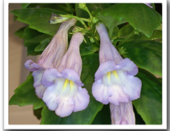
Lysionotus pauciflorus 'Ikeda'