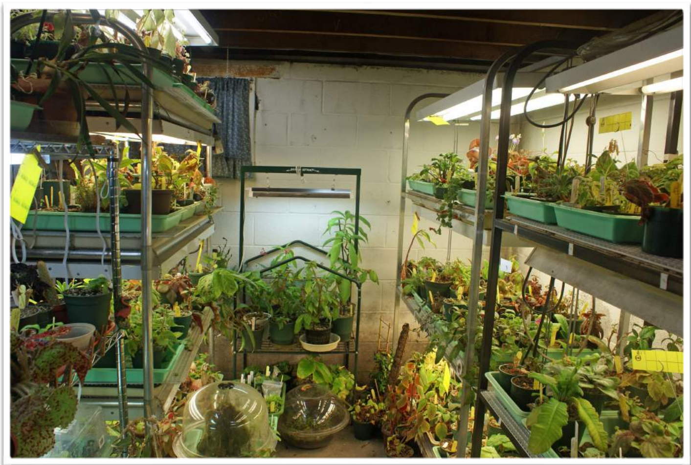
Karyn grows mostly in her basement. Notice the leaves she is propagating in plastic bags pinned to the light stands.