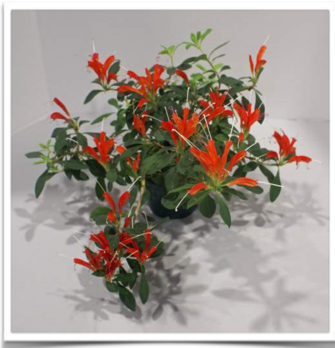
Aeschynanthus humilis