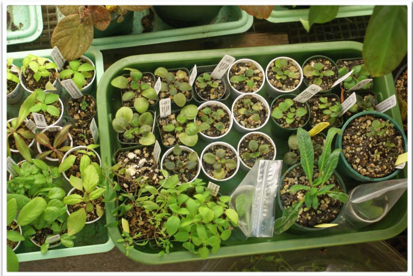
Karyn loves to propagate gesneriads from seeds.