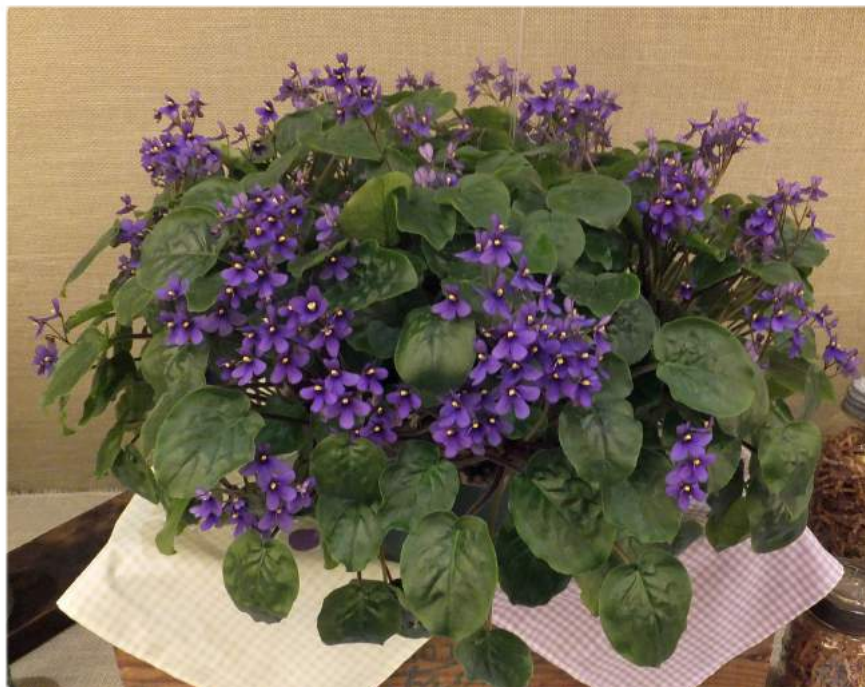
Saintpaulia 5f clone orbicularis var. purpurea - Sandy Skalski Best in Show Nashville 2014