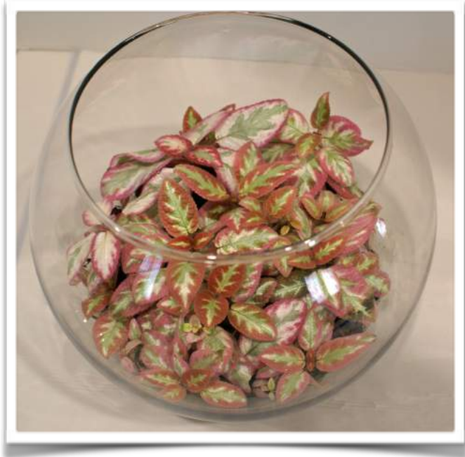
Episcia 'Moonlight Valley' Penny Wichman