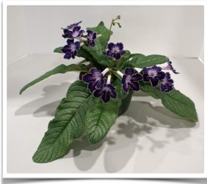
Streptocarpus 'Web of Intrigue' - Terri Vicenzi