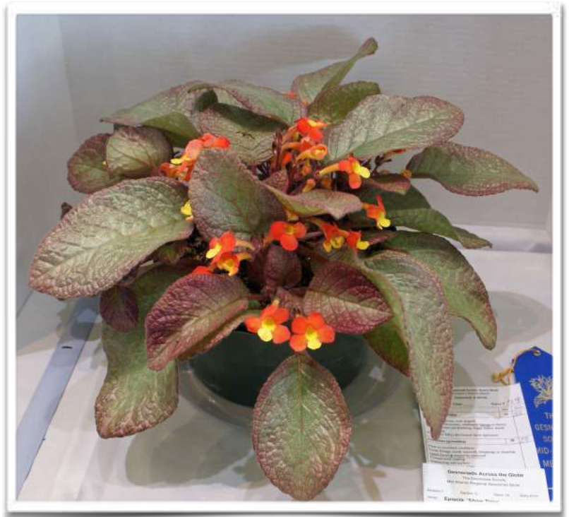
Episcia 'Showtime'

I grow my episcias on the top shelf of my stands. This is the warmest location, benefiting from the heat rising from the ballast below and the lights above them. They receive temps of about 76-78°F, with three lights running and down to 65°F, at the lowest, with the bulbs off. I run my lights at night, keeping cost down by having cooler temps during summer's daytime heat and warmer temps during winter's frosty nights. This also helps win the battle with powdery mildew, during mildew seasons.