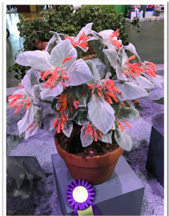
Sinningia leucotricha