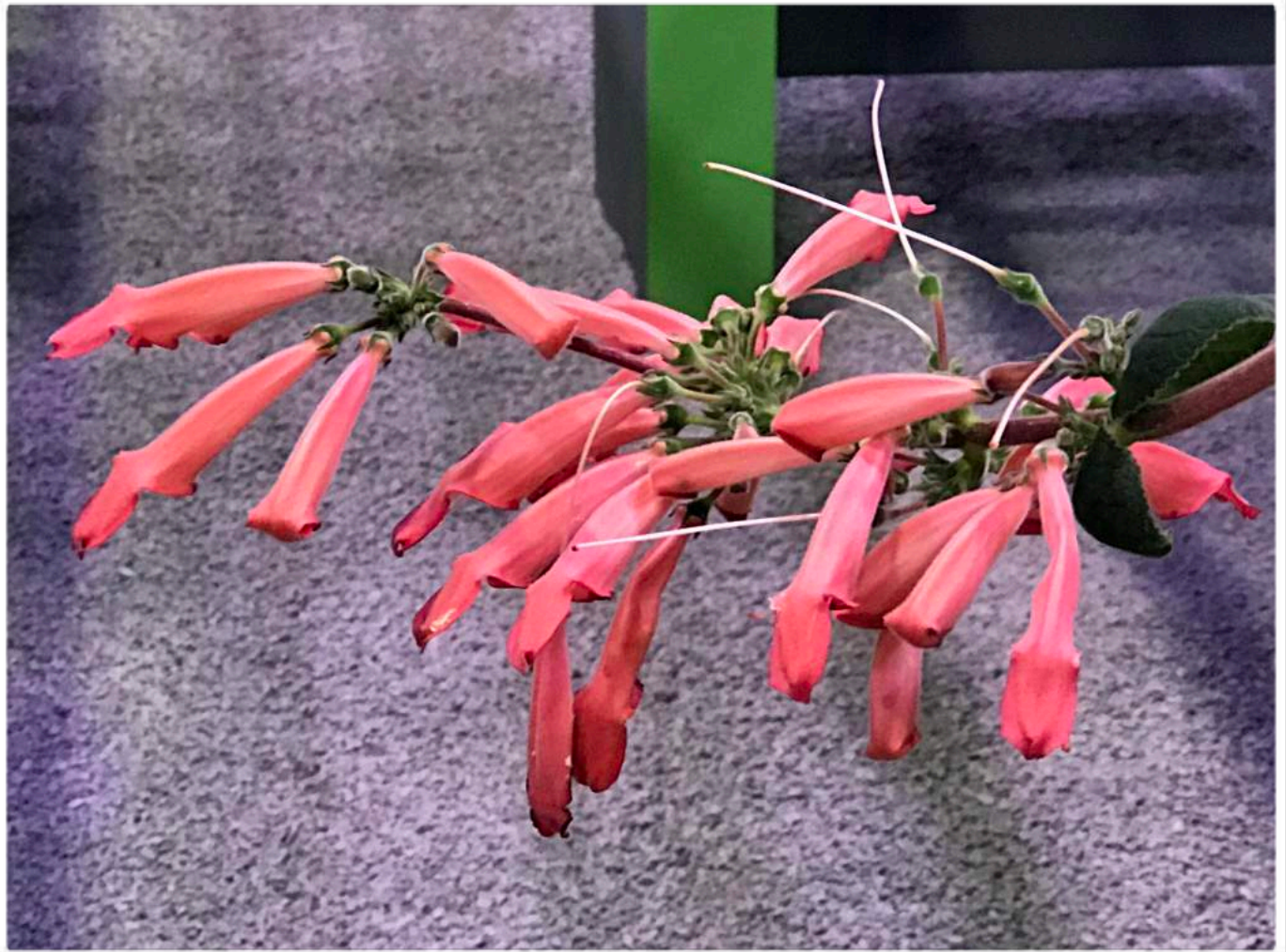
Sinningia bulbosa