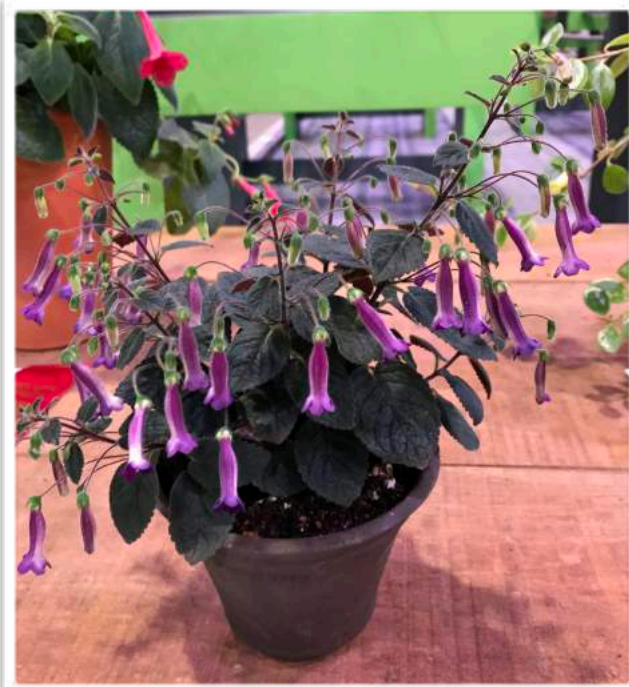
Sinningia 'Deep Purple Dreaming' Ken Selody