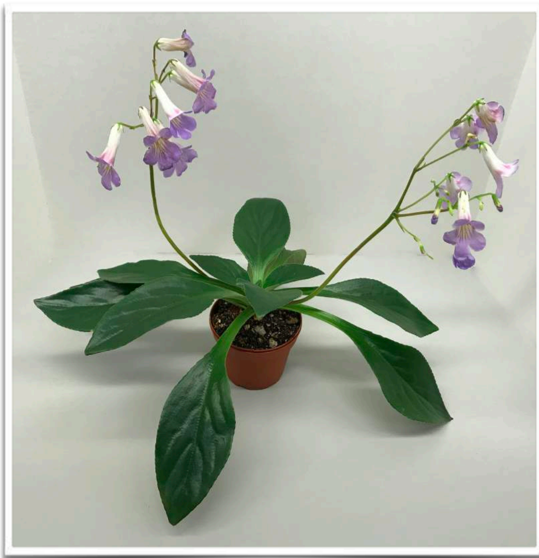
Primulina guilinensis