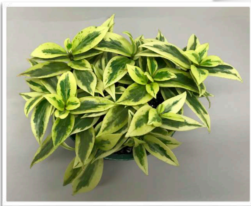
Aeschynanthus sp. "Thailand" Bill Price