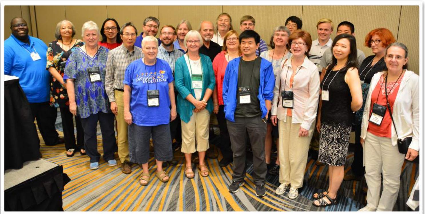
First time convention attendees

remained on the table when there was an open call for anyone to return a fourth time to scoop up the leftovers. Gesneriad people are the only group of people who get such joy out of sharing with each other and hold fast to the notion that the best gift one can share with another is not just plant material, but themselves. Even the best of people who have the best of intentions can be very jarring to us at times. But in the end, it is swimming in the waters of friendship, tolerance, and generosity that makes the most vivid memories live in our minds long after the event is over. That my friends, is the people part!