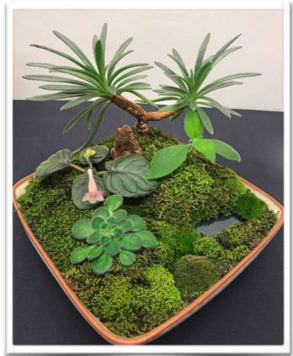
Tray Landscape Linda Hall