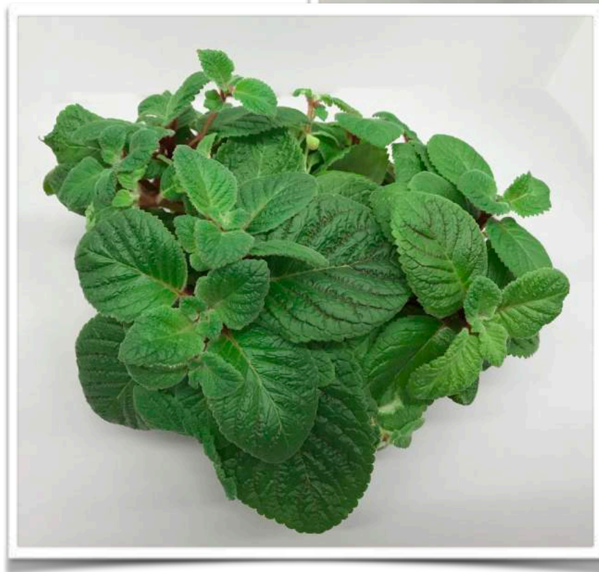
Eucodonia (Leong Tuck-Lock hybrid #3) Paul Kroll