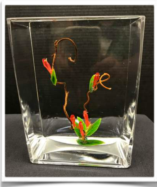
"Wild Tempest" underwater design Paul Kroll