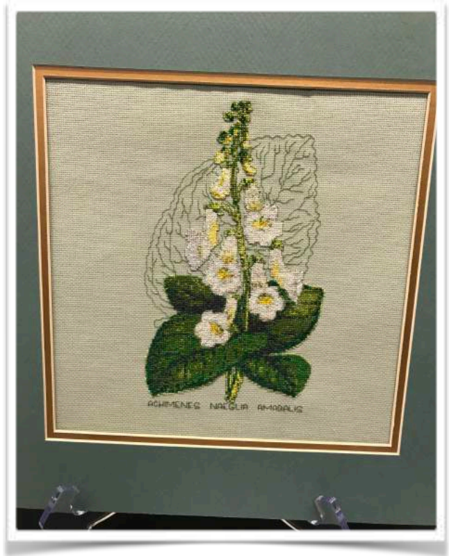
Counted Cross-stitch Connie Rowley