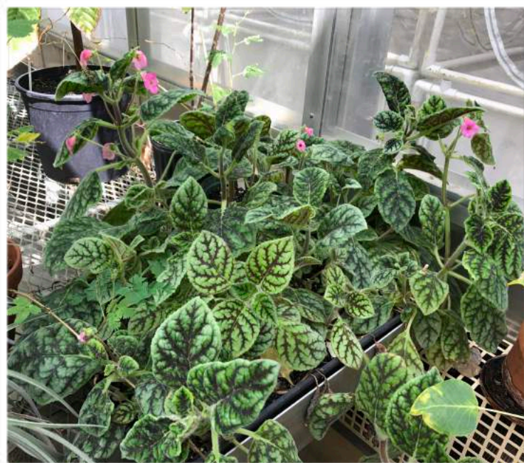
Kohleria amabilis (Selby collection)