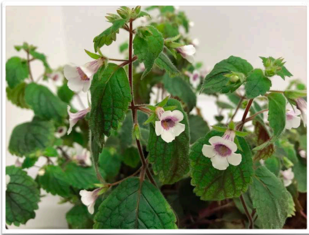
Achimenes misera