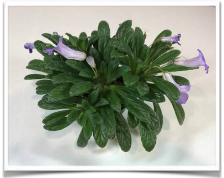
Primulina lineariclayx