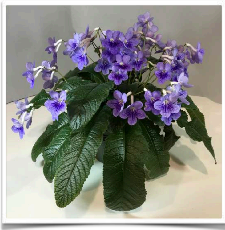
Streptocarpus 'Bethan' Terri Vicenzi