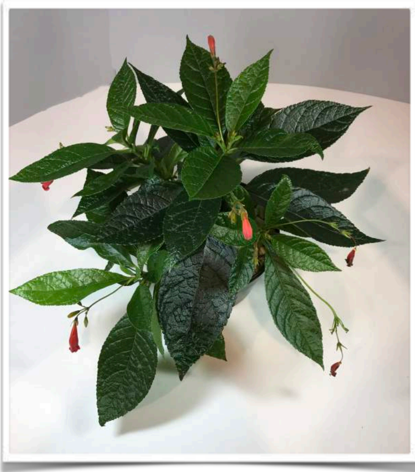
× Rhytidoneria 'Ako Cardinal Flight'