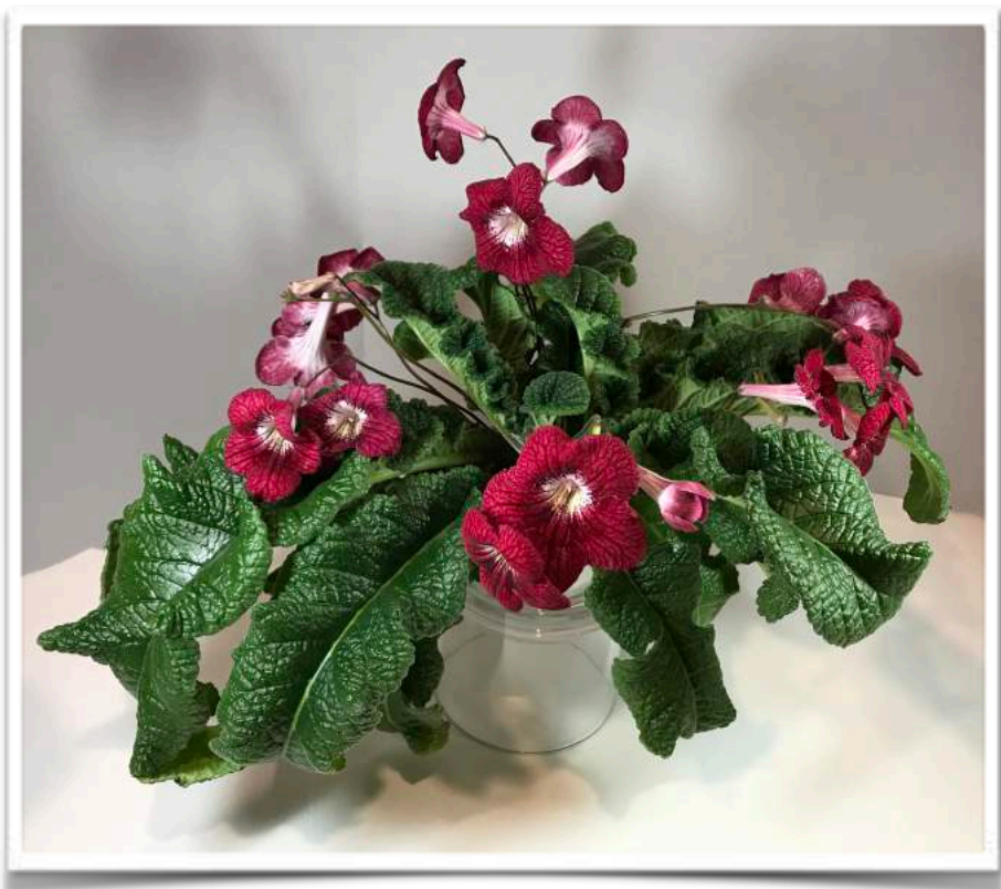
Streptocarpus 'MK-Marki' Sherrie Zimmerman