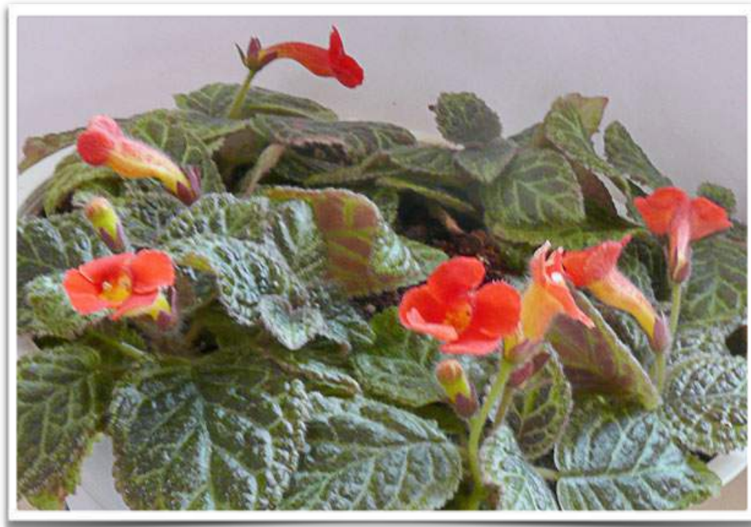
Episcia 'Silver Dust'