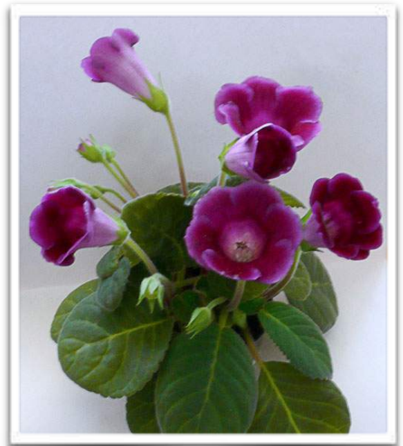
Sinningia speciosa dwarf

I believe it was a success this time as it has been in the past. I always enjoy myself and find it rekindles my love of these plants.