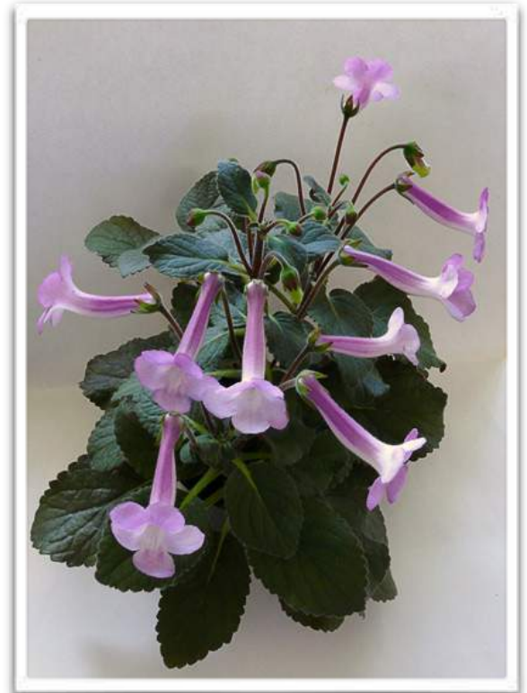
Sinningia 'Stone's Gabriel'