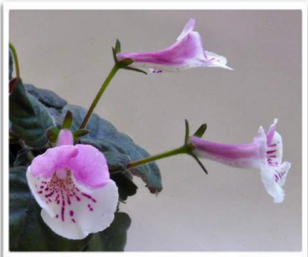
Sinningia 'An's Bom Dia'