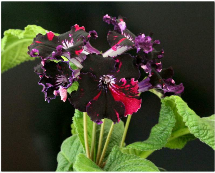
Streptocarpus 'DS—Cat Biggy Mat'