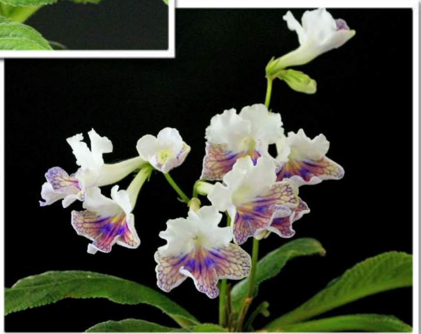
Streptocarpus 'Harlequin Damsel'