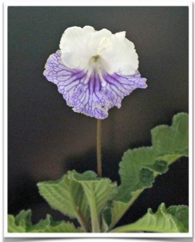
Streptocarpus 'DS—It's A Boy'