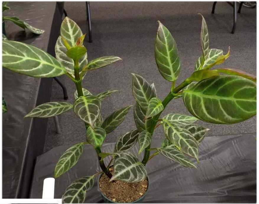
Drymonia chiribogana