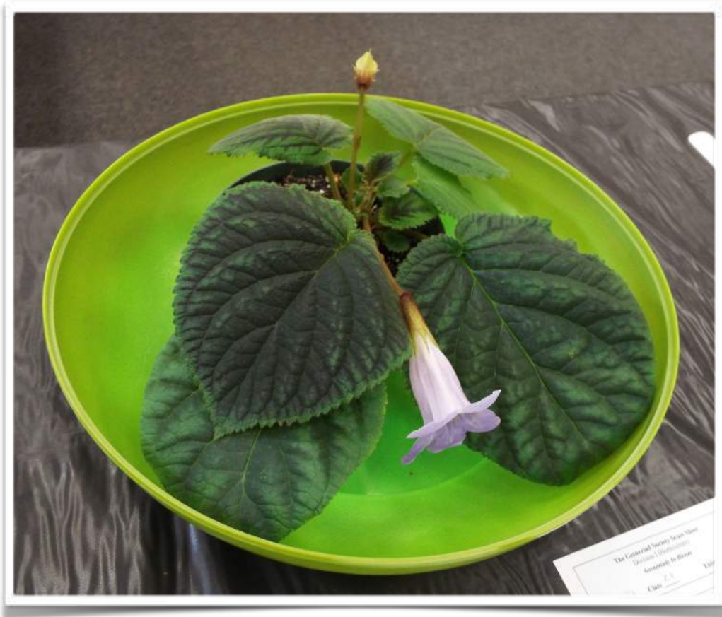
Henckelia speciosa