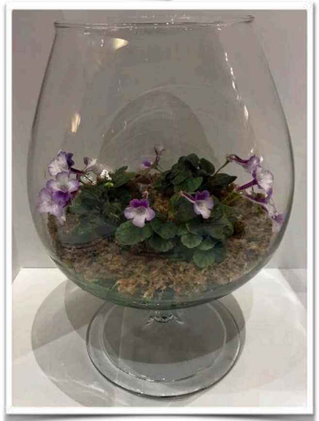
Sinningia 'Freckles' Sayeh Beheshti