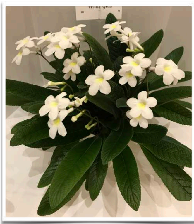
Streptocarpus 'Heartland's White Gold' Adrienne Rieck