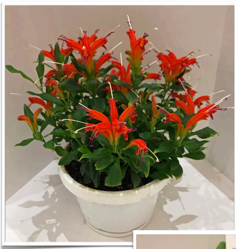
Aeschynanthus 'Mira' Violet Barn