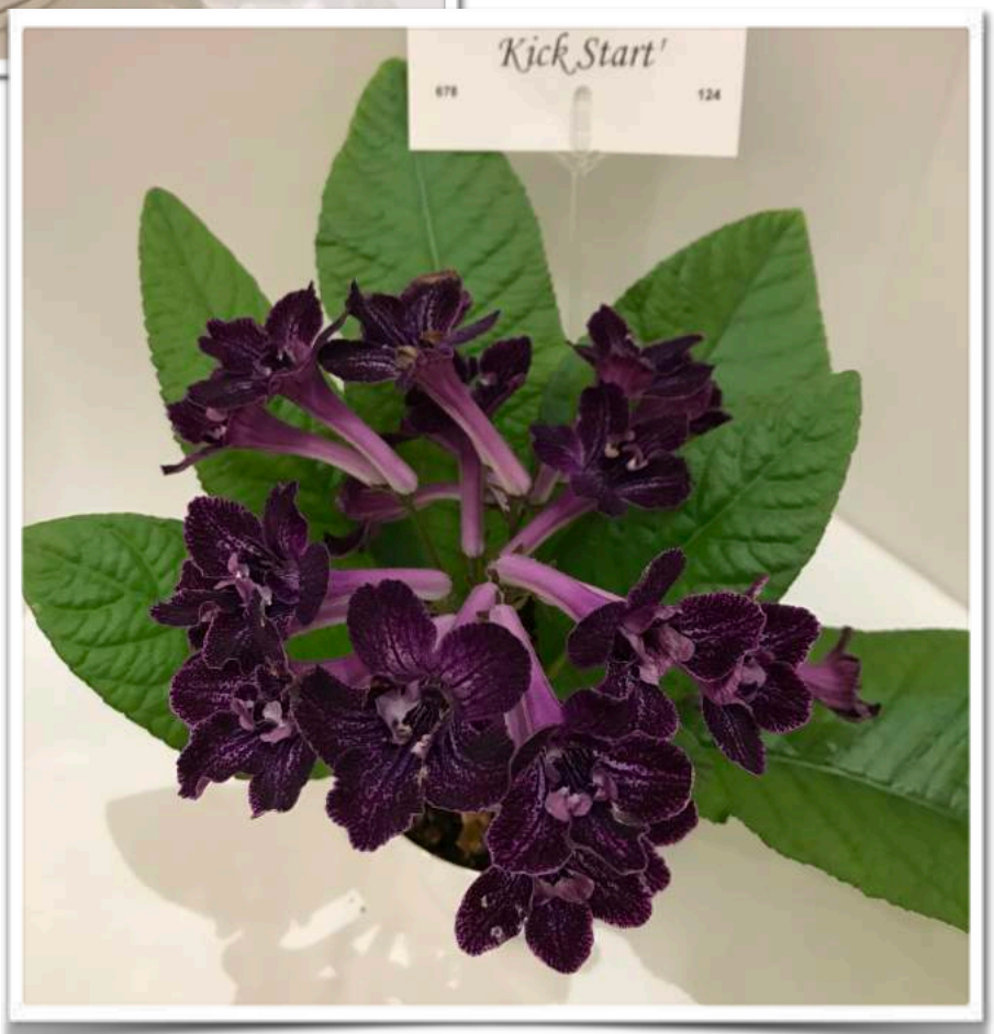
Streptocarpus 'Bristol's Kick Start' Violet Barn