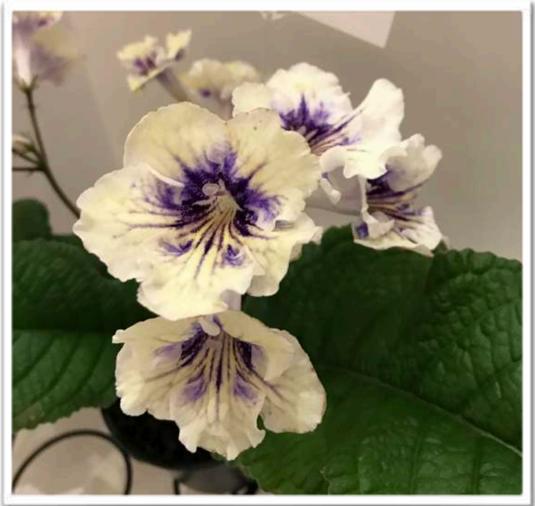
Aeschynanthus x splendidus Paul Sorano