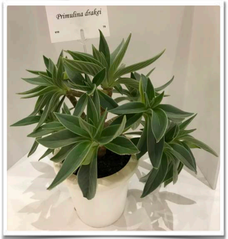
Primulina drakei