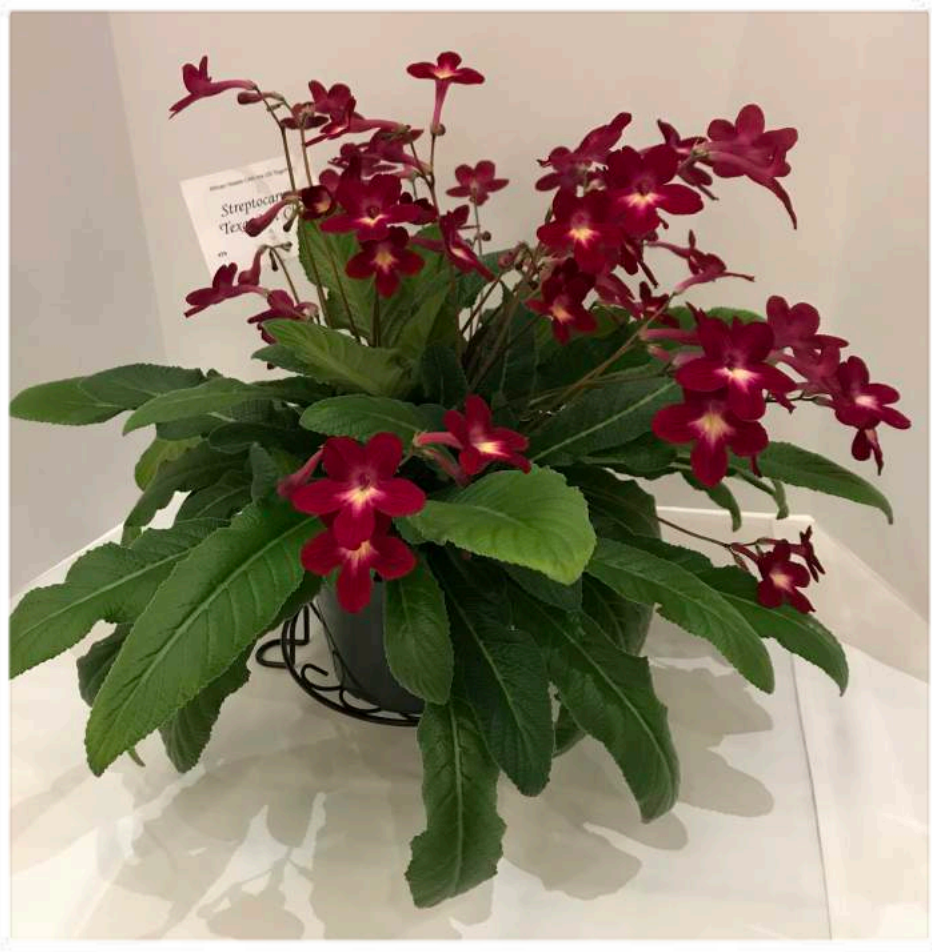
Streptocarpus 'Texas Hot Chili' BJ Ohme