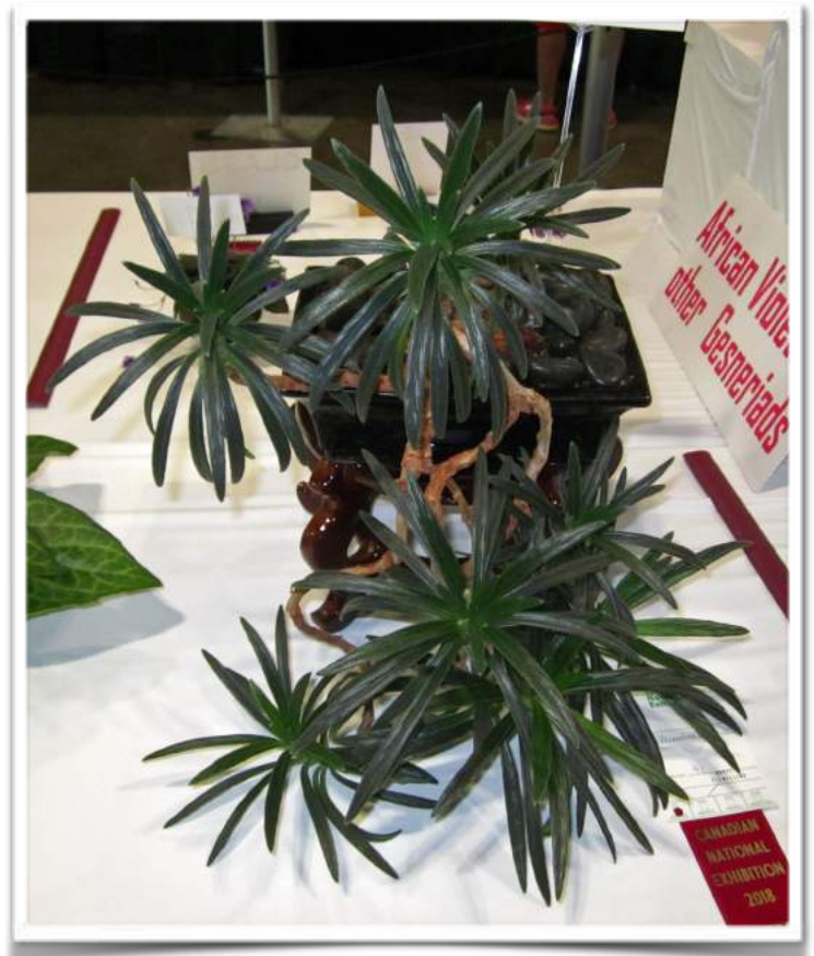
Primulina linearifolia Brett Flewelling