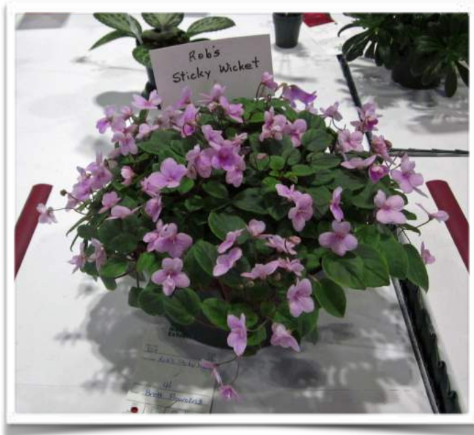
Saintpaulia 'Rob's Sticky Wicket' Brett Flewelling