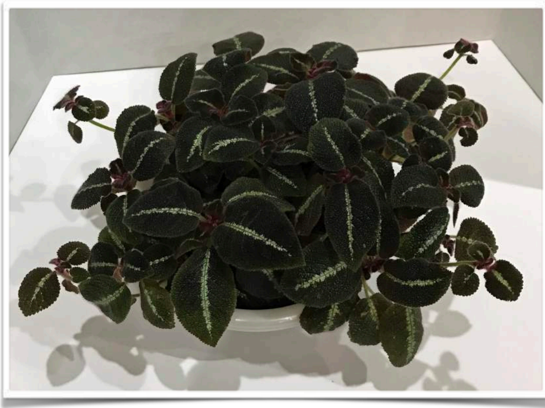
Episcia cupreata 'La Solidad Bronze' Paul Kroll