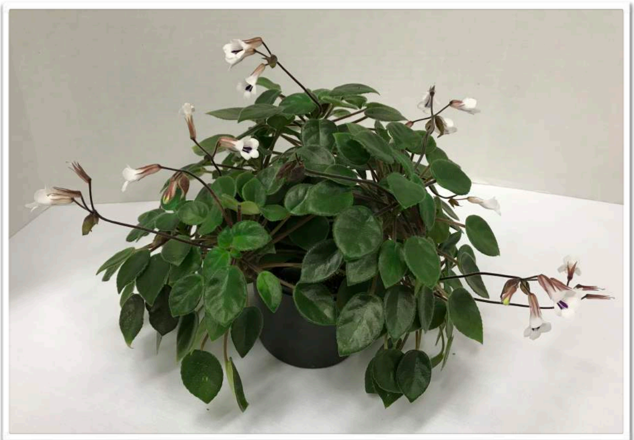
Deinostigma tamiana