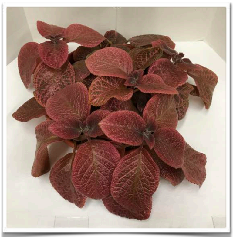
Episcia 'Pink Gator'