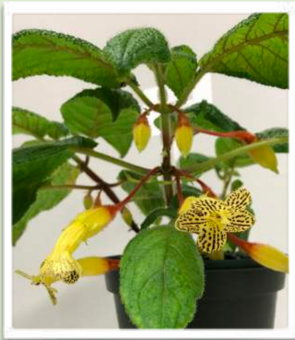
Solenophora tuxtensis shown by Bill Price from Vancouver, BC, Canada at the Lone Star African Violet Council Show in Texas. (See more show photos on the following pages)