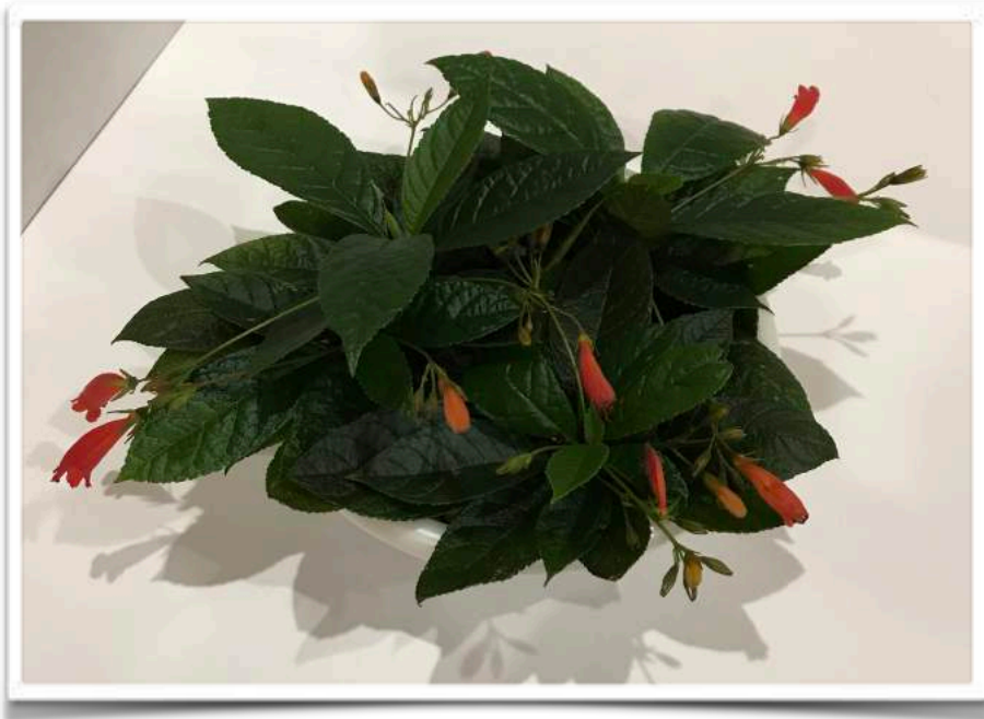
× Rhytidoneria 'Ako Cardinal Flight'