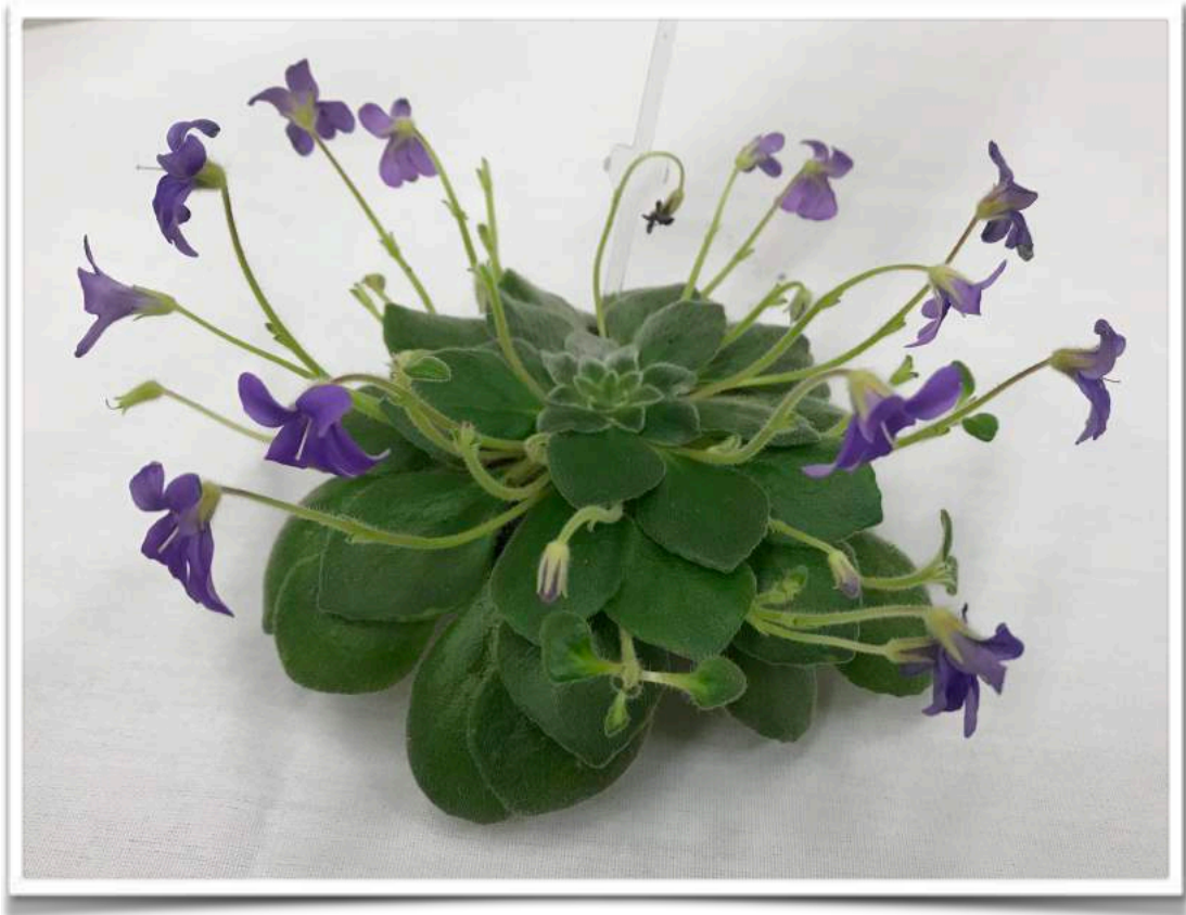
Petrocosmea 'Short'nin' Bread' - Dorcas Brashear