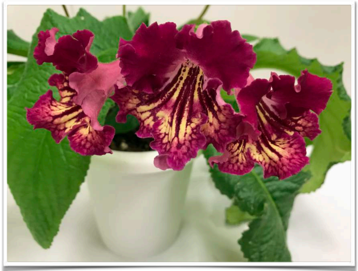
Streptocarpus 'Raydar's Tensie' Dorcas Brashear