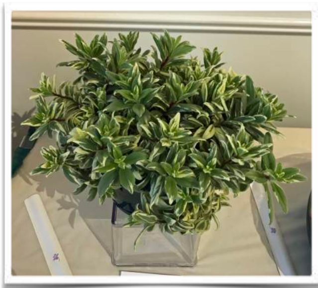
Columnea hirta 'Light Prince'