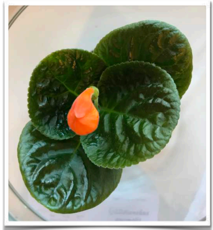
Gasteranthus anomalus Karyn Cichocki