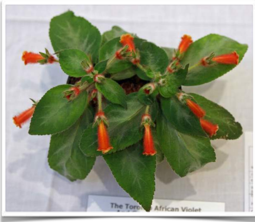
Kohleria 'Green Goblin'