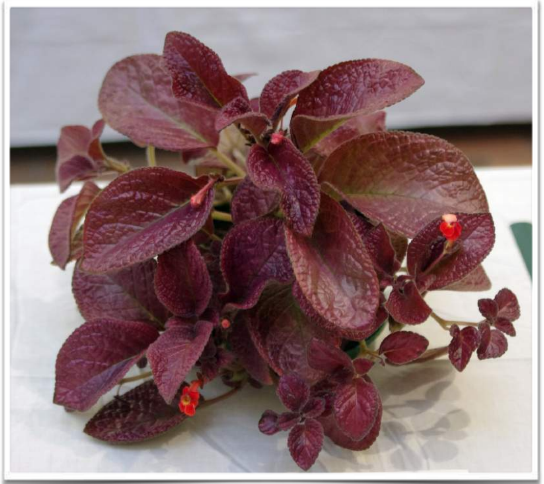
Episcia 'Temptation'