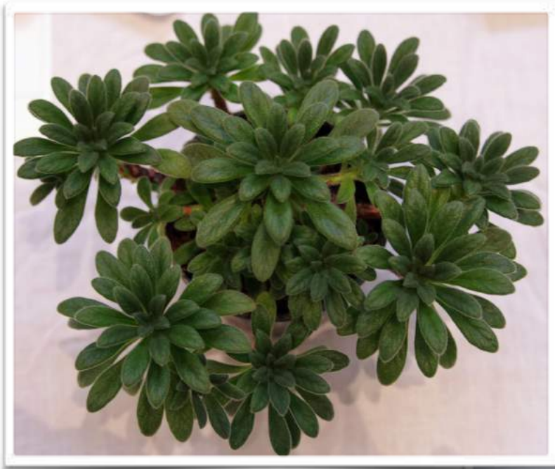
Primulina linearicalyx Brett Flewelling