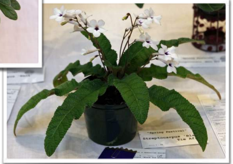
Streptocarpus 'Black Tie Affair' Diane Pagé