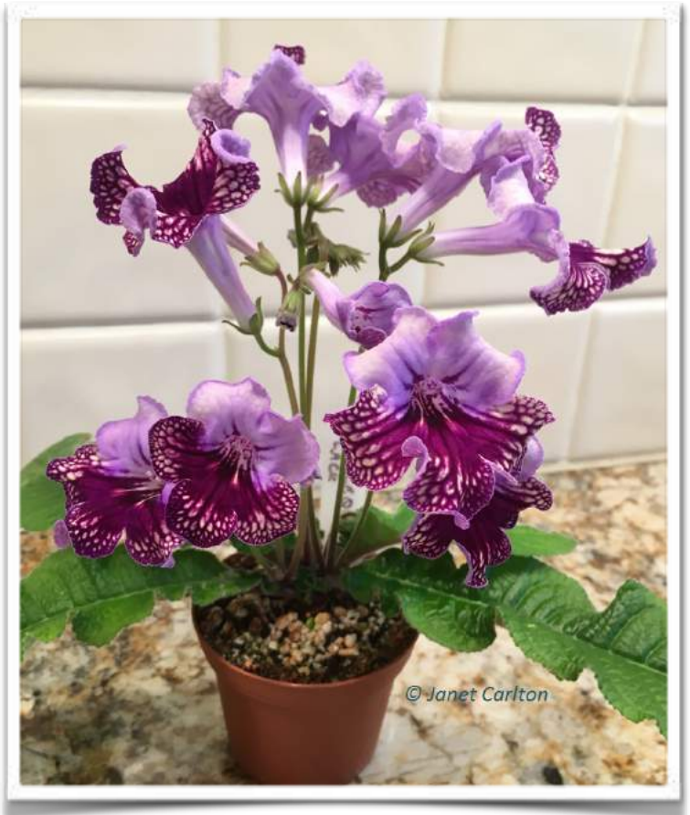
Streptocarpus 'Harlequin Lace'