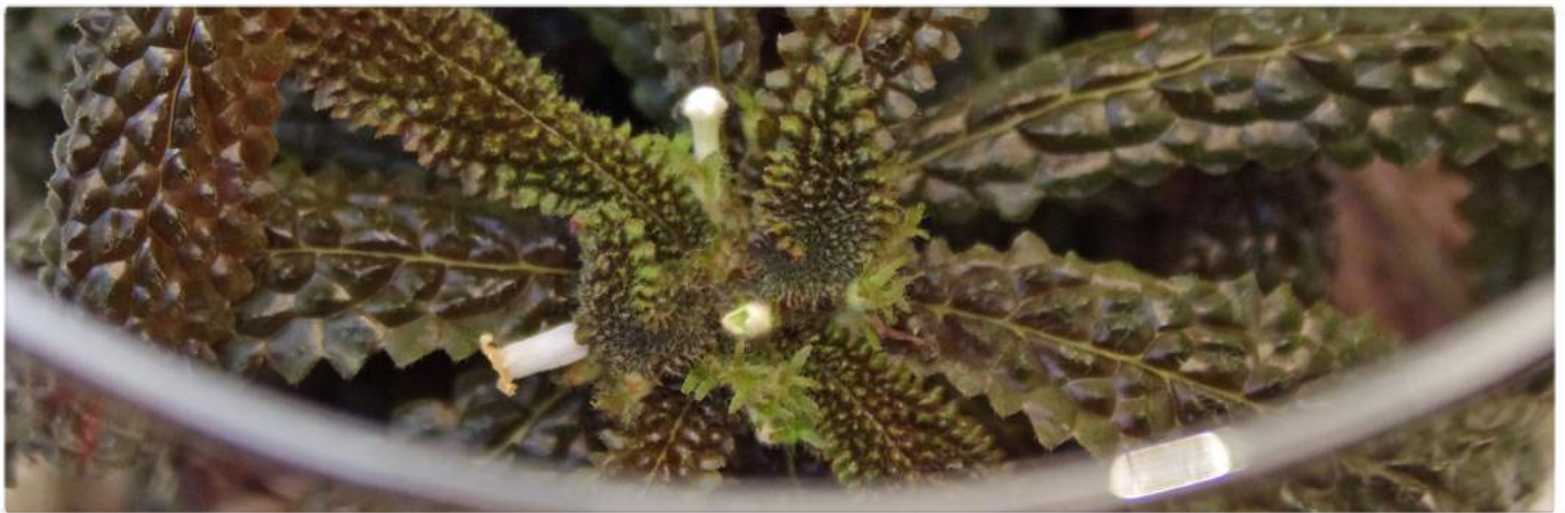
Nautilocalyx pemphidius