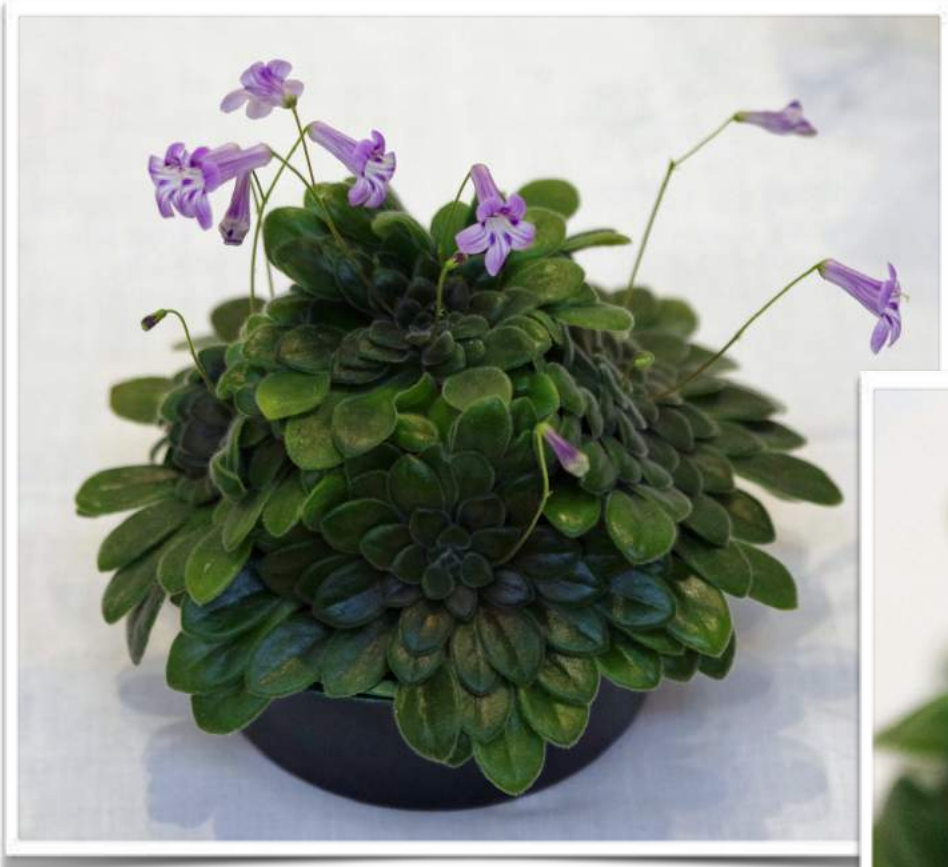
Primulina petrocosmeoides Bill Price