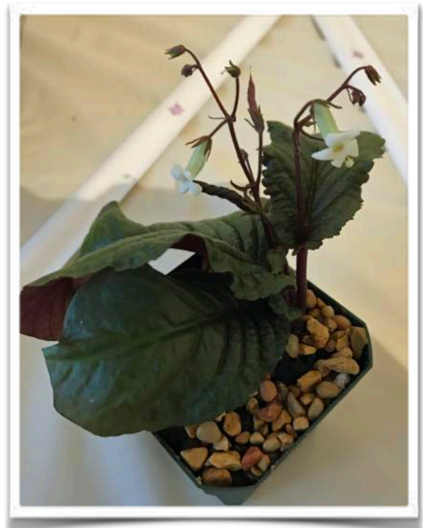
Streptocarpus rimicola Karyn Cichocki