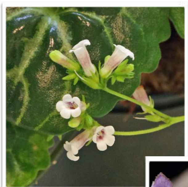
Primulina glandulosa var. yangshouensis