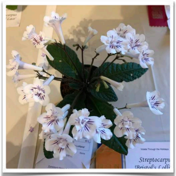
Streptocarpus 'Bristol's Lollipop' Emilia Rykowski