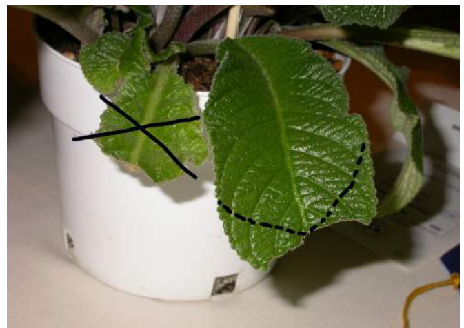
This entry could have been improved by removing the smaller leaf on the left and trimming the main leaf in the shape of a normal leaf tip with pinking shears or craft scissors.

During judging, the “condition” of the plant – basically grooming – accounts for 30 points on the score sheet. Spend time doing it, and you have nearly one-third of the total points possible. Clean the container and remove spent flowers. Use craft scissors or regular scissors to trim leaves, depending on whether the leaves have notched edges. Remove anything that detracts from the plant.