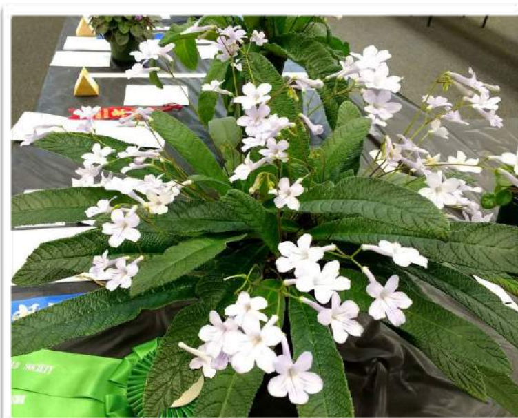
Streptocarpus collection (left to right above) — Streptocarpus 'Falling Stars', S. 'Emily', S. 'DS-Kalahari', S. 'Harlequin Lace', S. 'Salmon Sunset'