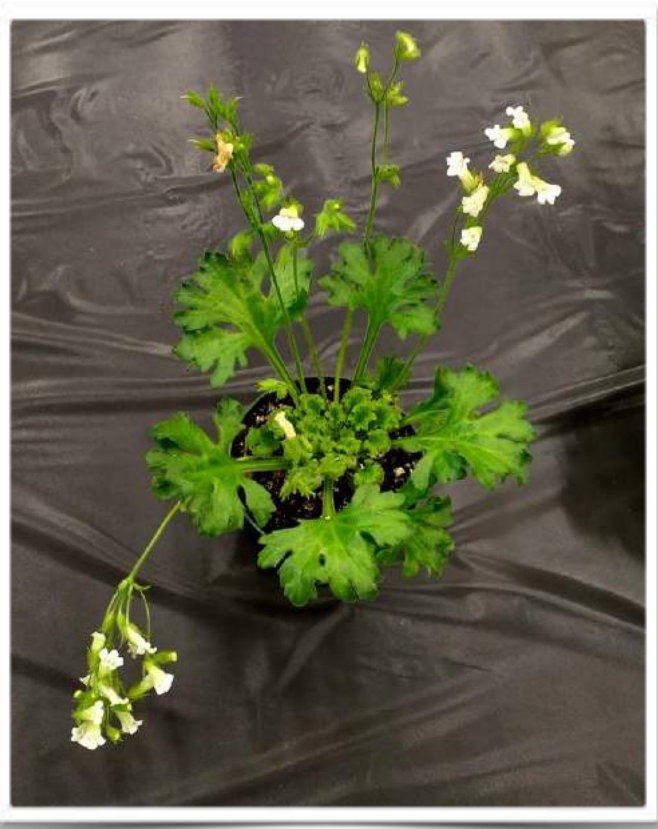
Primulina bipinnatifida