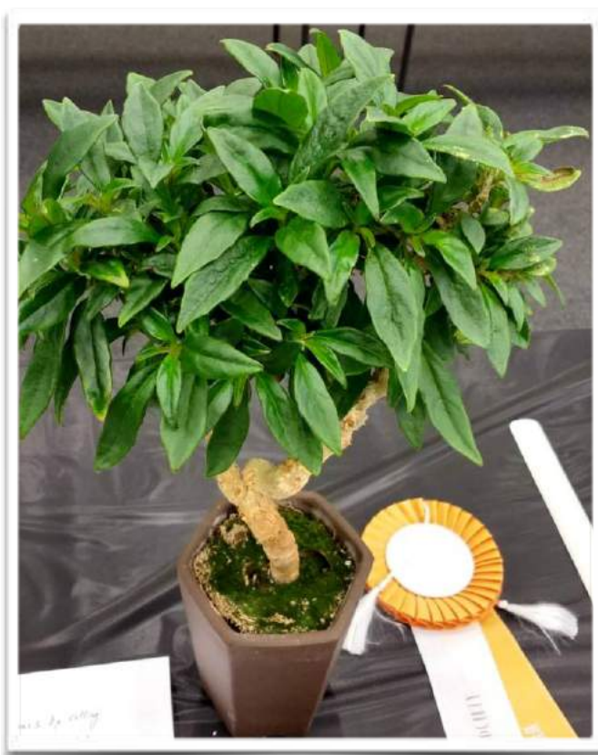
Columnea purpusii - Ben Paternoster