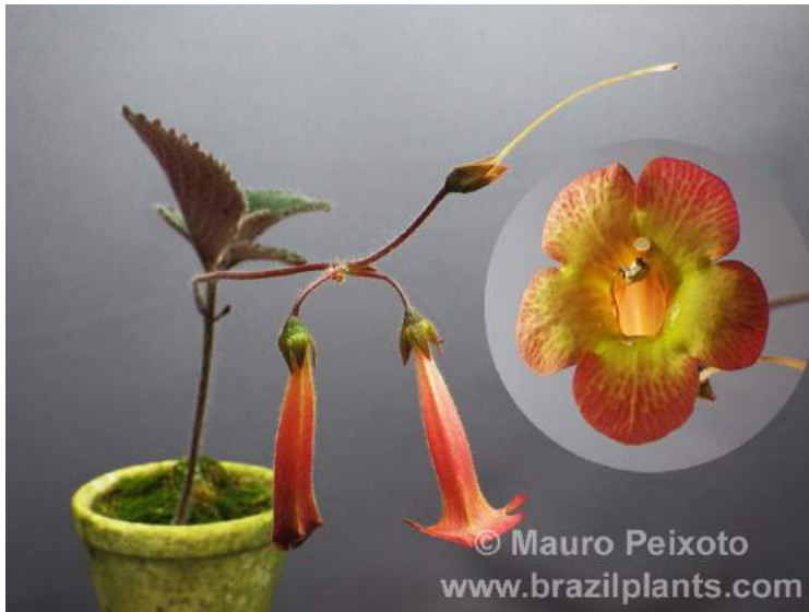
Left — Sinningia sp. "Itaguassu" is now Sinningia flammea