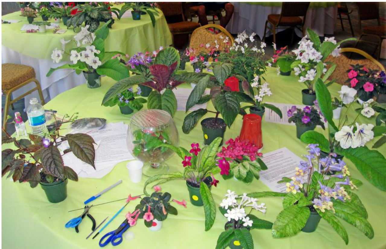
An entries table for grooming. Sticky paper dots, which will be given to you, are placed on entered pots to indicate the “front” display side of the plant.

If this is your first convention entering plants, look at the Society’s website featuring the 2019 Convention and review the convention program, which lists each day’s activities. Note the deadline for “Submission of Show Entry Forms” and be prepared to list your entries on a form and submit it the day before entries begin. Submissions will be in the same place where you received your convention registration packet and name badge.