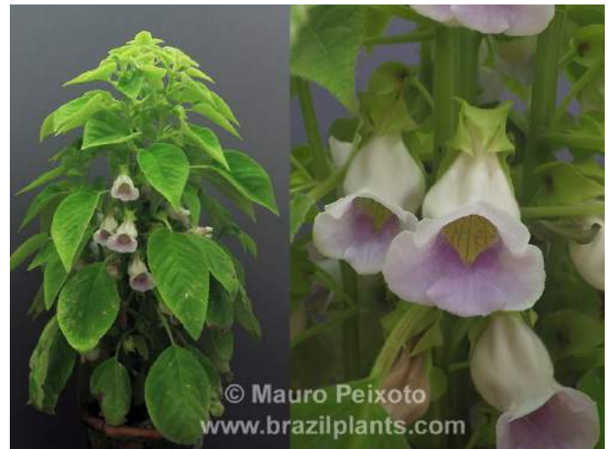
Right — Sinningia sp. "Castelo" is now Sinningia hoehnei