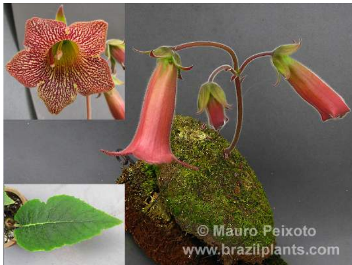
Left — Sinningia sp. "Pancas" is now Sinningia stapeliodes

So if you are growing any of these plants please change your labels.