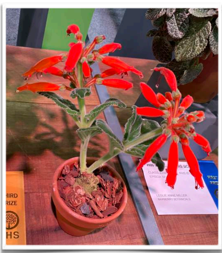
Sinningia cardinalis