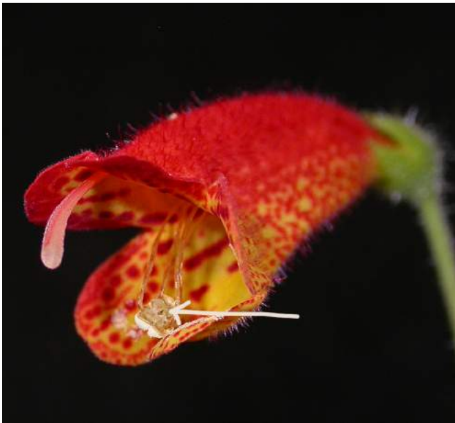
This photo is significant because it shows that when the stigma is most receptive to pollen, the flower's own anther/pollen are nowhere near it. The filaments are limp, causing the anthers to fall to the base of the corolla.