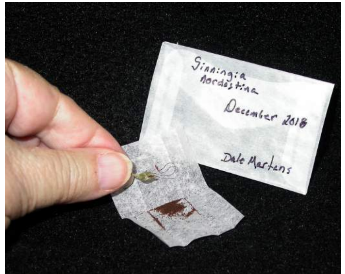
I harvested several seed pods for the Seed Fund.