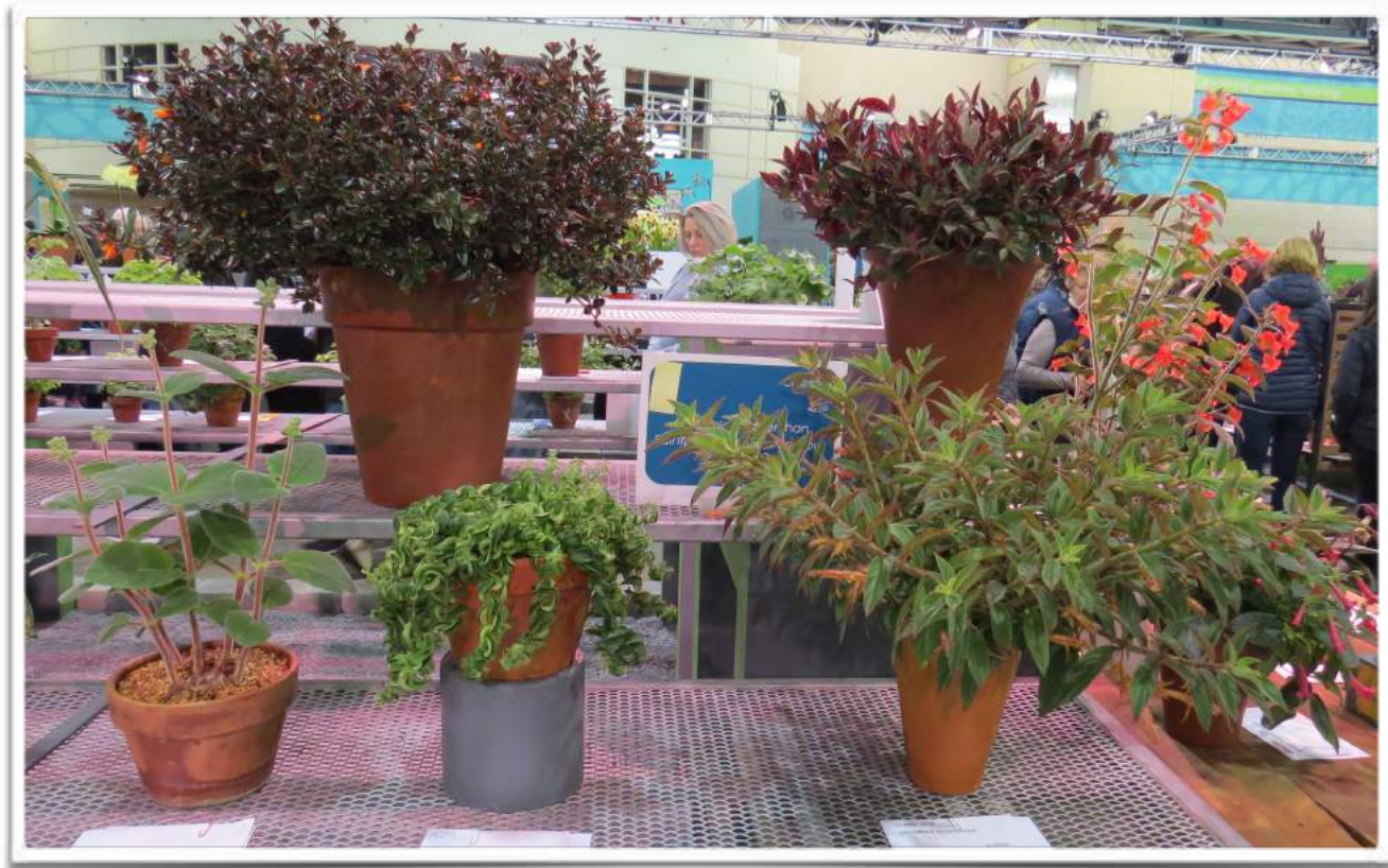
Gesneriads over six inches class