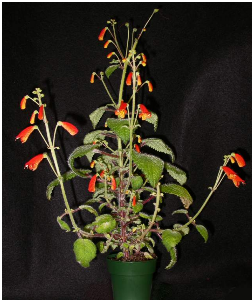
By November 12, 2018, shoots in the axils began to bloom