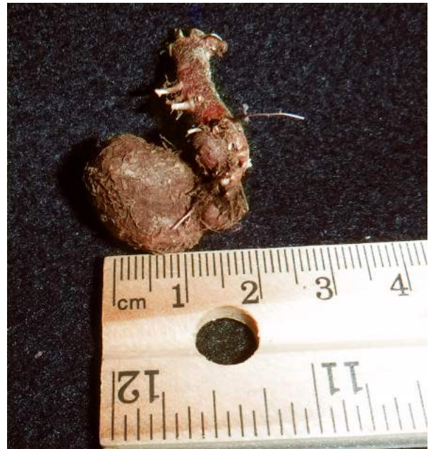
By the end of December 2018, I harvested the tuber, which will be kept for the next 6 to 7 months in barely moist vermiculite.