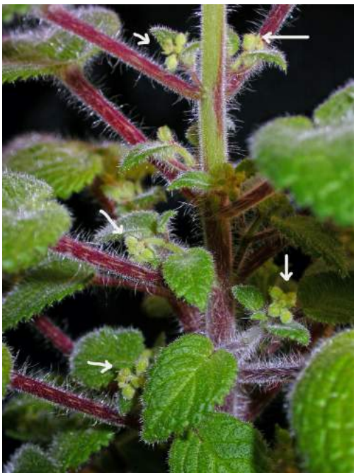
Also on October 26, I saw multiple flower stems with buds in the nodes.