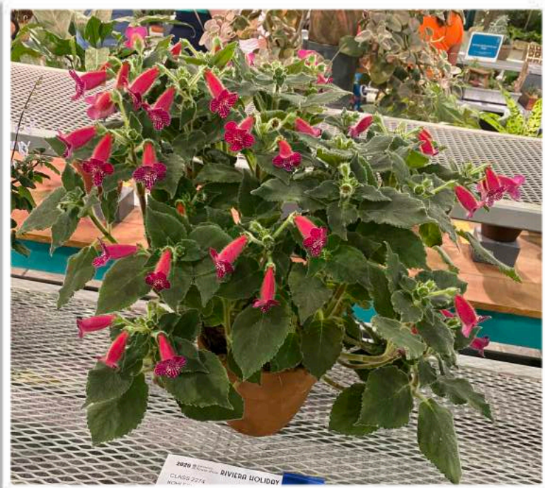
Kohleria cv. Leslie Anne Miller