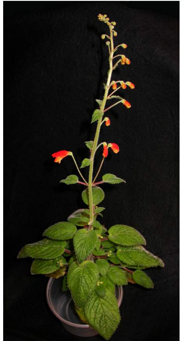
As of October 26, 2018, I had acclimated the plant to room air and the inflorescence began to bloom.

Reference: The GLOXINIAN, 2Q 2000, Vol. 50, No. 2, pp. 18-21.