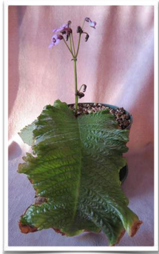
Streptocarpus denticulatus Karyn Cichocki