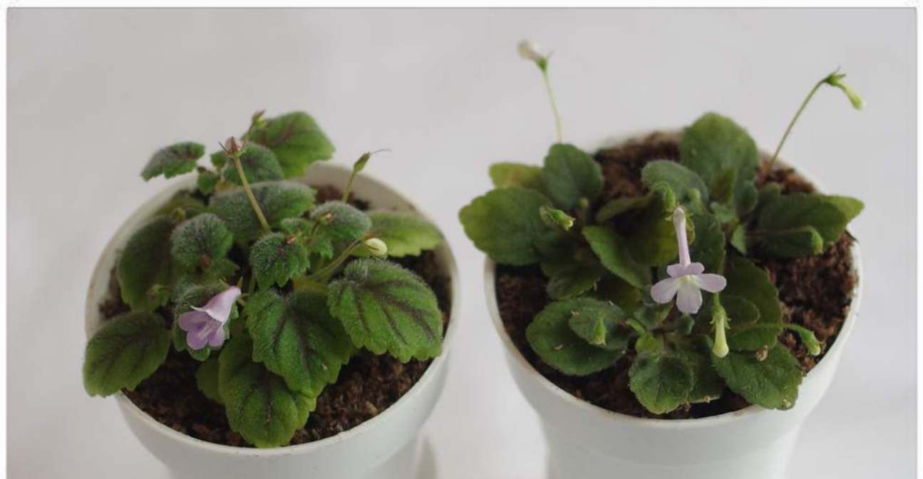
Sinningia minima and Sinningia pusilla