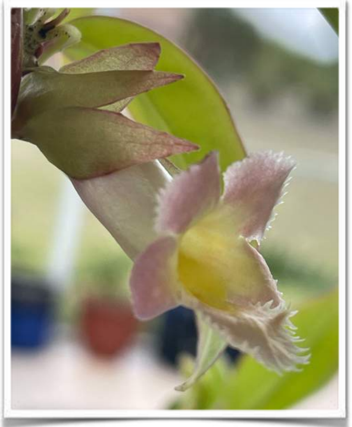
Drymonia 'First Peach' really loving the hot days and humidity on the lanai in Florida.