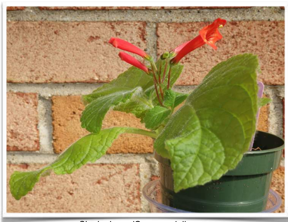
Sinningia sp. 'Coromandel'