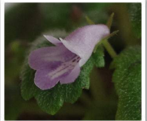
Sinningia minima closeup