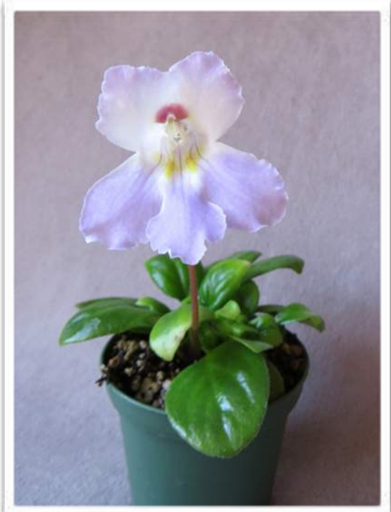
Primulina macrorhiza