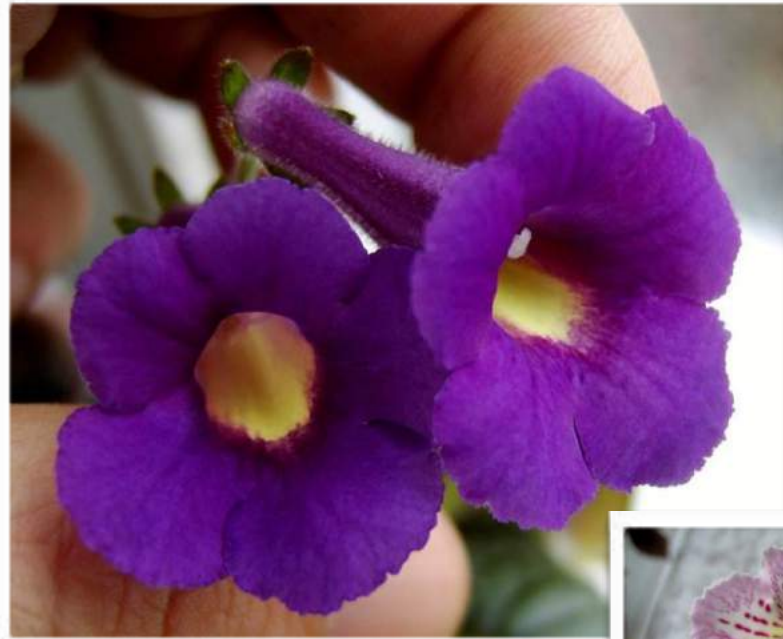
Sinningia 'SRG's Wormhole'