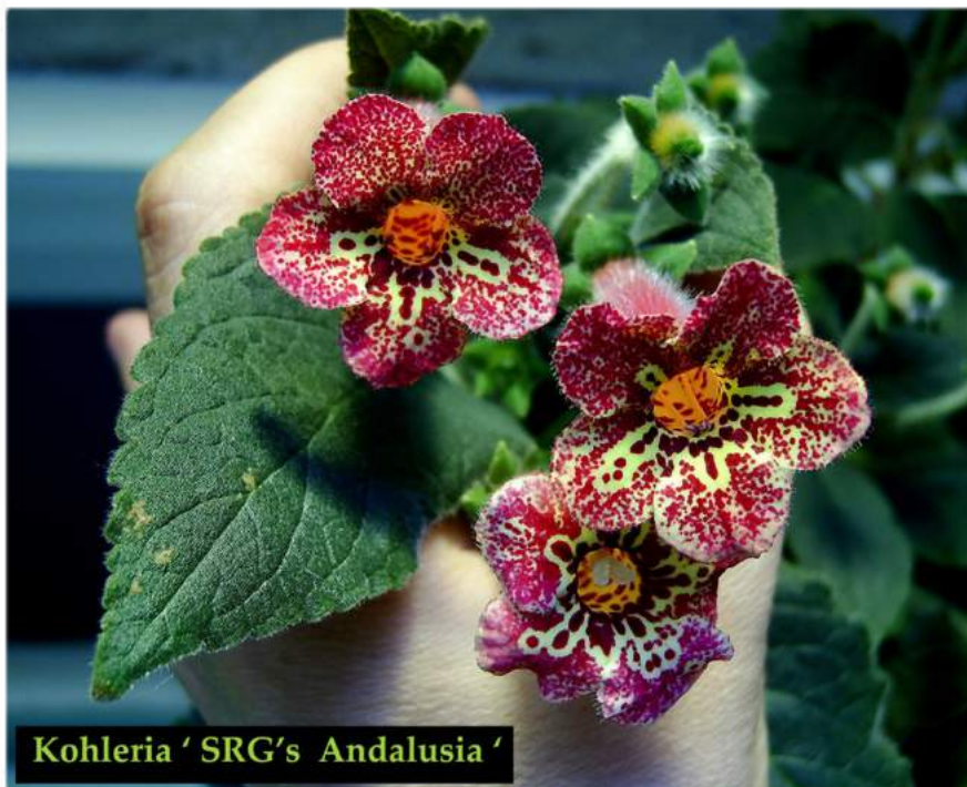
Kohleria 'SRG's Andalusia'