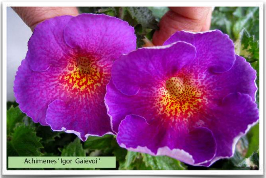
Achimenes 'Igor Gaievoi'