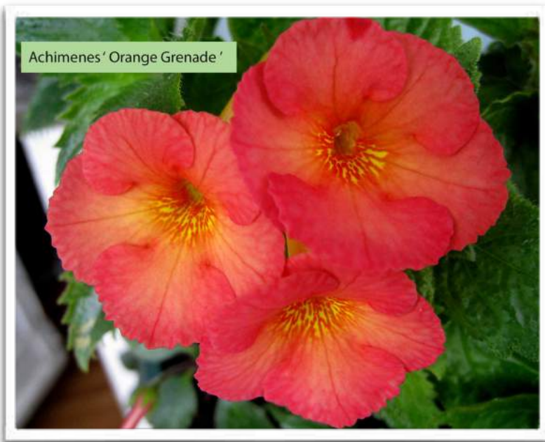
Achimenes 'Orange Grenade'