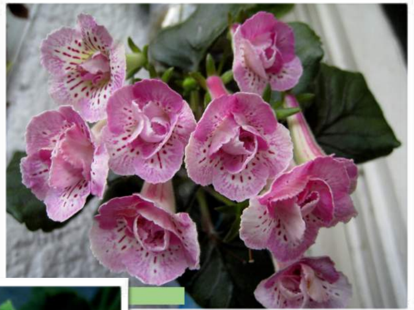
Sinningia 'SRG's Sascha'