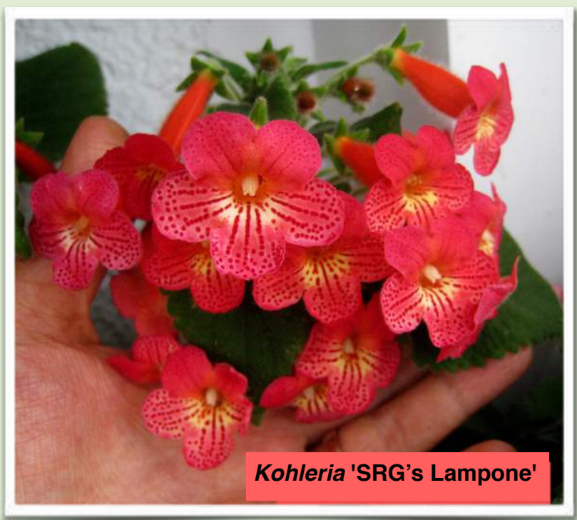
Kohleria 'SRG's Lampone'