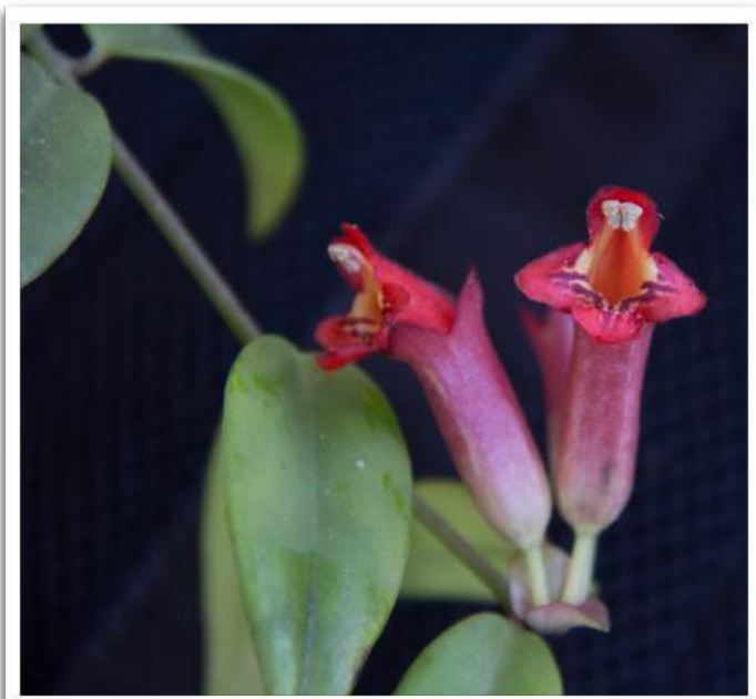
Aeschynanthus species #1 from Tinombala