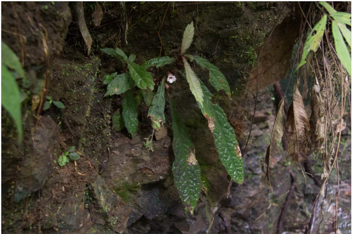
Cyrtandra geocarpa found at the Malane Falls area in Toli-Toli.