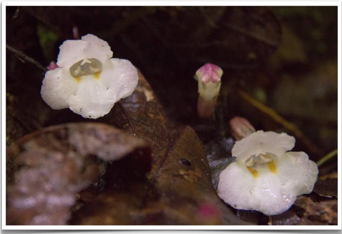
Cyrtandra geocarpa from Malane Falls area in Toli-Toli.