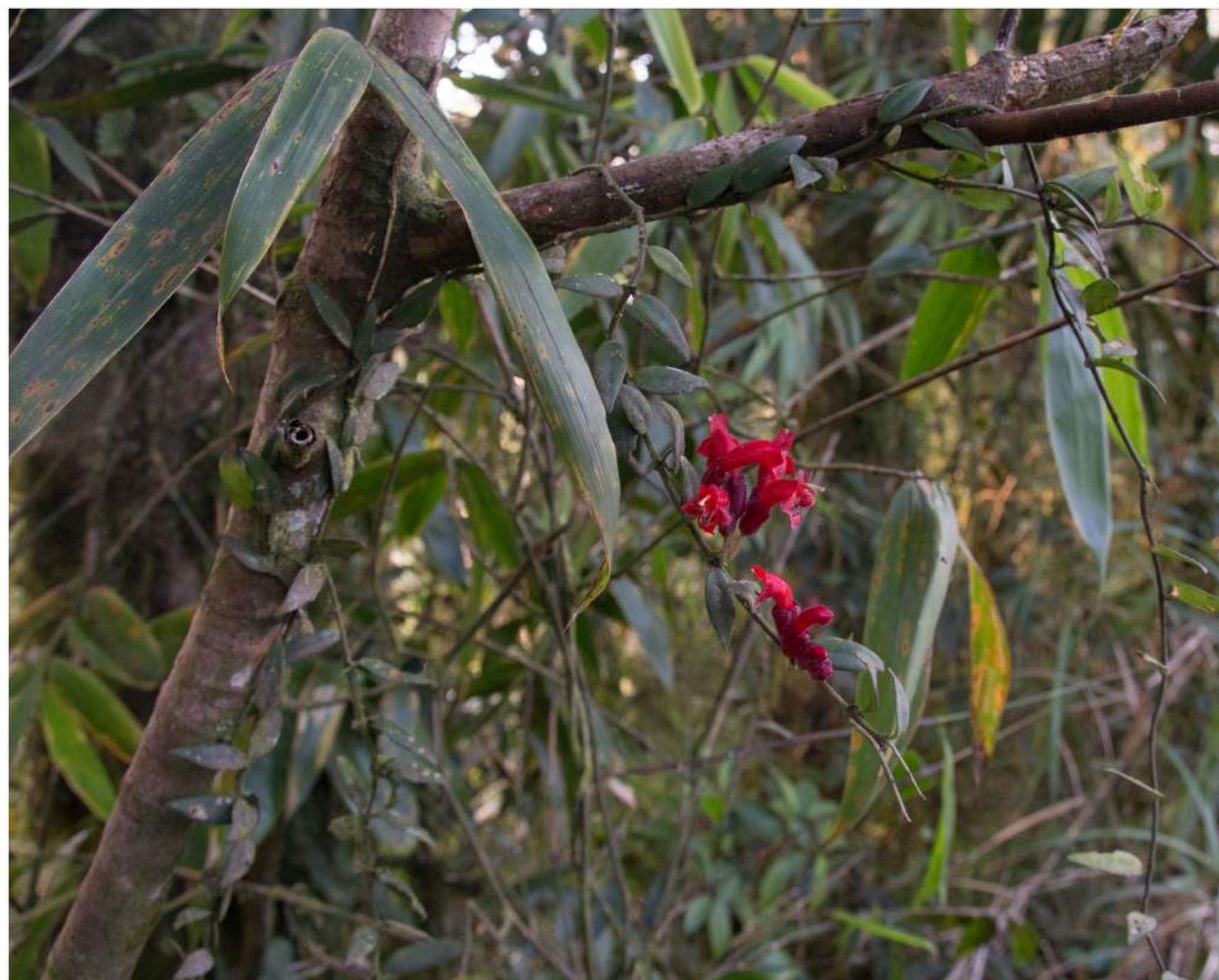
Aeschynanthus species #2 from Tinombala.