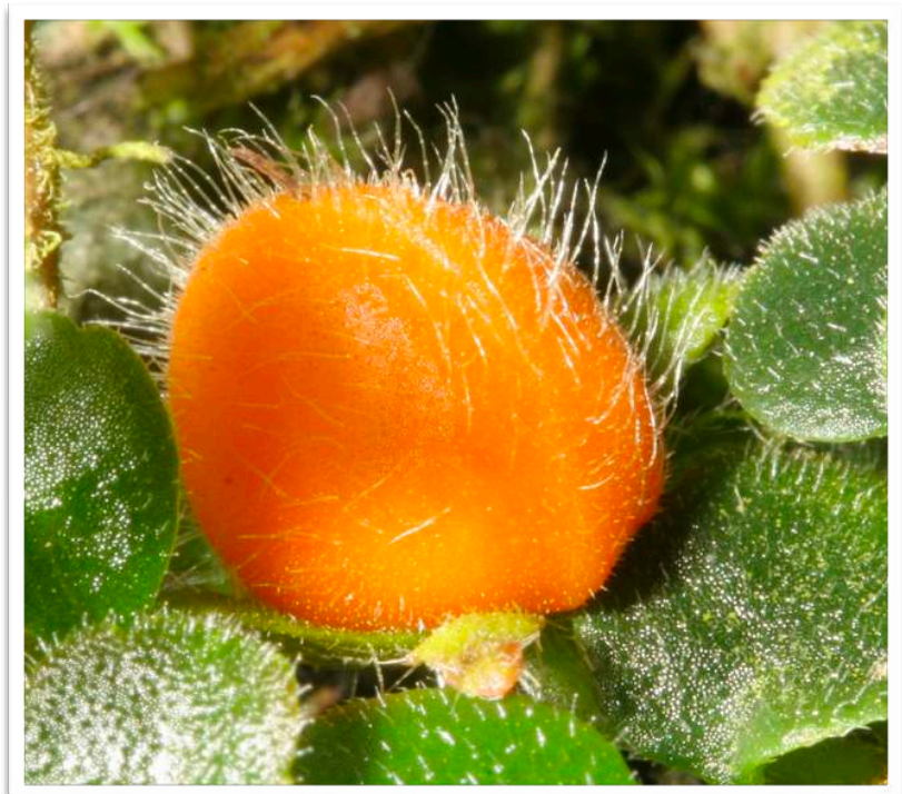
Neomortonia rosea berry

excitement when I saw the buds and blooms. So I thought that I'd share a shot or two here, for those that haven't seen the amazing flowers for this species. Yes, they are that fringed, and yes they can be this pink. Interestingly enough, I did not detect any fragrance in or around the terrarium, so I'm not convinced the Euglossine bees are the actual pollinators despite the color and the fringe. I don't know all the ins and outs, but if it were the case it would be a first for me where a Euglossine bee pollinated flower didn't have a sweet spicy fragrance. So, just enjoy the flowers. They are every bit as remarkable as they look. Cheers.