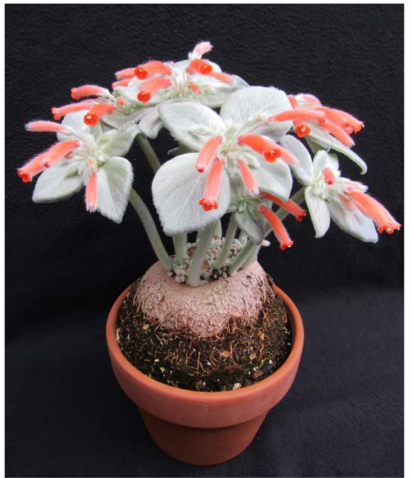
Streptocarpus 'Bristol's Sex Kitten'