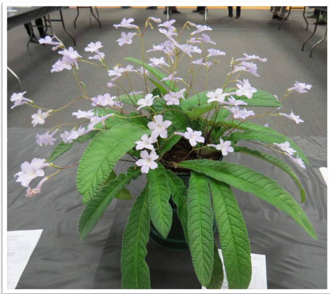
Streptocarpus 'Lavender Rosette' exhibited by Joe Palagonia