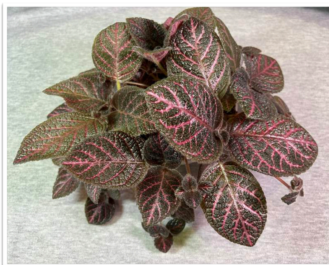
Episcia 'Kee Wee' exhibited by Cathleen Graves