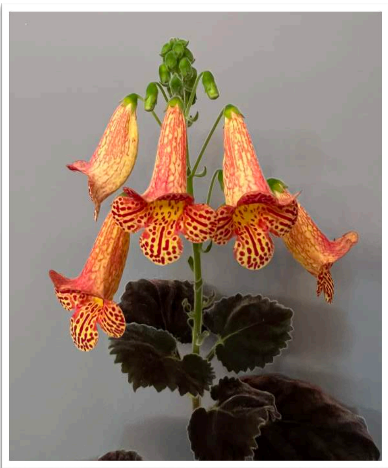
Smithiantha 'RF's Nefertiti'