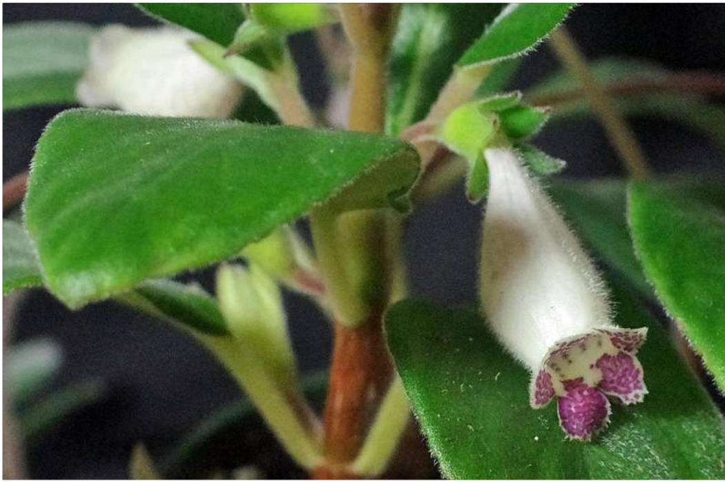
Alsobia baroniae