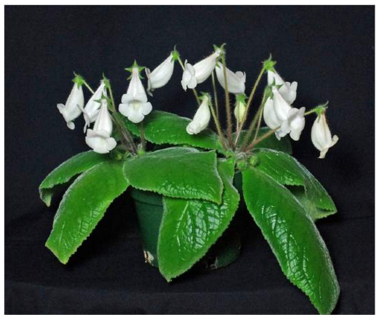
Sinningia richii 'Jaguaré'