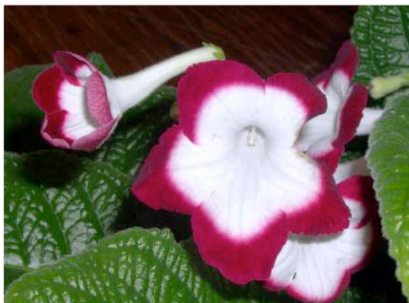
Streptocarpus 'Fleischle Roulette Cherry'

Ultimately, my goal was to see if I could get back the S. 'Fleischle Roulette Cherry' pattern without having to have it present genetically in the background on both sides of the cross. Using S. 'Vmee's Sweet Words' with a yellow base color and a different edge has proved that I can get edges but more in the pattern of the seed parent. So my next step will be to cross one of these seedlings