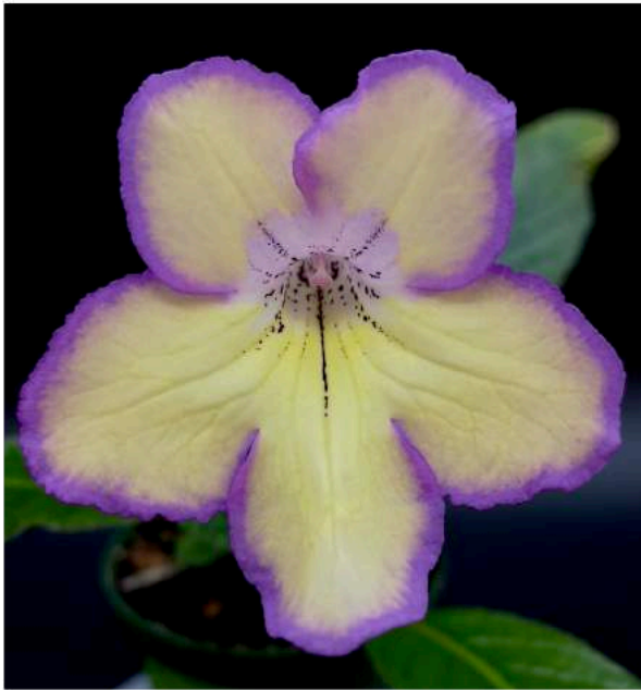
Streptocarpus 'Vmee's Sweet Words'

I created the cross to see how edges are inherited in streptocarpus hybrids. Streptocarpus 'Vmee's Sweet Words' is yellow with a strong pink/purple edge and some throat spots (see attached photos). Streptocarpus 'Steffano's Double Take' has a strong lower red border on the bottom three petals. Streptocarpus 'Fleischle Roulette Cherry' is one of its seed parents.