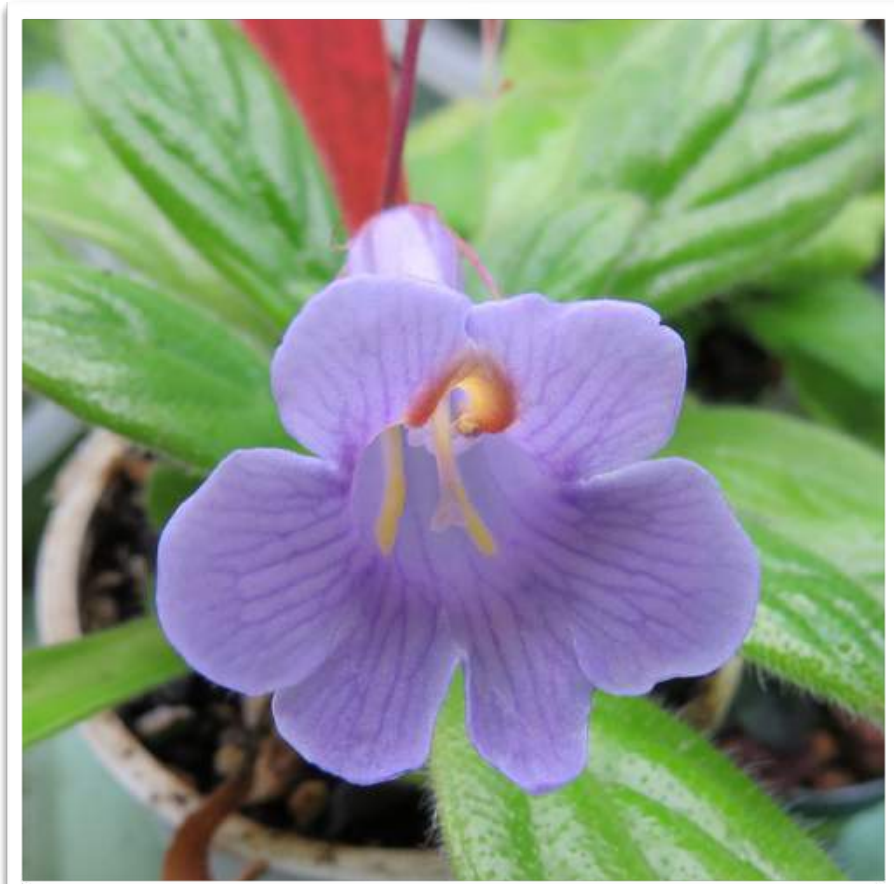
Primulina linearicalyx x P. 'Sweet Dreams'