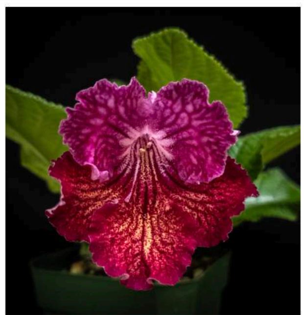
Streptocarpus 'Steffano's Double Take'