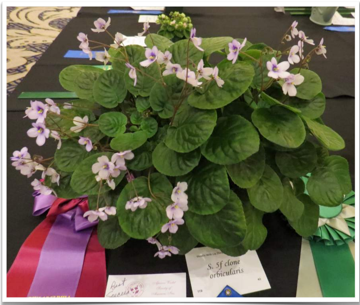
Str. ionanthus ssp. orbicularis cl. orbicularis - Rodney Barnett