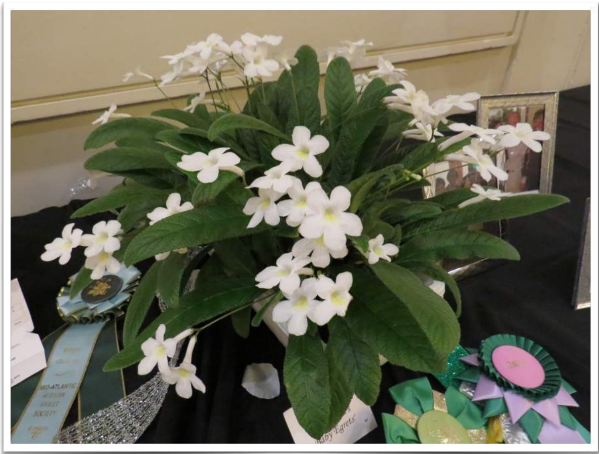
Best Other Gesneriad