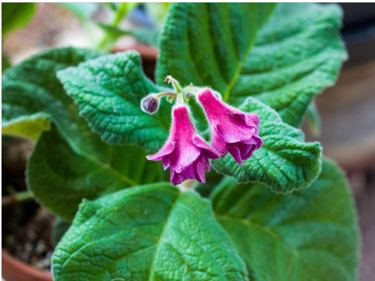
Sinningia aghensis × Sinningia 'Owlsee Red Hot' - Alcie Maxwell