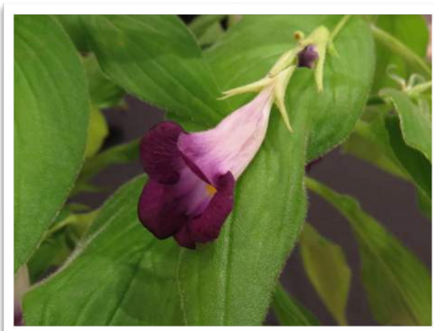
Henckelia walkarae