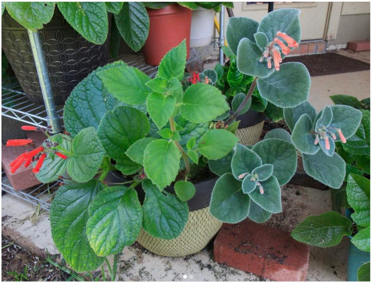
Sinningia lineata hybrid on the left and Sinningia canescens on the right.