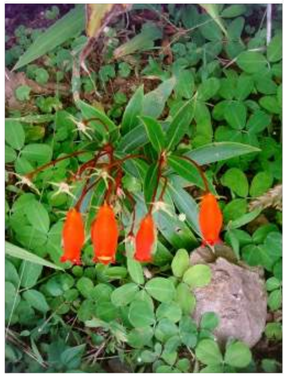
Kohleria spicata , Seemannia sylvatica and