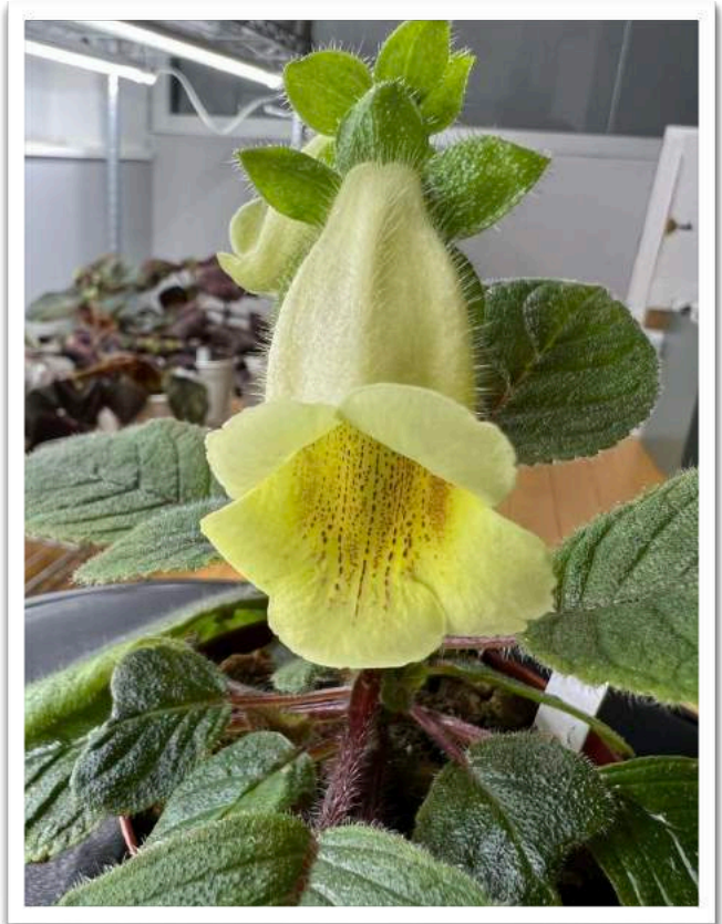
Sinningia conspicua