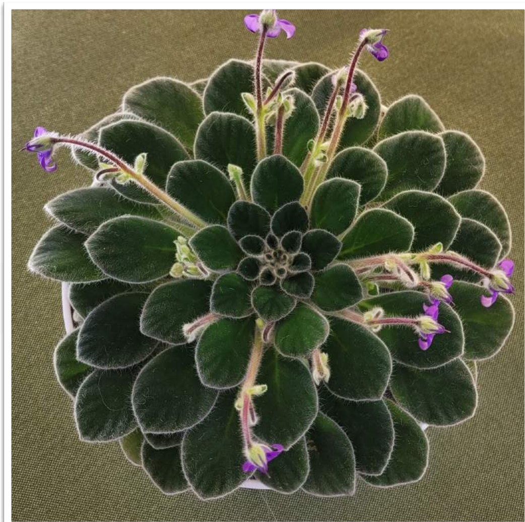
Petrocosmea chiwui (previously distributed as Petrocosmea iodiodes)