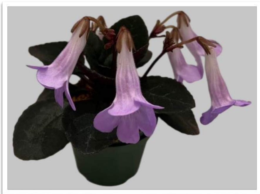
Primulina pseudoyungfuensis