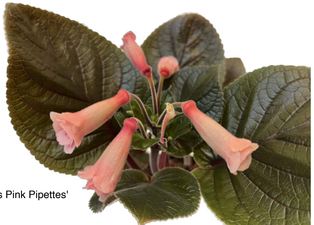
Sinningia 'Peridots Pink Pipettes' Pierre Laforest