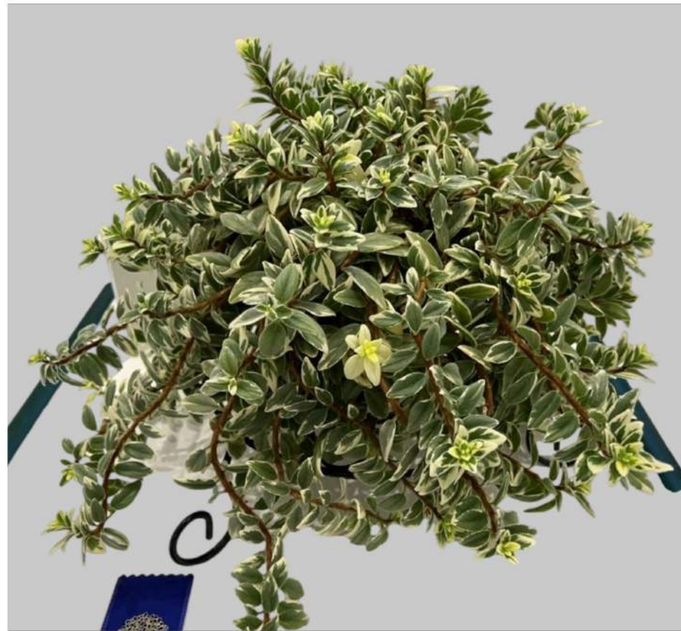
Columnnea hirta 'Light Prince' Brett Flewelling