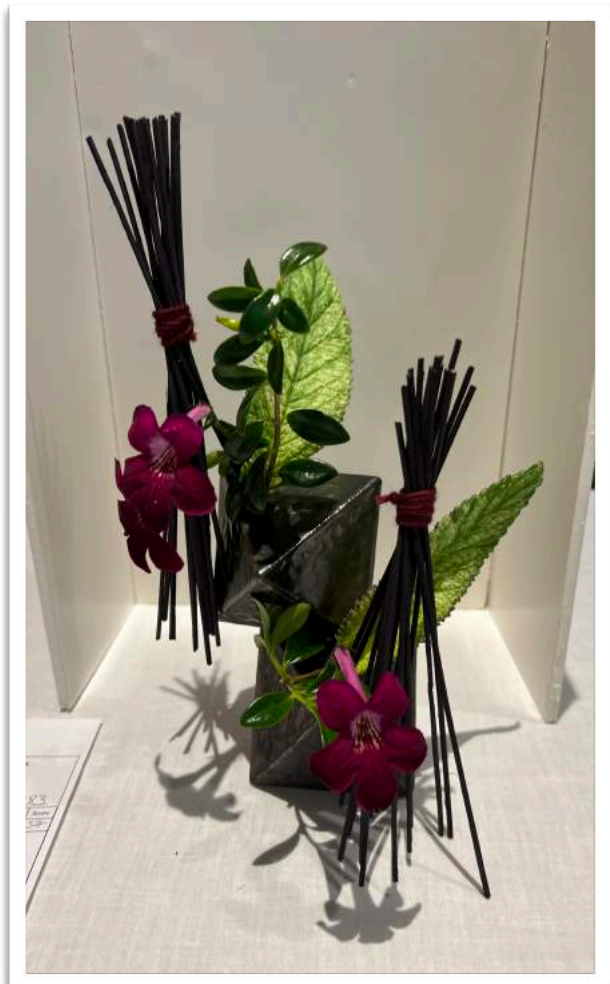
"Flamenco" design - Ursula Eley