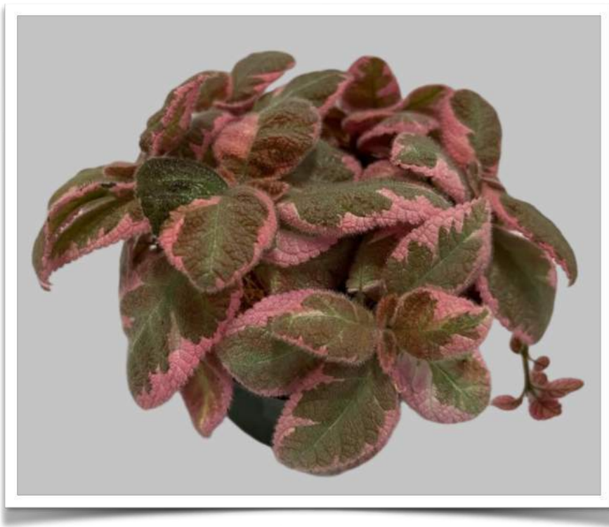
Episcia 'Pink Smoke' Brett Flewelling