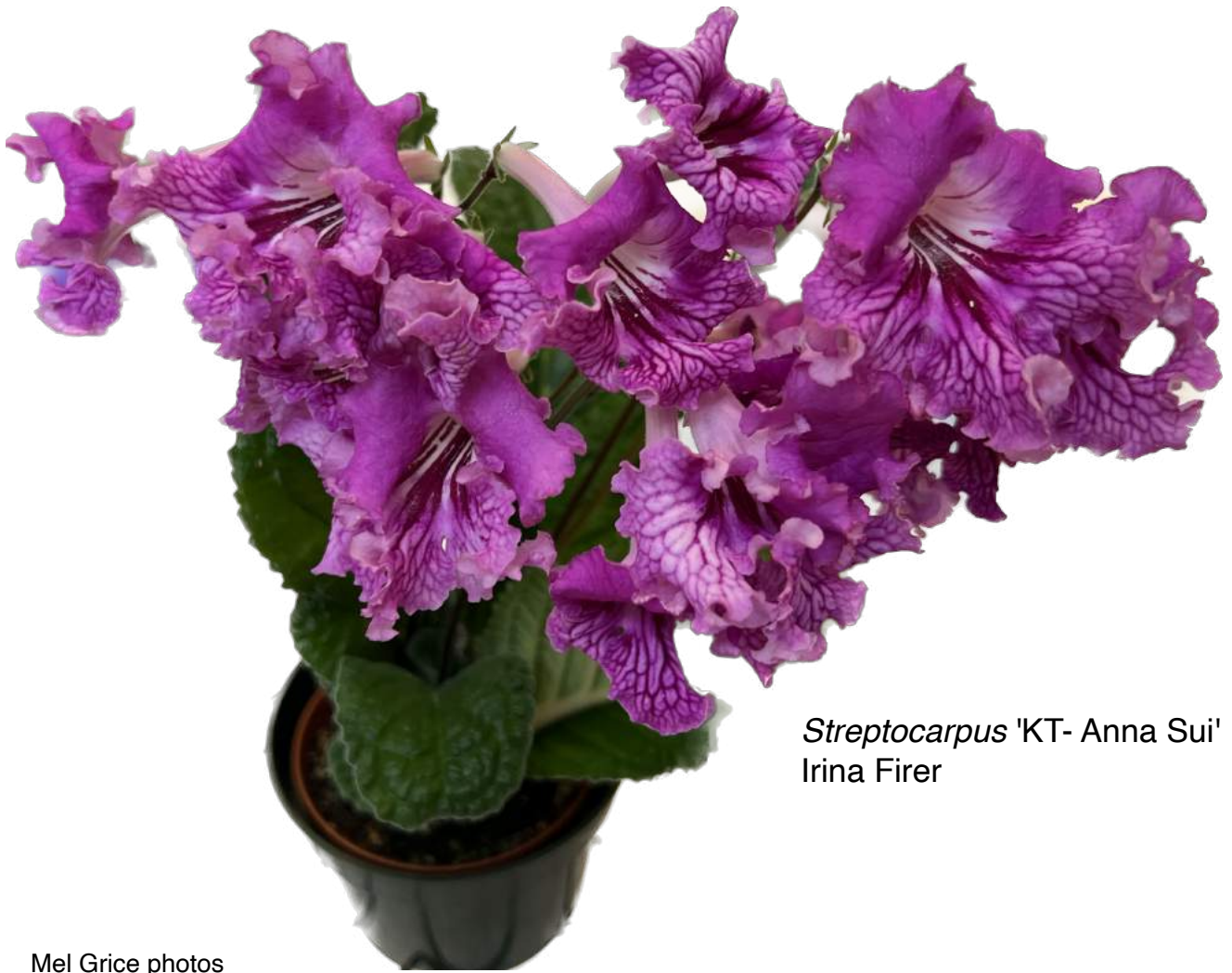
Streptocarpus 'KT- Anna Sui'