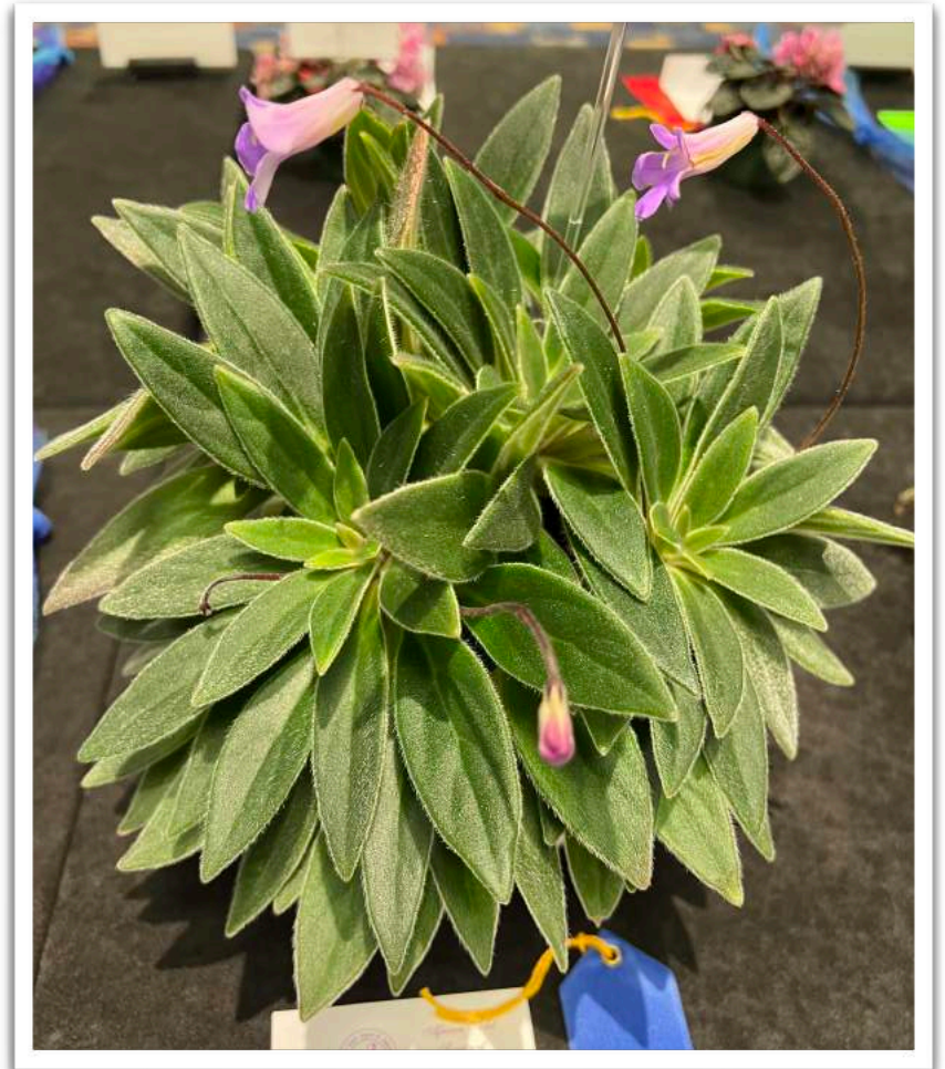
Primulina sp. USBRG 98-083