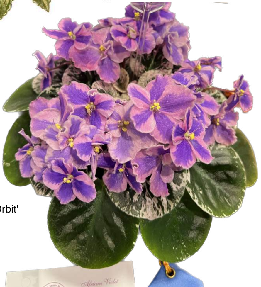
Saintpaulia 'Eternal Orbit' Wayne Geeslin