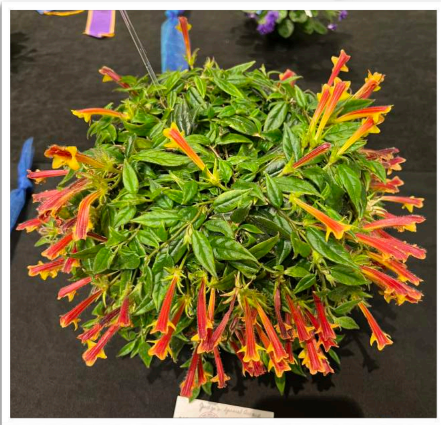
Columnea 'Midget'