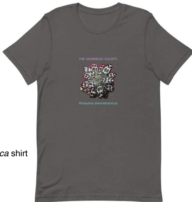
Primulina sinovietnamica shirt