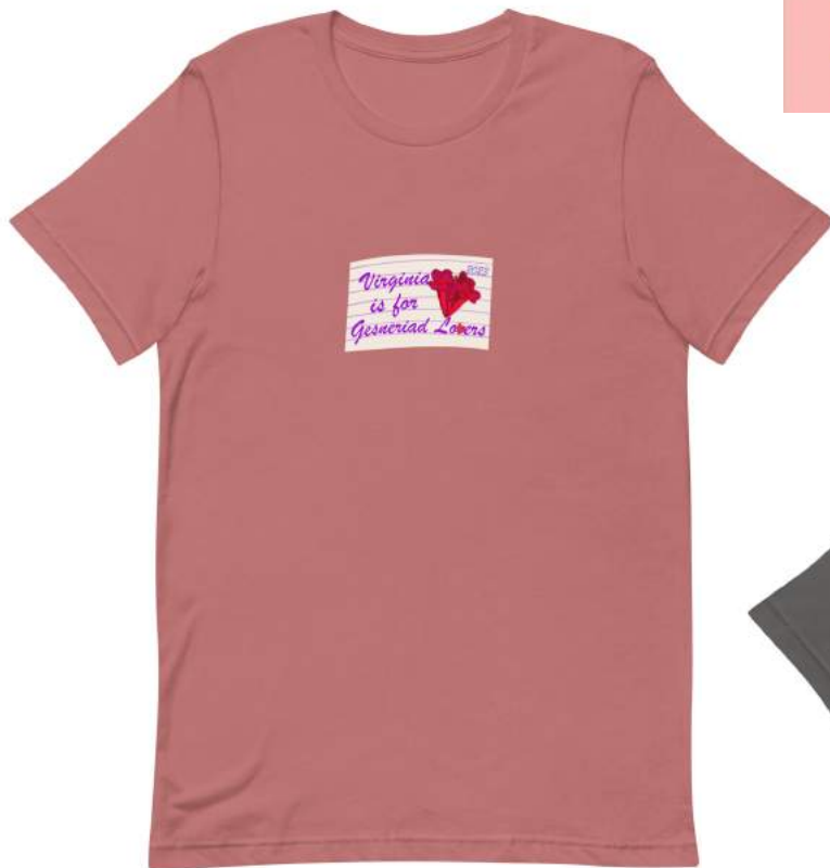
2023 Convention Logo shirt