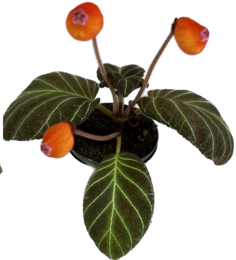
Pearcea hypocyrtiflora