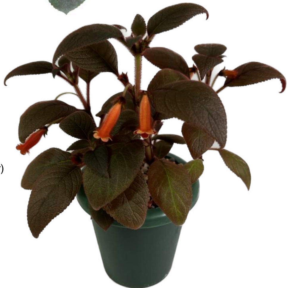
Pearcea species (Ecuador)