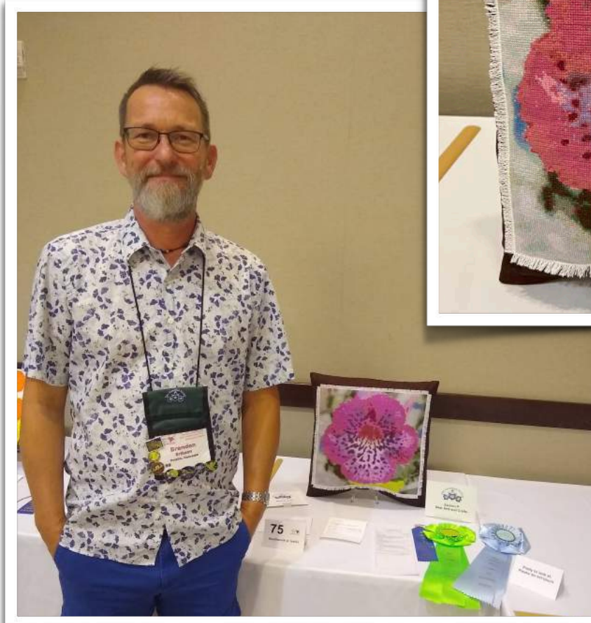
Sinningia seedling Cross-stitch Throw Pillow - Brandon Erikson