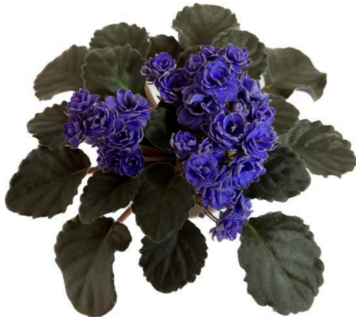
Saintpaulia 'Ness' Crinkle Blue' Kitty Hedgepeth