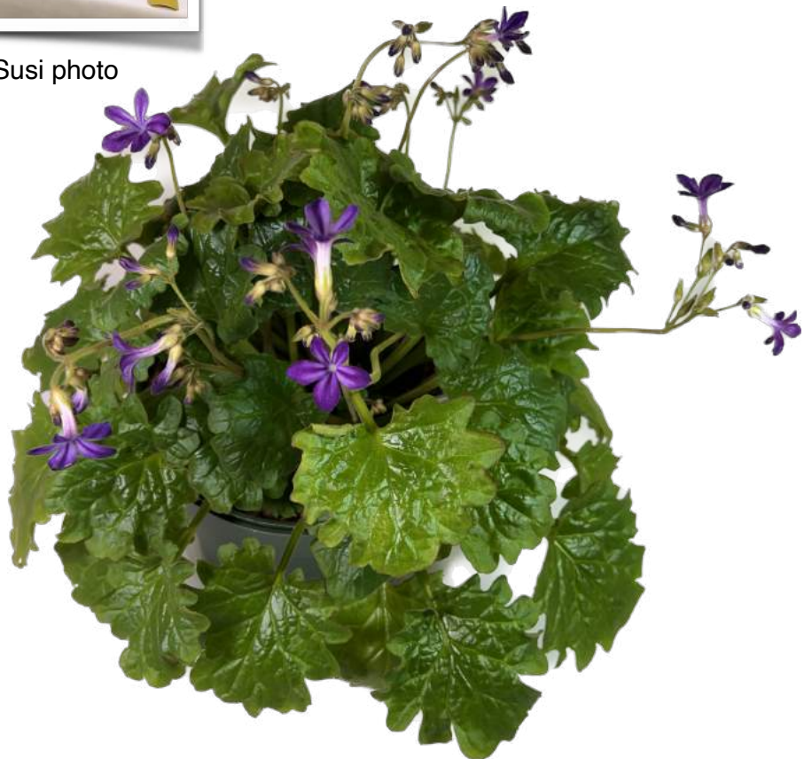
Primulina tabacum