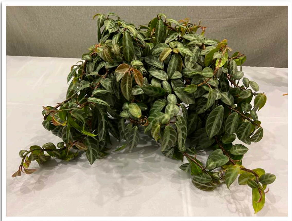
Drymonia ecuadorensis