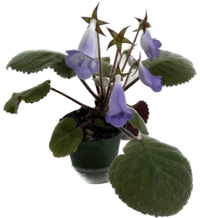
Sinningia speciosa 'Poco Purado'