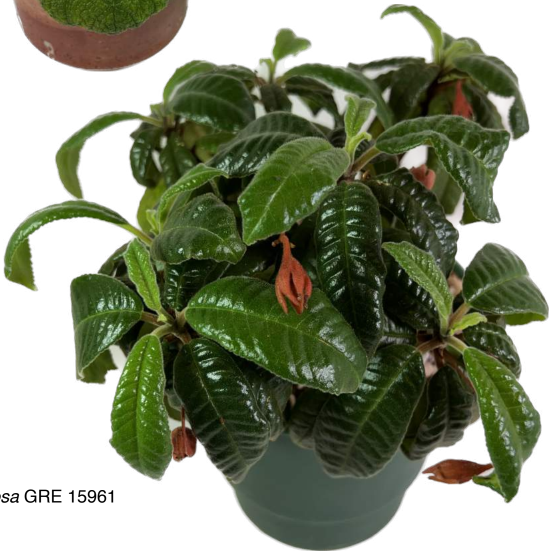
Gesneria glandulosa GRE 15961 Karyn Cichocki