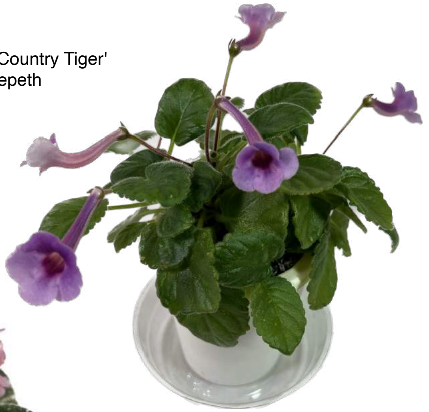
Sinningia 'Country Tiger' Kitty Hedgepeth