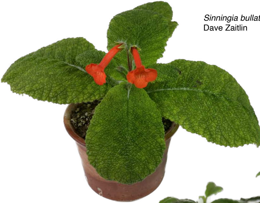
Sinningia bullata Cãnion Fortaleza