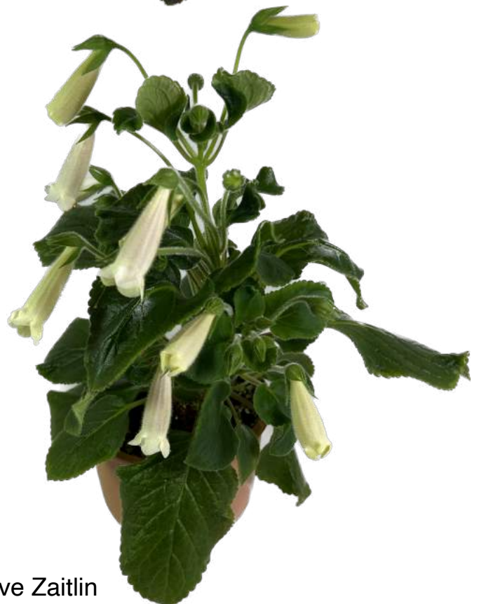
Sinningia 'Solstice'