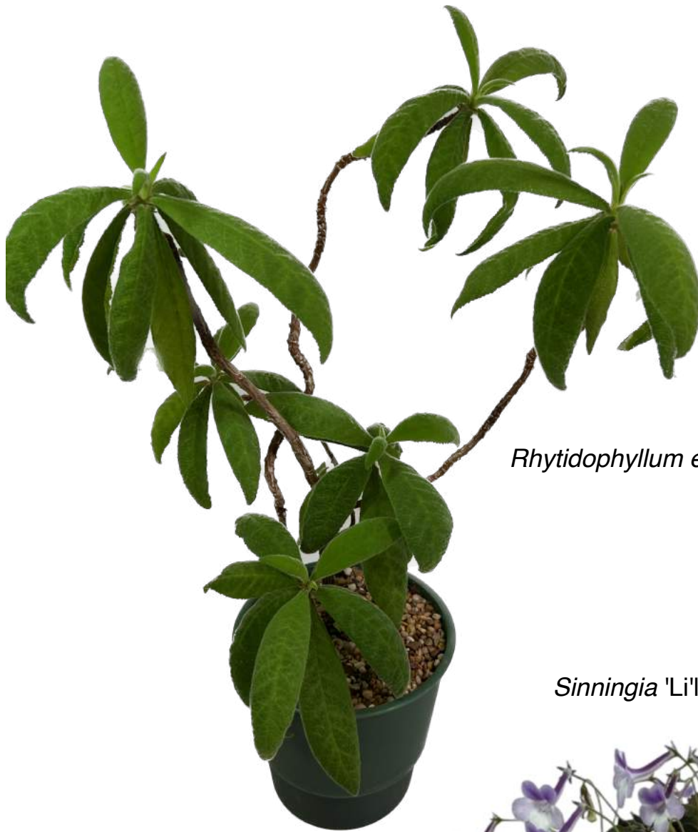
Rhytidophyllum exsertum - Karyn Cichocki