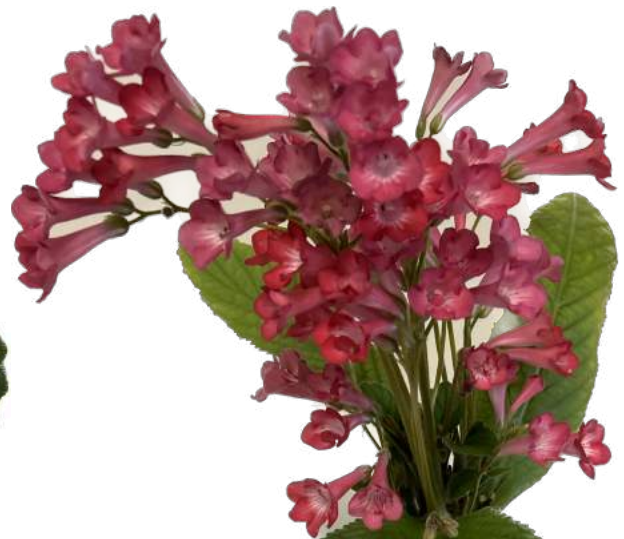
Streptocarpus 'Dale's Gingersnaps' Terri Vicenzi