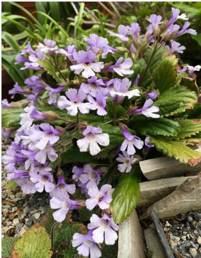
Haberlea rhodopensis