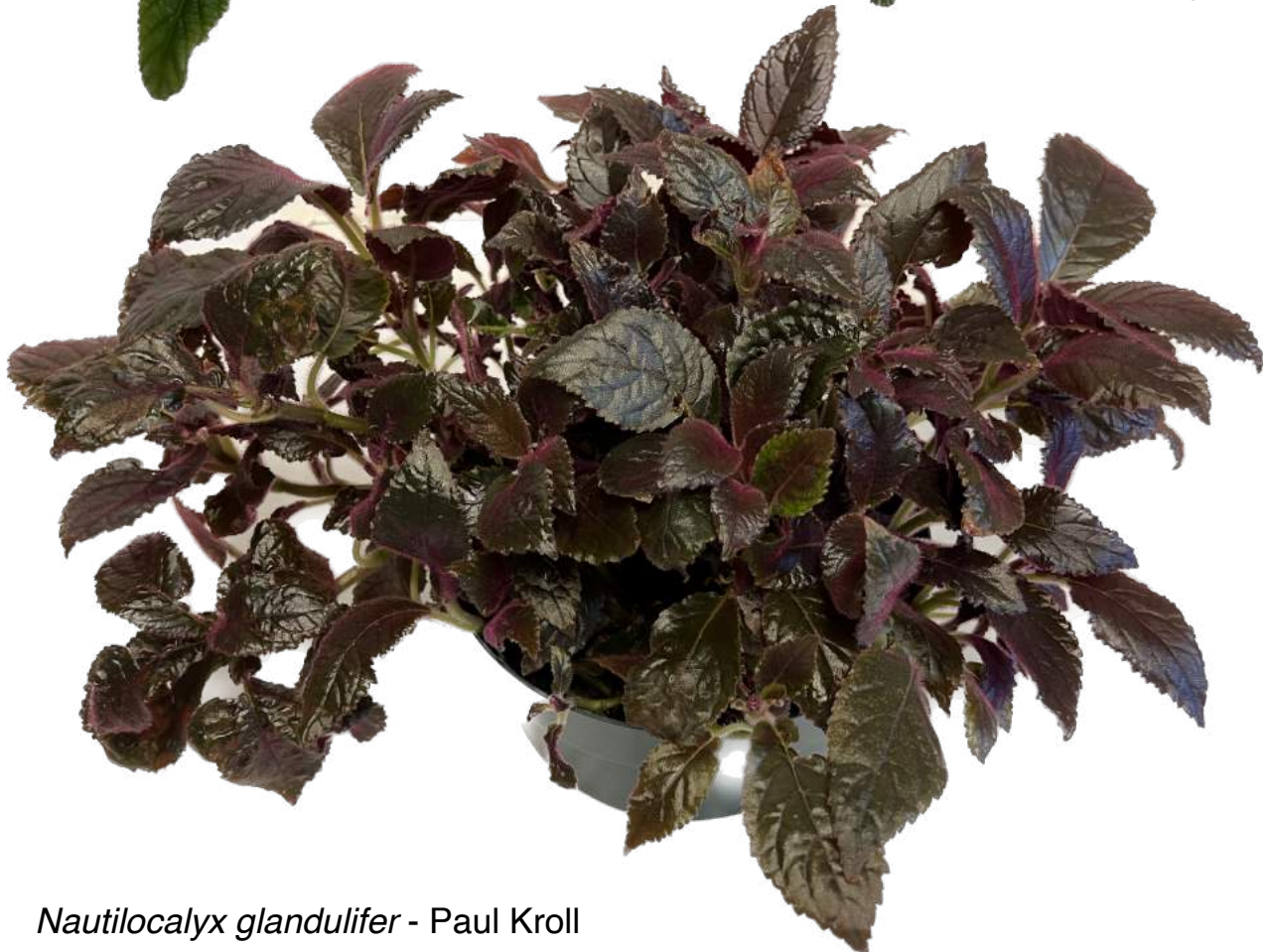
Nautilocalyx glandulifer