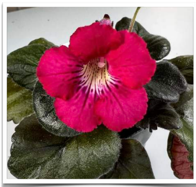
Sinningia 'Stone's Moulin Rouge'