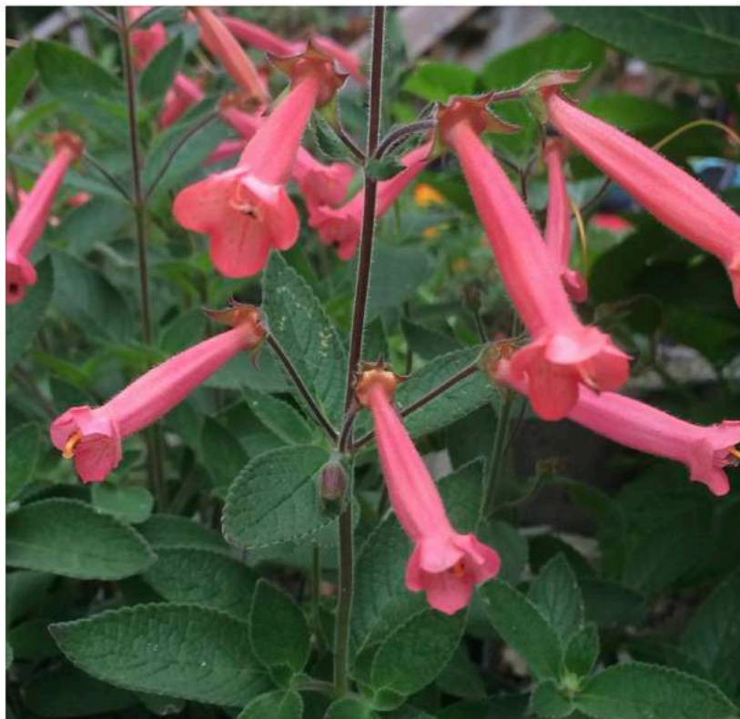
Sinningia 'Apricot Bouquet'