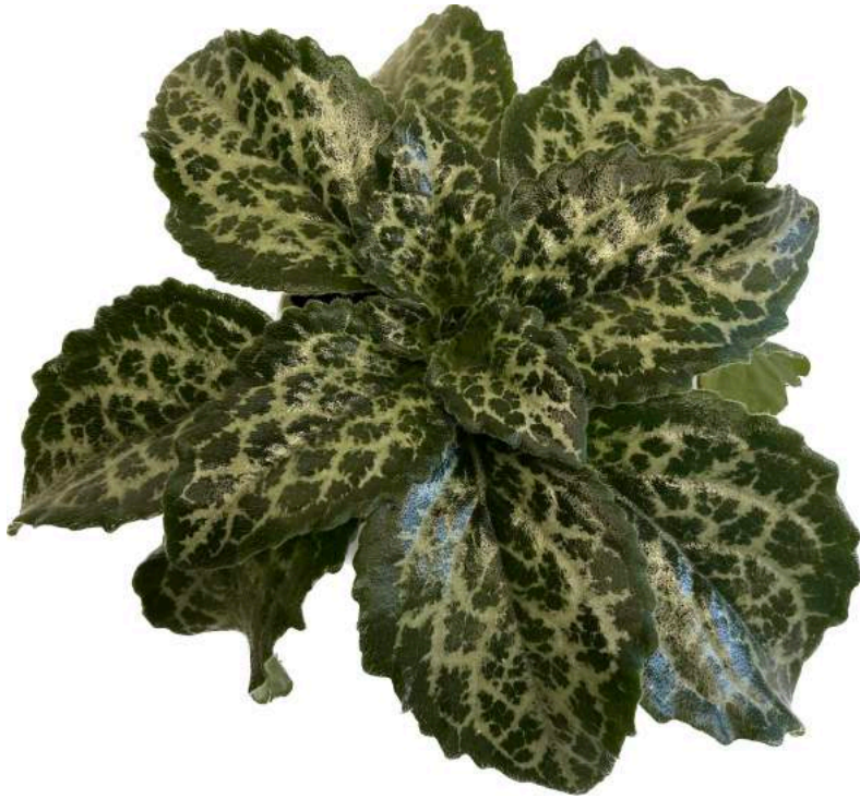
Primulina dryas 'Angustifolia'