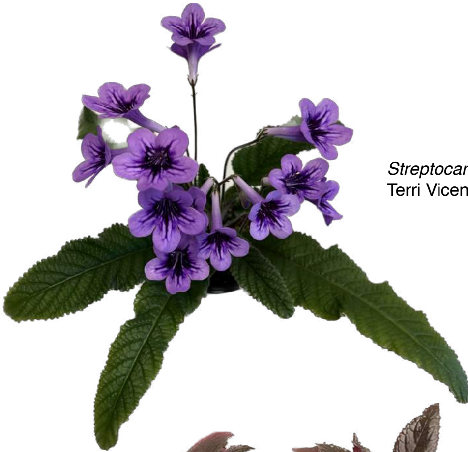
Streptocarpus 'Blueberry Butterfly' Terri Vicenzi