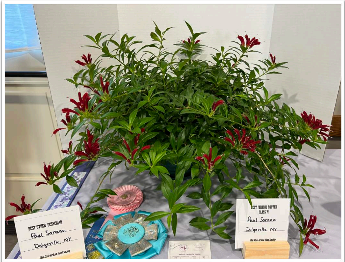
Aeschynanthus 'Big Apple' Paul Sorano Best other gesneriad