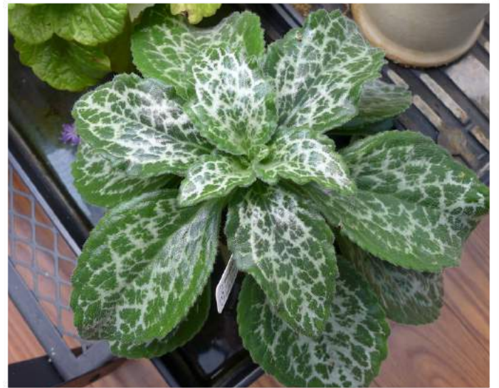
Primulina dryas 'Hisako'