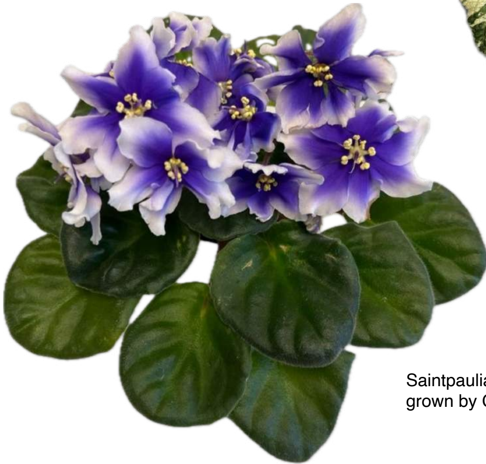
Saintpaulia 'Humako Inches' grown by Gwen Wallace