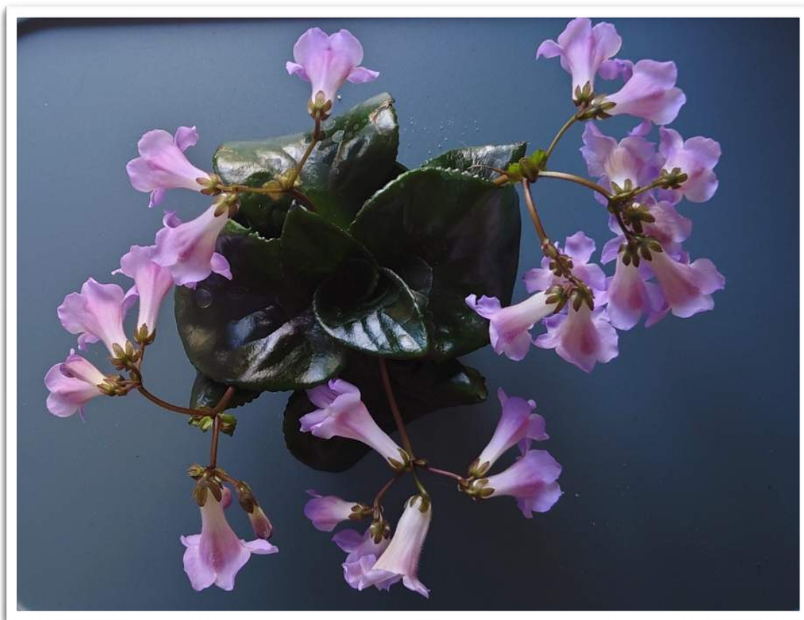
Primulina atropurpurea - grown by Ron Myhr, Ontario (Canada)

The People's Choice Selections can now be viewed on The Gesneriad Society website. This is the link to the page with their names and images, where there is also a link to the full show: link to winners and show . The photo below is just one of the show entries.