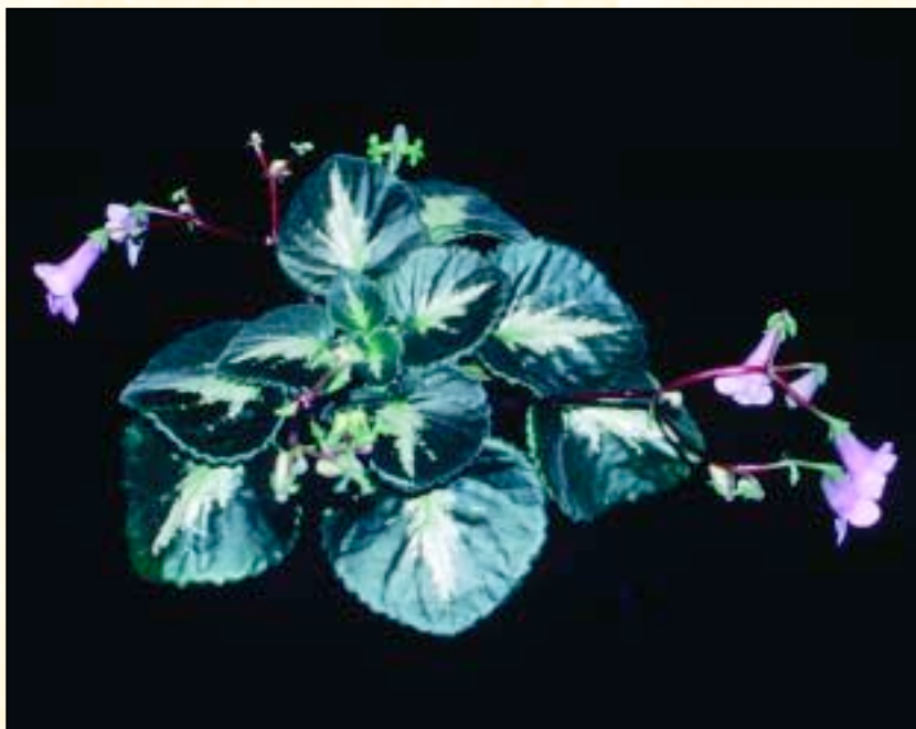
Chirita brassicoides 'Marble Leaf'