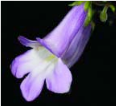
Chirita brassicoides 'Marble Leaf' close-ups of flower and leaf patterning